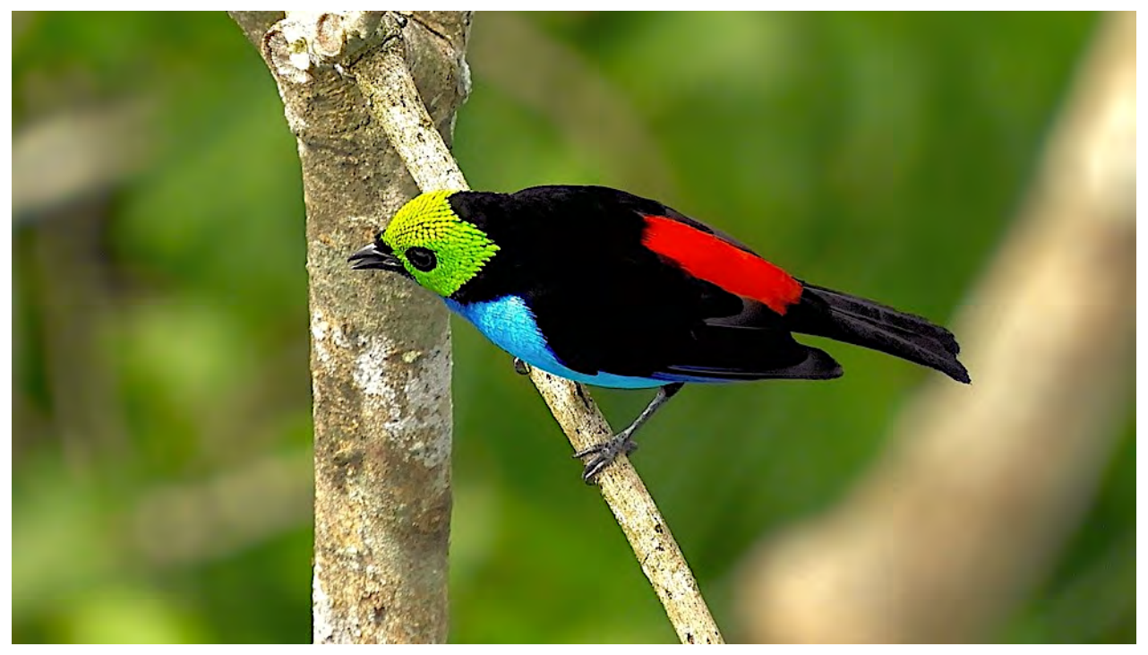
The Kapok Tower at Sacha Lodge allows us to get up close views of birds such as the stunning Paradise Tanager. These beauties are not rare, but as they are often high in the trees, we don't often get to see them this well.

I. January 5 - 14, 2024 II. July 31 – August 9, 2024