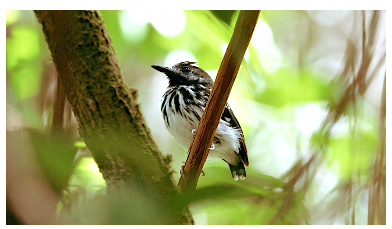
The Dot-backed Antbird is a species that is widespread across the Amazon basin, but it is not common. We had a wonderful look at this little beauty on a recent tour, and we'll be watching for it in 2024!

But Sacha's strengths are twofold: its canopy towers and its easy access to virtually a full range of river-created habitats, from lake margin, Mauritia palm swamp, river margin, and sandbars, to river-created islands, young and old. The "Orquidea trail," actually a blackwater stream that drains Pilchicocha, is one of the most enchanting canoe trails we've seen. It is narrow and perfectly reflective of the overhanging spiny palms and dark-green forest. It is hushed quiet punctuated by the occasional outburst of a Red Howler Monkey or the insistent calling of a territorial Dot-backed Antbird. We plan this tour to play to Sacha's strengths.