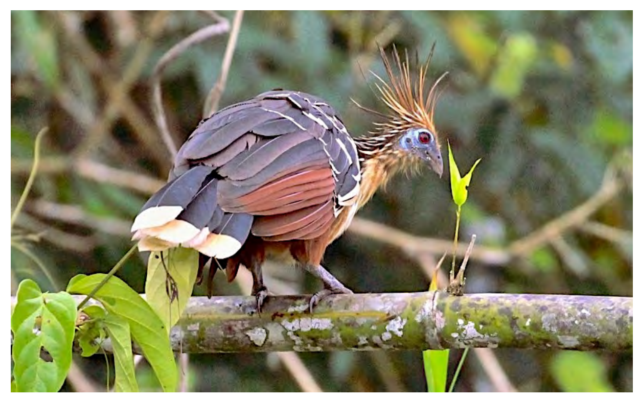
We'll be able to watch the antics of the bizarre Hoatzins from the dining area. These prehistoric-looking birds nest around the edges of the lagoon.

mellow whistling of the Tawny-bellied Screech-Owl. In 2020, Sacha Lodge began making a number of renovations to its property including adding A/C to its cabins, and we've been informed that all cabins now have air-conditioning!! An amazing new restaurant for dinner has also been added as well as a few other surprises. A limited number of singles are available at Sacha Lodge. Night at Sacha Lodge.