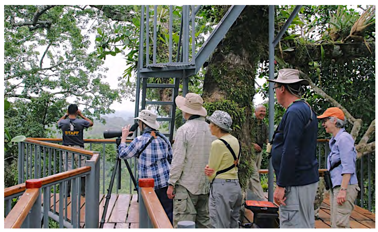
The canopy towers and walkway offer a chance to get up where the birds are!

We want to be sure you are on the right tour! Below is a description of the physical requirements of the tour. If you are concerned about the difficulty, please contact us about this and be sure to fully explain your concerns. We want to make sure you have a wonderful time with us, so if you are uncomfortable with the requirements, just let us know and we can help you find a better fitting tour! Field Guides will not charge you a change or cancellation fee if you opt out within 10 days of depositing.