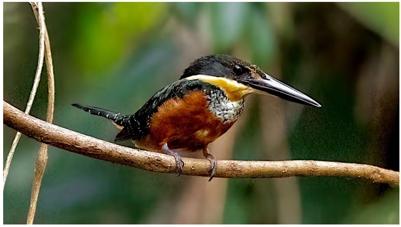
We'll spend time canoeing the waterways around Sacha looking for birds such as the beautiful Green-and-Rufous Kingfisher. These birds are widespread, but tend to be rather shy, so using the canoes might bring us better views.

But Sacha's strengths are twofold: its canopy towers and its easy access to virtually a full range of river-created habitats, from lake margin, Mauritia palm swamp, river margin, and sandbars, to river-created islands, young and old. The "Orquidea trail," actually a blackwater stream that drains Pilchicocha, is one of the most enchanting canoe trails we've seen. It is narrow and perfectly reflective of the overhanging spiny palms and dark-green forest. It is hushed quiet punctuated by the occasional outburst of a Red Howler Monkey or the insistent calling of a territorial Dot-backed Antbird. We plan this tour to play to Sacha's strengths.