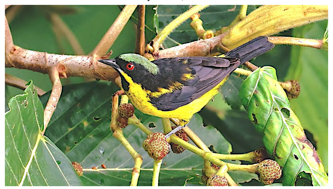
The Kapok Tower at Sacha Lodge allows us to get up close views of birds such as the stunning Yellow-bellied Dacnis. These beauties are Amazonian specialists that are generally uncommon, but we've had some good looks on our tour.

I. January 7 - 16, 2025 II. July 3 - 12, 2025