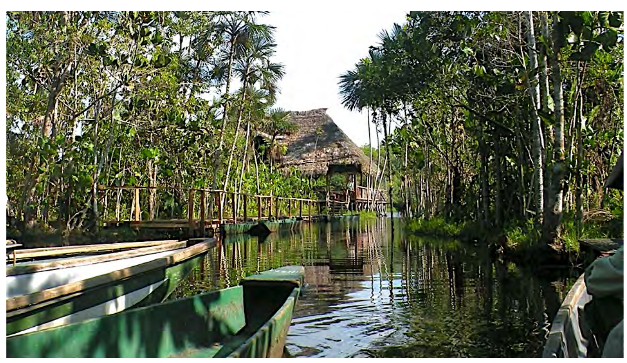
To reach Sacha Lodge, we'll take a canoe trip down the Napo River, and take a boardwalk through the forest, so you'll want to keep your binoculars handy!

Day 2, Thu, 8 Jan, or Fri, 3 Jul. To Sacha Lodge. After breakfast at the hotel we will transfer to the airport for our flight to Coca, usually departing around mid-morning. Our 35-minute flight takes us from the inter-montane highlands of the Quito valley across the eastern cordillera of the Andes. On a clear day you can see snow-capped Volcan Cayambe to the north, gorgeous Volcan Antisana, and in the distance to the south the perfect crater of Volcan Cotopaxi. As we descend to Ecuador's Oriente, we'll see some nice expanses of undisturbed forest where the eastern foothills spill into the Amazonian lowlands before we arrive at Coca, frontier oil town and jumping-off point for Amazonian exploration in Ecuador. We will travel dressed for birding (rubber boots not required), as we'll be birding on the river en route and along the boardwalk between the river landing and the lodge upon arrival. (Our luggage will be transported by lodge staff so that we can be comfortably unencumbered.) The weather should be cool in Quito and warm and humid in Coca and for the duration of our stay in Amazonia.