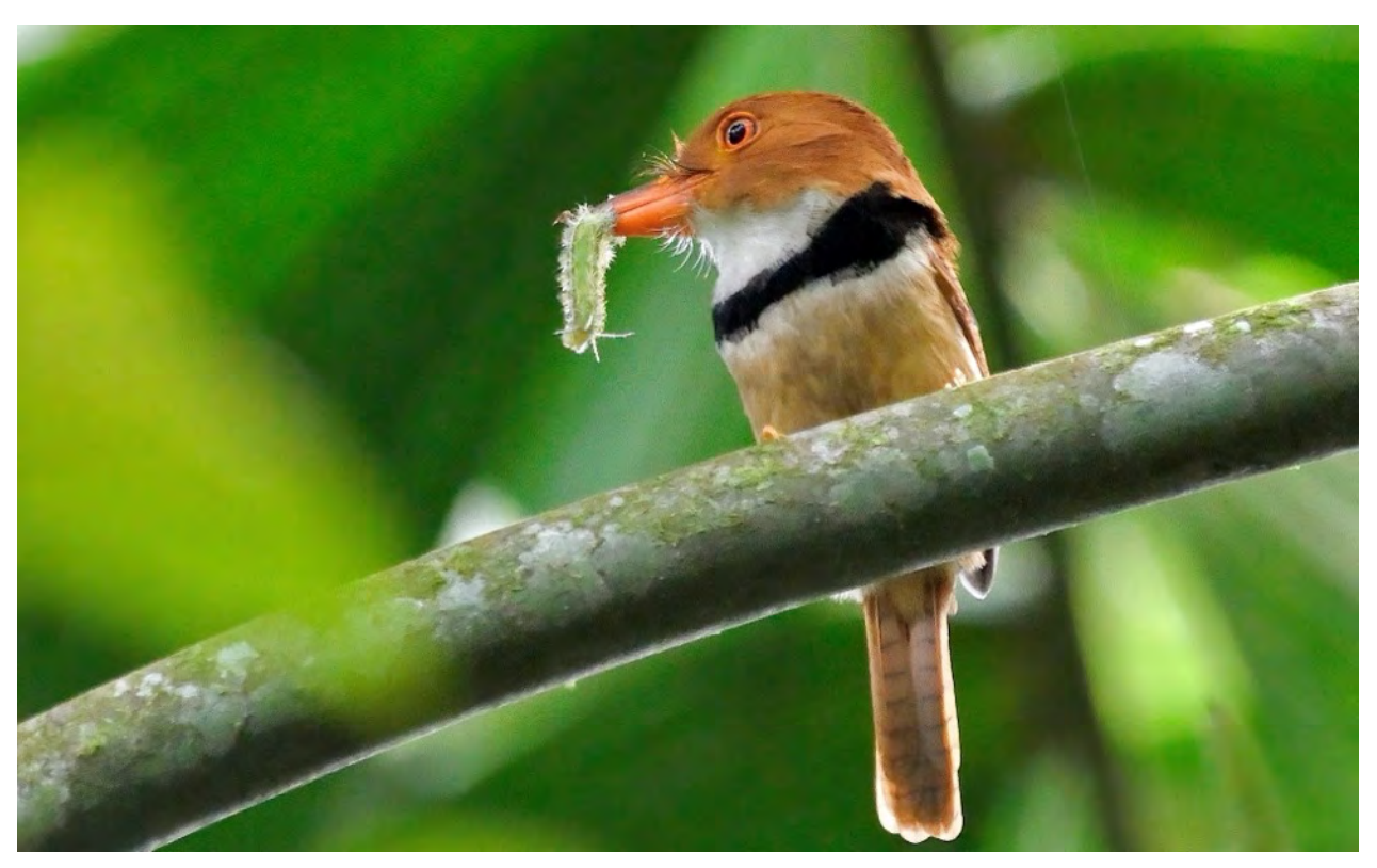
The Collared Puffbird has a wide distribution, but it is uncommon. We've gotten good views of this sit-and-wait predator at Sacha.

Situated along the north bank of the giant Rio Napo, one of the three major tributaries that combine to form the upper Amazon, Sacha Lodge is located only two hours down-river from the Amazonian frontier town of Coca. It's accessible from Quito in a 30-minute flight over the crest of the eastern Andes (spectacular if clear). The broad meander plain between the Napo and the Aguarico River to the north is low-lying and filled with a number of blackwater inlets and classic Amazonian oxbow lakes (called cochas in the native Quechua dialect), overlooking one of which sits Sacha. Sacha is reached from the banks of the Napo by a thirty-minute walk along the riverbank and then on an elevated boardwalk through palm-rich swamp forest, followed by a twenty-minute ride in locally crafted dugout canoes along a narrow inlet that opens onto picturesque Pilchicocha. On the opposite bank stands the lodge itself, our base for exploring the many habitats of Amazonia. A network of trails from the lodge offers easy (if sometimes muddy!) access to a wonderful expanse of seasonally flooded forest ( varzea ) and to one of the finest canopy platforms we have encountered anywhere, opening a whole new dimension to formerly earth-bound birders.