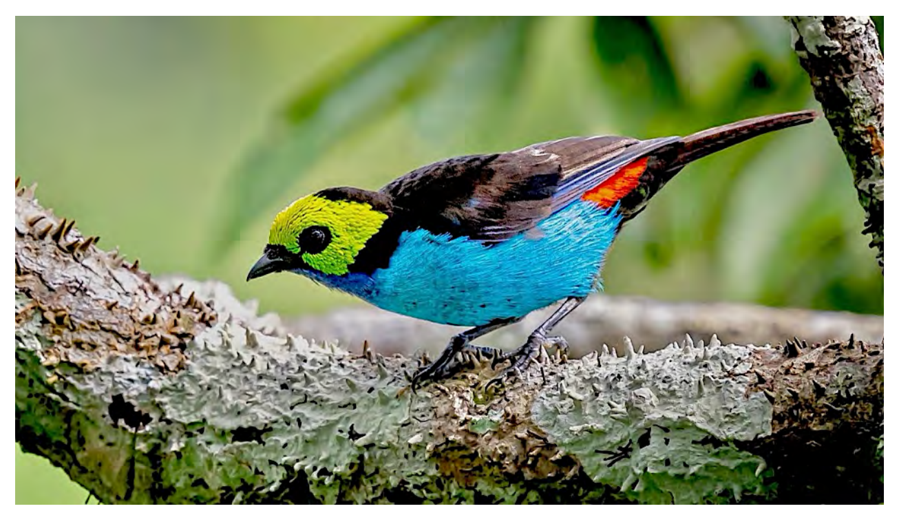
We'll spend time on the wonderful canopy towers at Sacha, where we'll be at eye-level with such beauties as the Paradise Tanager.

mellow whistling of the Tawny-bellied Screech-Owl. In 2020, Sacha Lodge began making a number of renovations to its property, including adding air-conditioning to all of its cabins!! An amazing new restaurant for dinner has also been added, as well as a few other surprises. A limited number of singles are available at Sacha Lodge. Night at Sacha Lodge.