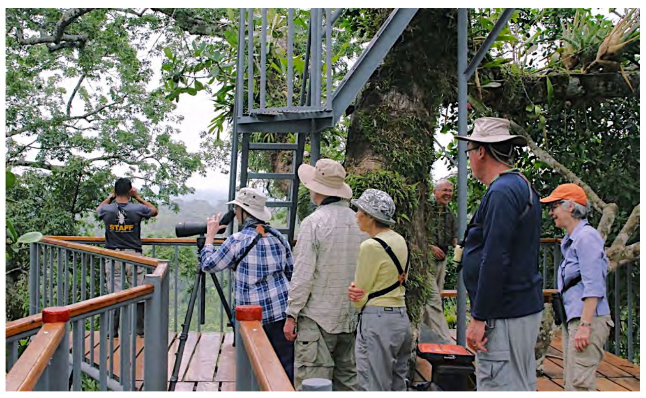
The canopy towers and walkway offer a chance to get up where the birds are!

We want to be sure you are on the right tour! Below is a description of the physical requirements of the tour. If you are concerned about the difficulty, please contact us about this and be sure to fully explain your concerns. We want to make sure you have a wonderful time with us, so if you are uncomfortable with the requirements, just let us know and we can help you find a better fitting tour! Field Guides will not charge you a change or cancellation fee if you opt out within 10 days of depositing.