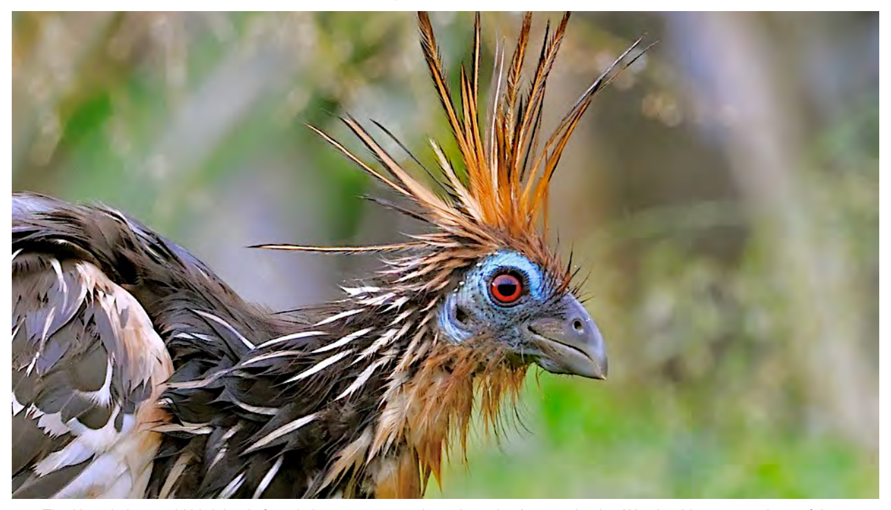
The Hoatzin is an odd bird that is found along waterways throughout the Amazon basin. We should get great views of these characters at Sacha Lodge, as they nest around the cocha.

I. January 7 - 16, 2026 II. July 2 - 11, 2026