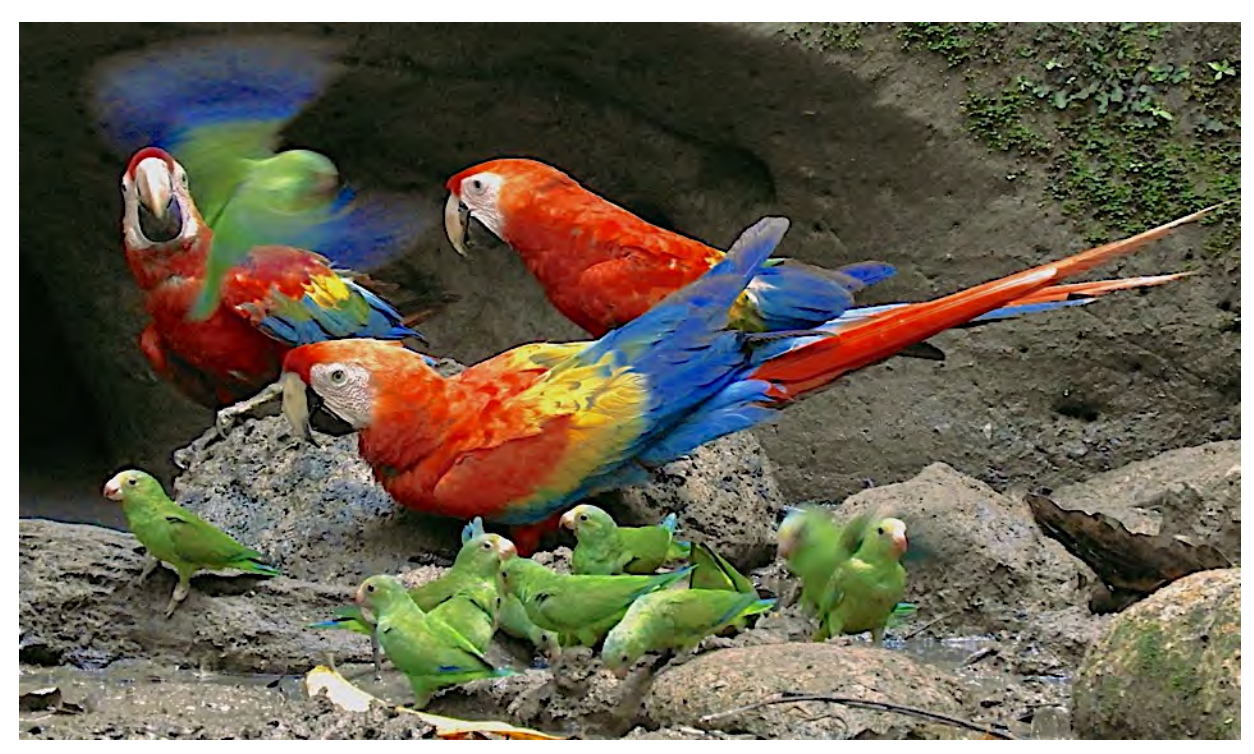
We will visit a clay lick in the forest that draws in large flocks of Cobalt-winged Parakeets as well as large Scarlet Macaws. It's an amazing experience to see and hear!