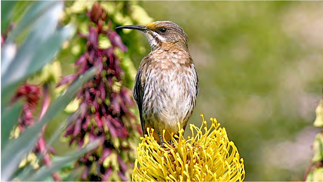
Cape Sugarbird is an endemic we'll seek early on the tour.