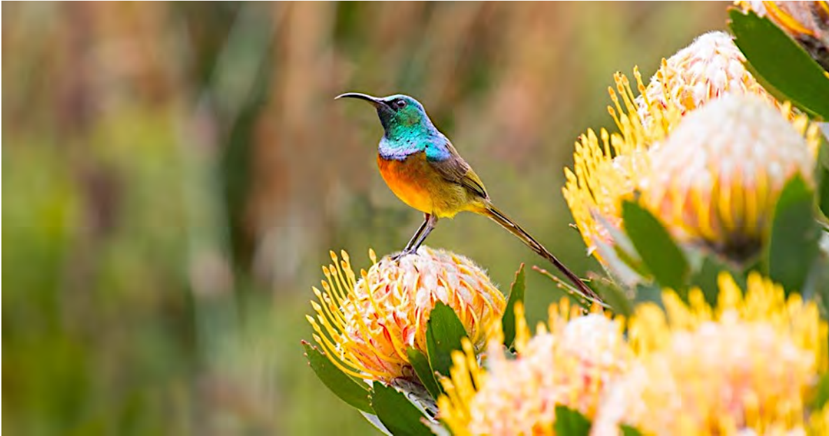
Dazzling flowers and gorgeous birds, that's what the Fynbos habitat provides. Here, an Orange-breasted Sunbird perches on a Leucospermum (pincushion) in the Kirstenbosch Botanical Gardens.