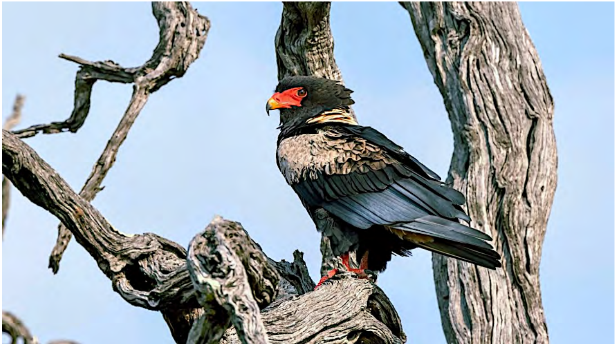
The impressive Bateleur is one of the raptors we'll watch for on the drive to Satara Camp in Kruger National Park.

Day 9, Sun, 10 Sep. This should be a memorable day as we take a long but very scenic drive to our next camp Satara, first traveling along the riparian habitats of the Sabie River stopping off at the Lower Sabie Camp for breakfast and a leg stretch before heading further north. On the first leg of the day's journey mammals preferring the wooded habitats should be seen. These include Greater Kudu, Waterbuck, Bushbuck, Nyala and hopefully Leopard. On the journey north to Satara Camp the vegetation progressively becomes more open and the typical plains game and birds should start appearing. We will be looking out for the likes of Ostrich, Kori Bustard, Secretarybird and Ground Hornbill. Typical savannah mammals such as Blue Wildebeest, Common Zebra and Impala should be plentiful. Some of the smaller birds that are fairly common in the savannahs around Satara Camp include Red-billed Oxpecker, Southern Cordonbleu, Swainson's Spurfowl, Rattling Cisticola, Brown-headed Parrot, Sabota Lark, Burchell's Starling, Black-crowned Tchagra and Chestnut-backed Sparrowlark. Large raptors are also well represented here with Bateleur, African Hawk-Eagle, Brown Snake-Eagle and Tawny Eagle seen on most days. A light lunch will be taken at a tearoom en-route and we should reach Satara Camp by late afternoon. A pre-dinner wine sampling session will be a fine way to end our final night in the national park. Night in thatched cottages in the Satara Camp .