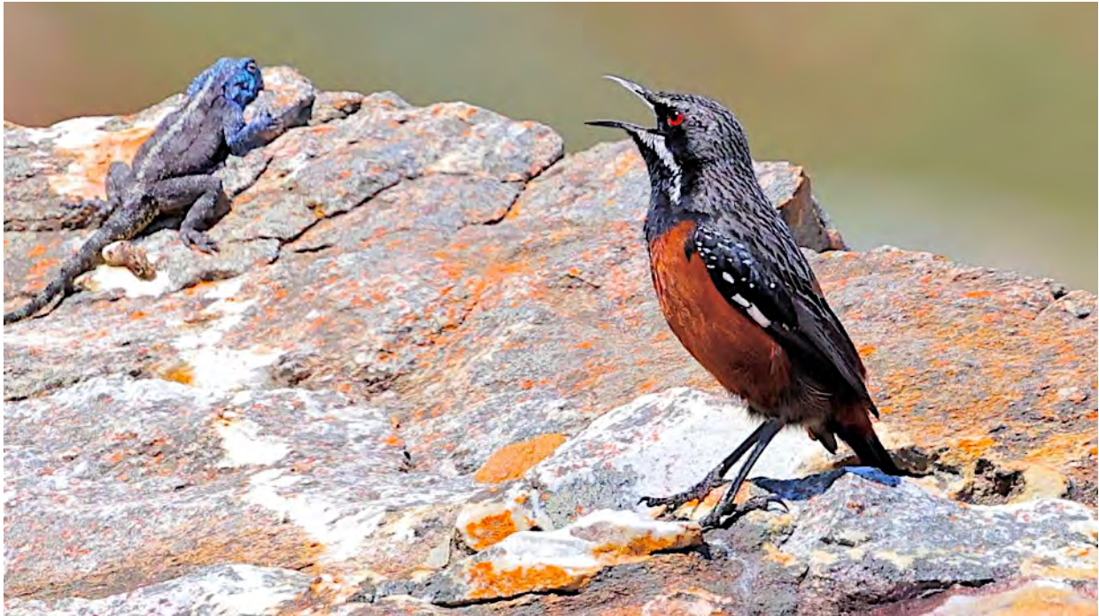
The perky Cape Rockjumper is a sought-after endemic and one of two species that make up a unique bird family found only in South Africa and Lesotho.

Day 5, Wed, 6 Sep. We take a day trip around the very scenic False Bay route to the hamlet of Rooi-Els where a walk of a mile or so along a stony track should produce sightings of the endemic Cape Rock-Jumper along with Ground Woodpecker, Orange-breasted Sunbird, Cape Bunting, White-necked Raven and Cape Rock Thrush. The smallest Protea of them all grows along this track beside colourful Pelargoniums , Helichrysums and Salvias . At the town of Betty's Bay we visit the African Penguin colony at Stony Point which also features four Cormorant species, three of which, the Bank, Cape and Crowned are endemic. We'll also spend some quality time in the lovely Harold Porter Botanical Garden with its natural fynbos vegetation and attractive views of the mountains and ocean before returning to our hotel for Dinner. Night at The Vineyard Hotel.