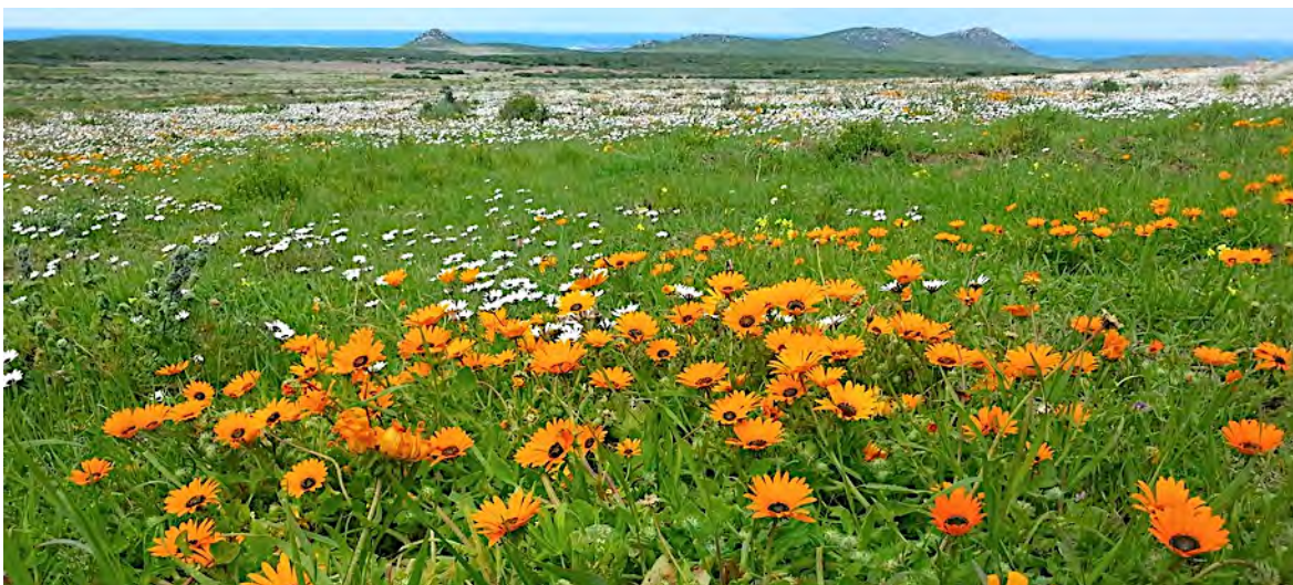
West Coast wildflowers.

If you are uncertain about whether this tour is a good match for your abilities, please don’t hesitate to contact our office; if they cannot directly answer your queries, they will put you in touch with your guide, or help you find the tour that is right for you!