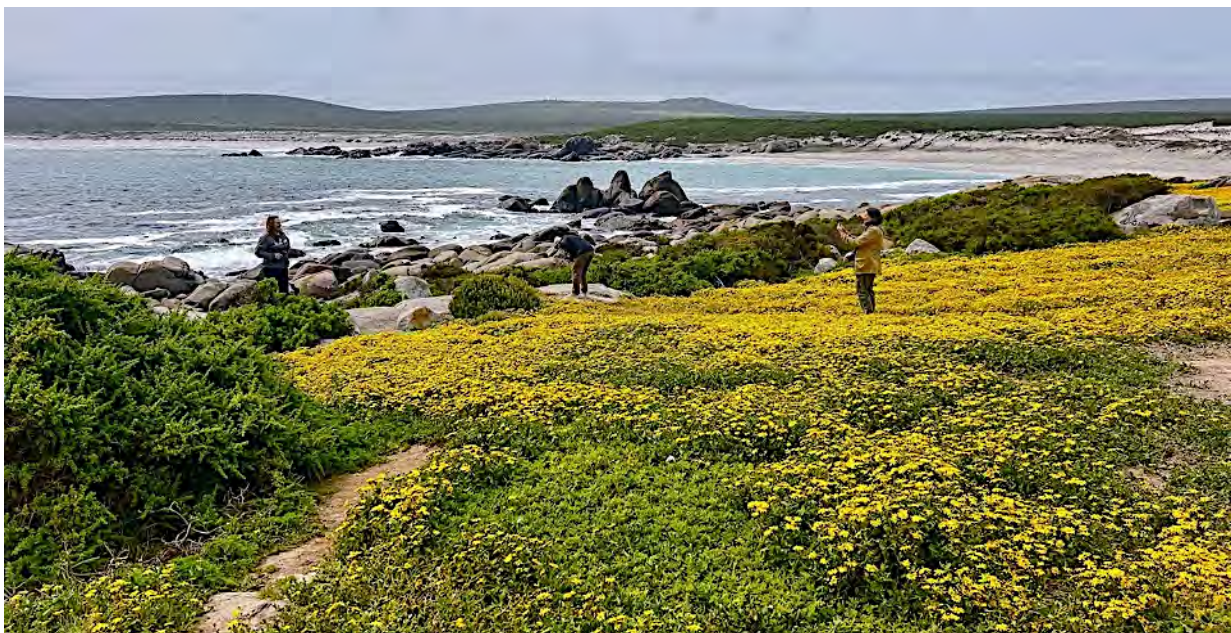
Wildflowers at West Coast National Park can be spectacular!

If you are uncertain about whether this tour is a good match for your abilities, please don’t hesitate to contact our office; if they cannot directly answer your queries, they will put you in touch with your guide, or help you find the tour that is right for you!