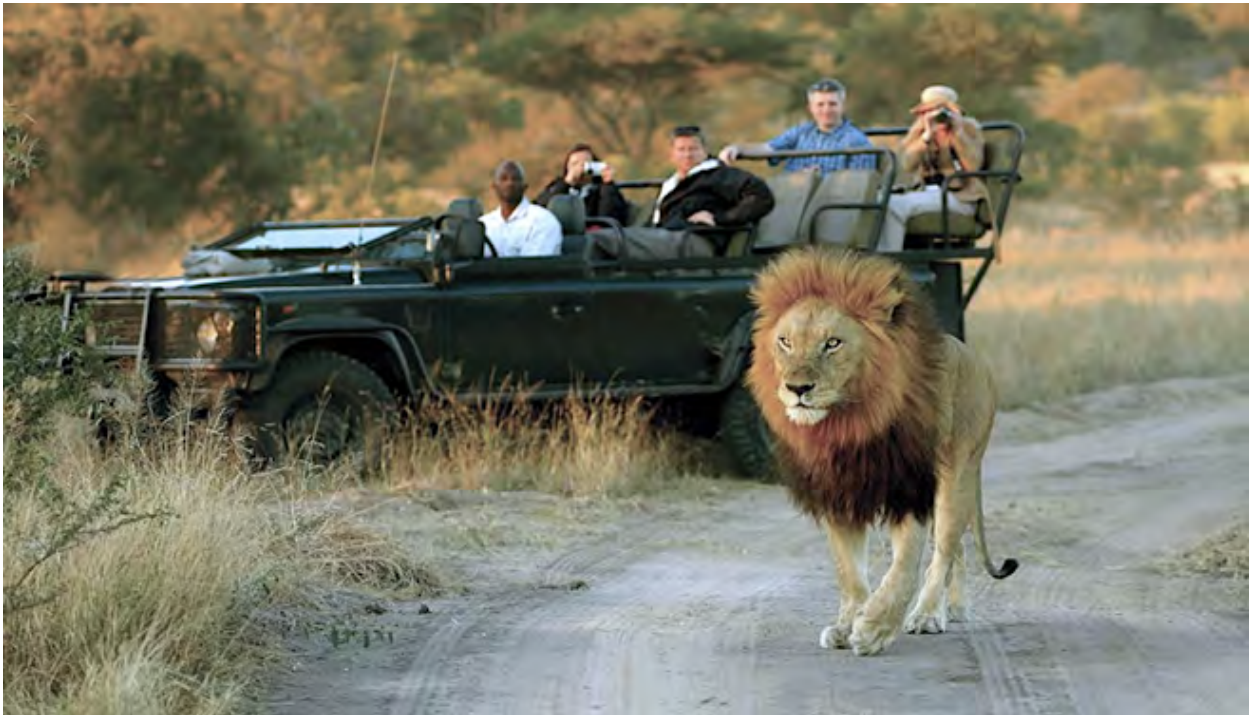
We'll use safari vehicles for our excursions in and around Kruger National Park, while in other areas, we'll travel in comfortable VW Kombi vans.

To sum up, this tour combines the enjoyment of experiencing the scenic splendor, the floral magic, the avian diversity and the spectacular wildlife of South Africa, all over a good glass of wine!