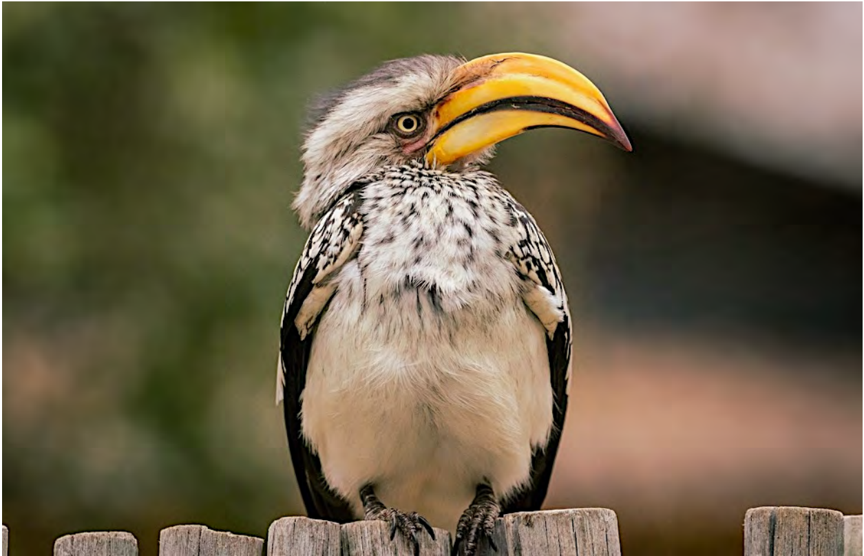
The Southern Yellow-billed Hornbill is common in the area around Kruger National Park.