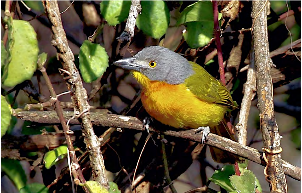
Bushshrikes are a family endemic to Africa. The Gray-headed Bushshrike is one of several members of this family that we will look for on the tour.

Day 11, Tue, 9 Sep. We start the day with the traditional safari style coffee and biscottis before setting out in search of Rhino, Leopard and Lion, three mammals for which this area is well known. The deciduous woodlands here are good for a great variety of passerines, including Southern White-crowned Shrike, Cape Penduline-Tit, Red-headed Weaver, White-browed Scrub-Robin, Chin-spot Batis, Black-backed Puffback, Ashy Flycatcher, Golden-breasted Bunting and Black Cuckooshrike. In spite of being in the bush in the dry season, we won't forget the wildflower component of the tour and some winter-flowering plants such as Aloes , Euphorbias and the stunning Impala Lilies Adenium multiflorum will be targeted during our excursions. Through the heat of the day we have the option of taking a nap or watching game come into the camp waterhole for a drink. This afternoon's excursion will extend beyond sunset with the intention of seeing some nocturnal species, including owls and nightjars. Mammals that are often seen here after dark include Large Spotted Genet, African Civet, Lesser Bushbaby, Scrub Hare and African Porcupine. On our last evening in the bush we will take pleasure in some final wine tasting and a bush barbeque under the stars. Night in a private lodge in the Klaserie Game Reserve.