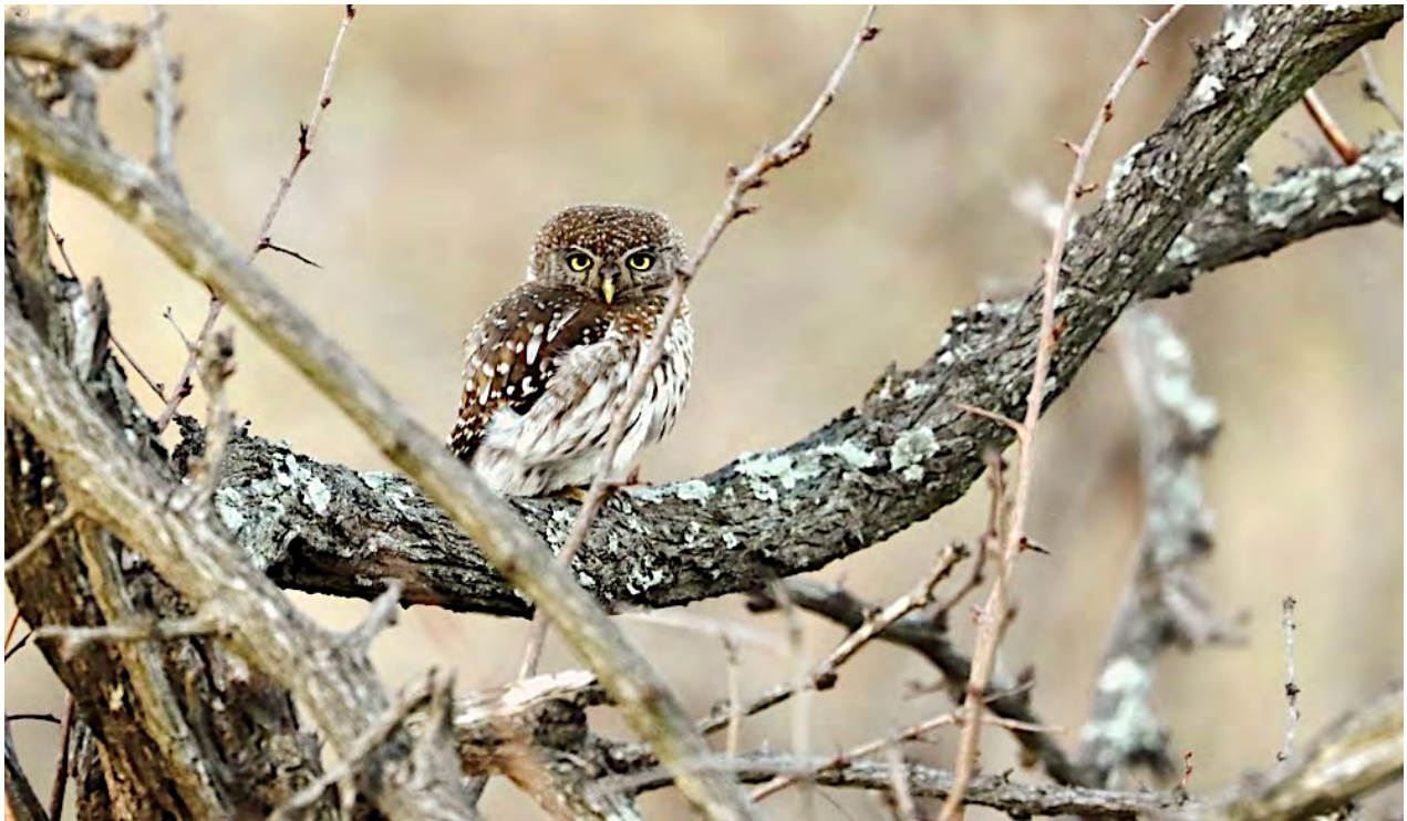
The tiny Pearl-spotted Owlet is a diurnal predator that we'll watch for at Skukuza Camp in Kruger National Park.

Day 9, Sun, 7 Sep. This should be a memorable day as we take a long but very scenic drive to our next camp, Satara, first traveling along the riparian habitats of the Sabie River, stopping off at the Lower Sabie Camp for breakfast and a leg stretch before heading further north. On the first leg of the day's journey, mammals preferring the wooded habitats should be seen. These include Greater Kudu, Waterbuck, Bushbuck, Nyala and hopefully Leopard. On the journey north to Satara Camp, the vegetation progressively becomes more open and the typical plains game and birds should start appearing. We will be looking out for the likes of Ostrich, Kori Bustard, Secretarybird and Ground Hornbill. Typical savannah mammals such as Blue Wildebeest, Common Zebra and Impala should be plentiful. Some of the smaller birds that are fairly common in the savannahs around Satara Camp include Red-billed Oxpecker, Southern Cordonbleu, Swainson's Spurfowl, Rattling Cisticola, Brown-headed Parrot, Sabota Lark, Burchell's Starling, Black-crowned Tchagra and Chestnut-backed Sparrowlark. Large raptors are also well represented here, with Bateleur, African Hawk-Eagle, Brown Snake-Eagle and Tawny Eagle seen on most days. A light lunch will be taken at a tearoom en-route and we should reach Satara Camp by late afternoon. A pre-dinner wine sampling session will be a fine way to end our final night in the national park. Night in thatched cottages in the Satara Camp.