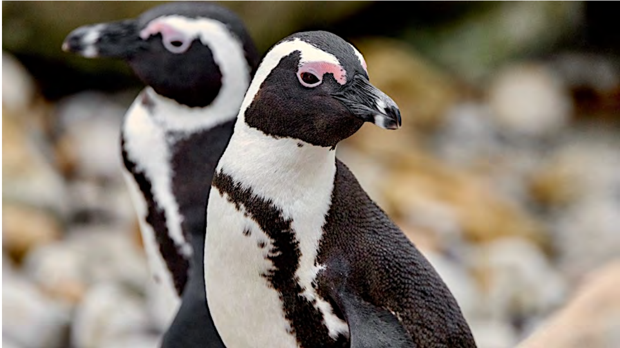
The African Penguin is a near endemic, found in small colonies along coastal South Africa. These birds are considered endangered, due to a number of factors such as habitat loss and disturbance, oil spills, and over-fishing of their food source. Luckily, there are several colonies in South Africa that are protected where we can see these adorable birds.

We include here information for those interested in the 2025 Field Guides South Africa – Birds, Wine and Wildflowers tour: