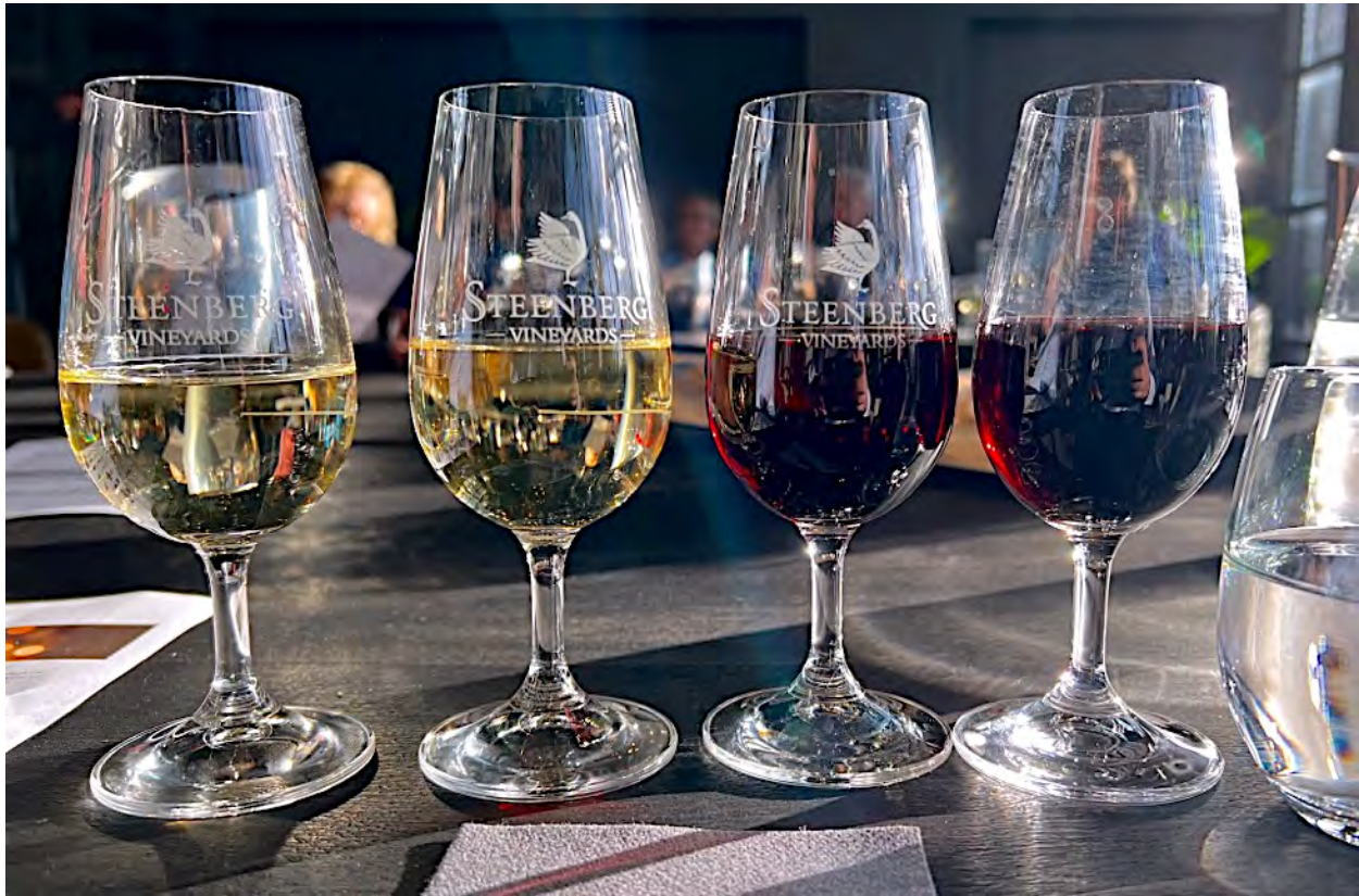
We'll visit the Steenberg Estate for a wine-tasting while we are in the Cape region.

Day 5, Wed, 3 Sep. We take a day trip around the very scenic False Bay route to the hamlet of Rooi-Els where a walk of a mile or so along a stony track should produce sightings of the endemic Cape Rock-Jumper along with Ground Woodpecker, Orange-breasted Sunbird, Cape Bunting, White-necked Raven and Cape Rock Thrush. The smallest Protea of them all grows along this track beside colorful Pelargoniums , Helichrysums and Salvias . At the town of Betty's Bay, we visit the African Penguin colony at Stony Point which also features four Cormorant species, three of which, the Bank, Cape and Crowned are endemic. We'll also spend some quality time in the lovely Harold Porter Botanical Garden with its natural fynbos vegetation and attractive views of the mountains and ocean before returning to our hotel for Dinner. Night at The Vineyard Hotel.