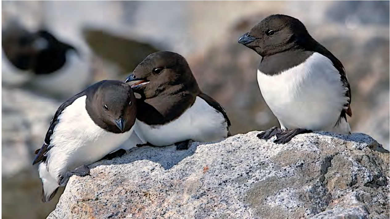
Many seabirds nest on the cliffs of the Svalbard Archipelago, and we'll have a chance to see several species of alcids, including the tiny Dovekie.

We include here information for those interested in the 2023 Field Guides Spitsbergen & Svalbard Archipelago cruise: