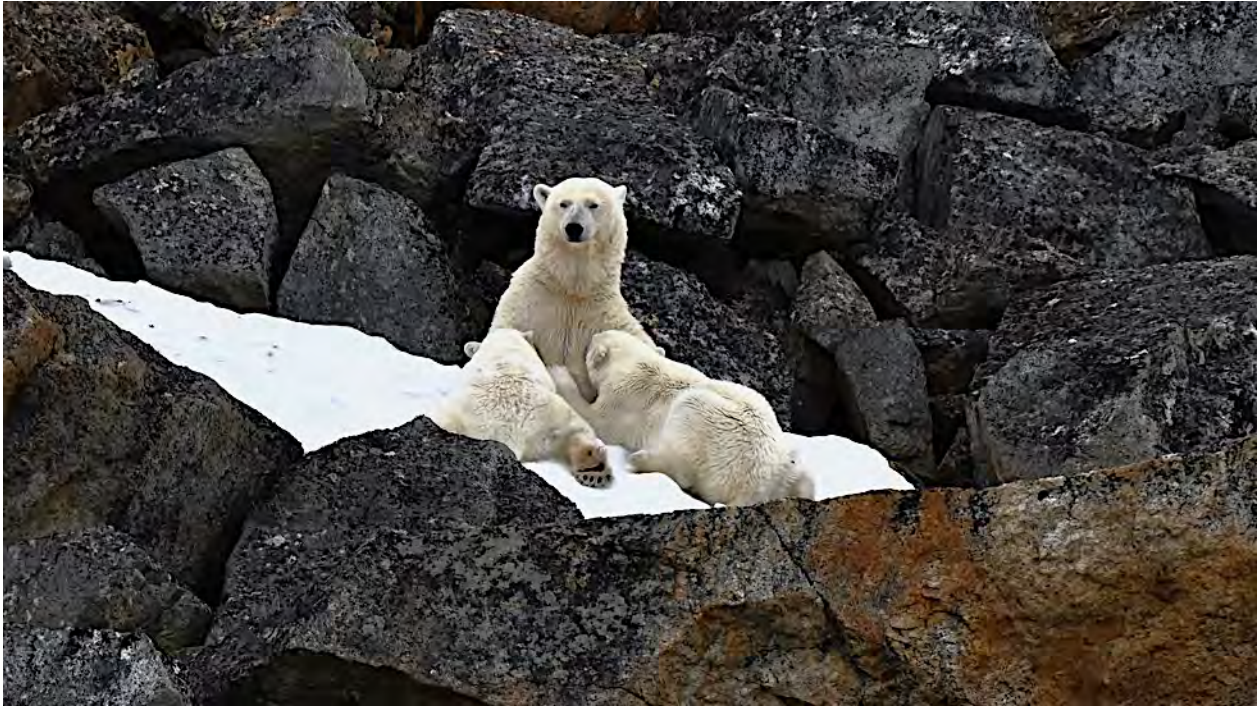
Spitsbergen may be one of the best places on earth to see Polar Bears, and we've had some amazing experiences with them on recent tours. This female nursing her cubs was seen in 2022.

Pre-tour accommodations and expenses in Oslo are not covered in the tour fee and will be at the clients' expense. The "Land Fee" portion of the tour cost will cover the pre-cruise night in Longyearbyen on July 5 and the post-cruise night of July 15 in Oslo.