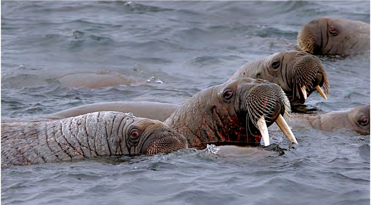
Walrus are one of the iconic mammals of the Arctic, and we'll visit several areas where we may find them lounging on the beach, or swimming to cool off.

Day 10, Thu, 13 July. Hornsund in southern Spitsbergen. We start the day quietly cruising the side fjords of the spectacular Hornsund area of southern Spitsbergen, enjoying the scenery of towering mountain peaks. Hornsundtind rises to 4700 ft., while Bautaen shows why early Dutch explorers gave the name “Spitsbergen” (pointed mountains) to the island. There are also 14 magnificent glaciers in the area and very good chances of encounters with seals, Polar Bear, and Dovekie.