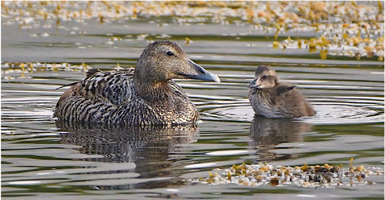
On the tidal flats near Longyearbyen, we'll watch for birds such as this female Common Eider and her fluffy chick.

In the afternoon we'll sail to the small town of Ny Ålesund, the world's most northerly settlement. Once a mining community served by the world's northernmost railway, which can still be seen, Ny Ålesund is now an Arctic research center. Near the town is a breeding ground for Barnacle and Pink-footed geese and Arctic Terns, and the ponds around town might produce a few shorebirds and, perhaps, Red-throated Loon. Visitors interested in the history of Arctic exploration may want to walk to the anchoring mast used by Amundsen and Nobile on the airship Norge before their flights to the North Pole in 1926.