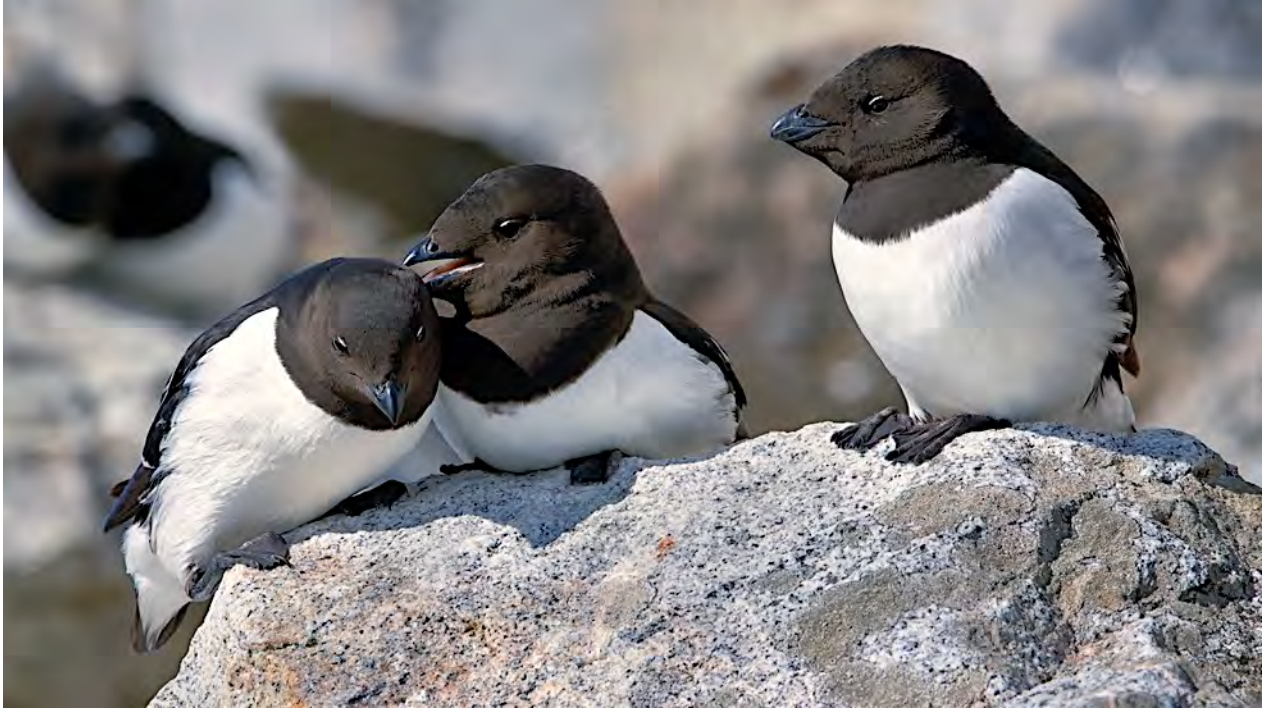
Many seabirds nest on the cliffs of the Svalbard Archipelago, and we'll have a chance to see several species of alcids, including the tiny Dovekie.

tens of thousands of Black Guillemots and Thick-billed Murres, with Atlantic Puffins, Dovekies, Northern Fulmars, and Black-legged Kittiwakes also in abundance on or around the cliffs. On the flowering tundra, Arctic Terns, Common Ringed Plovers, Purple Sandpipers, Great Skua, and jaegers thrive alongside fantastic scenery. And then there are those elusive gulls—Sabine’s, and the ghostly Ivory, a bird so dependent on ice-covered environs it seems to have mystical qualities. Spitsbergen’s coastal waters support several seal species including Bearded and Ringed, and the small Beluga, or white whale, and Minke, Fin and even Blue whales are often seen. Walrus can be found lounging on the ice-floes and on the beaches, and the lush tundra is home to the indigenous Svalbard Reindeer and Arctic Fox. And, with 20 percent of the world’s Polar Bear population, one of the largest carnivores in the world, we have excellent opportunities to see these magnificent creatures. Each of our past tours has had several sightings of this most engaging of mammals.