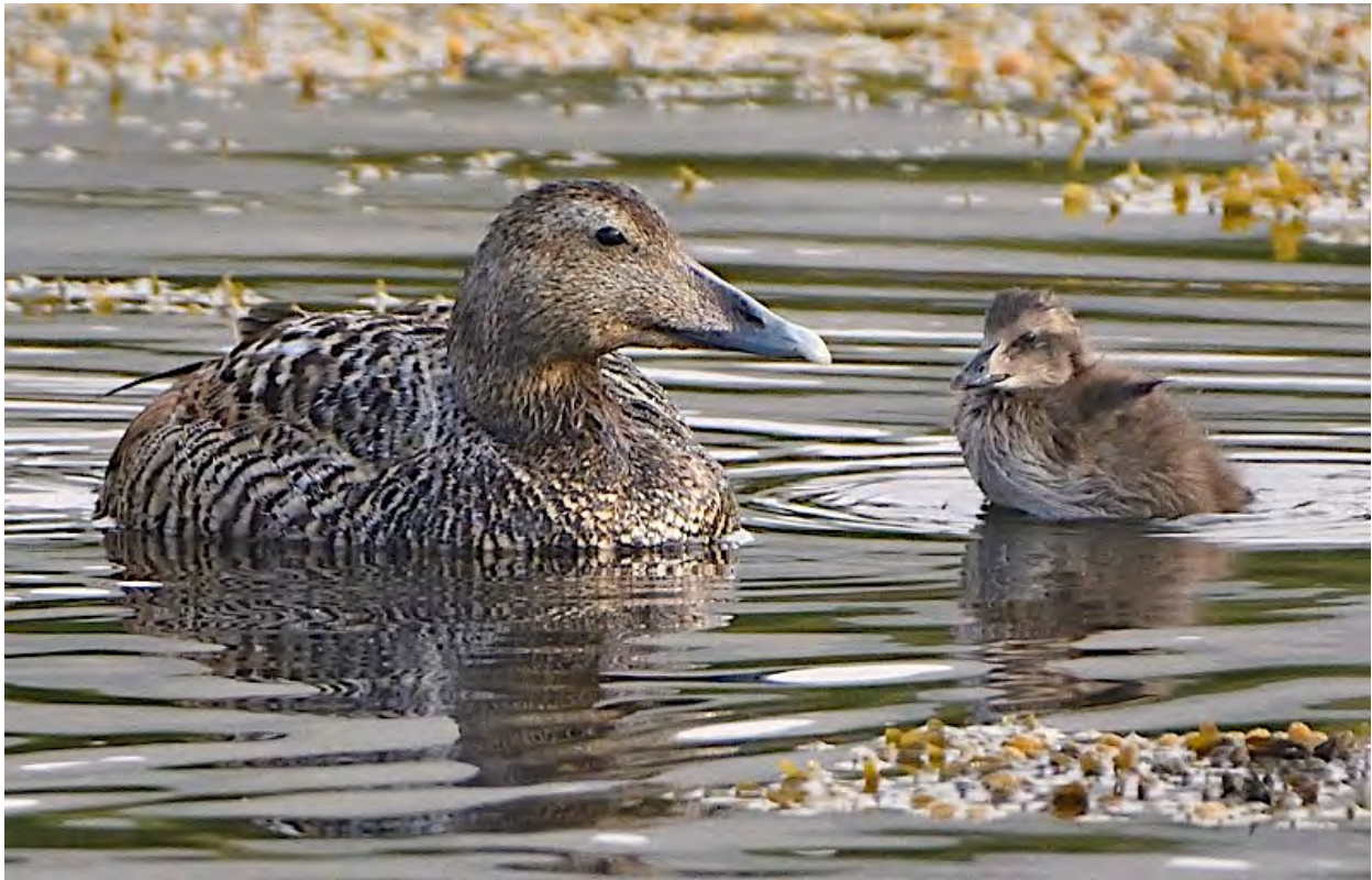
On the tidal flats near Longyearbyen, we'll watch for birds such as this female Common Eider and her fluffy chick.

Day 3, Thu, 4 July. Longyearbyen; boarding the ship in the afternoon. After breakfast at the hotel, we will do another bird walk in the vicinity of Longyearbyen, where Ivory Gull is a distinct possibility, and have more time to explore the town. It doesn't take long. After checking out of our rooms in the late morning, we will store our luggage at the hotel before having lunch in town. Lunch will be on your own today (see information bulletin). Later in the afternoon we will retrieve our luggage and transfer to the pier to board Plancius , usually about 4:00 pm. After getting settled into our cabins there will be a required safety and lifeboat drill before we set sail, and we will have dinner as we head out of Isfjorden. All nights will be on the Plancius .