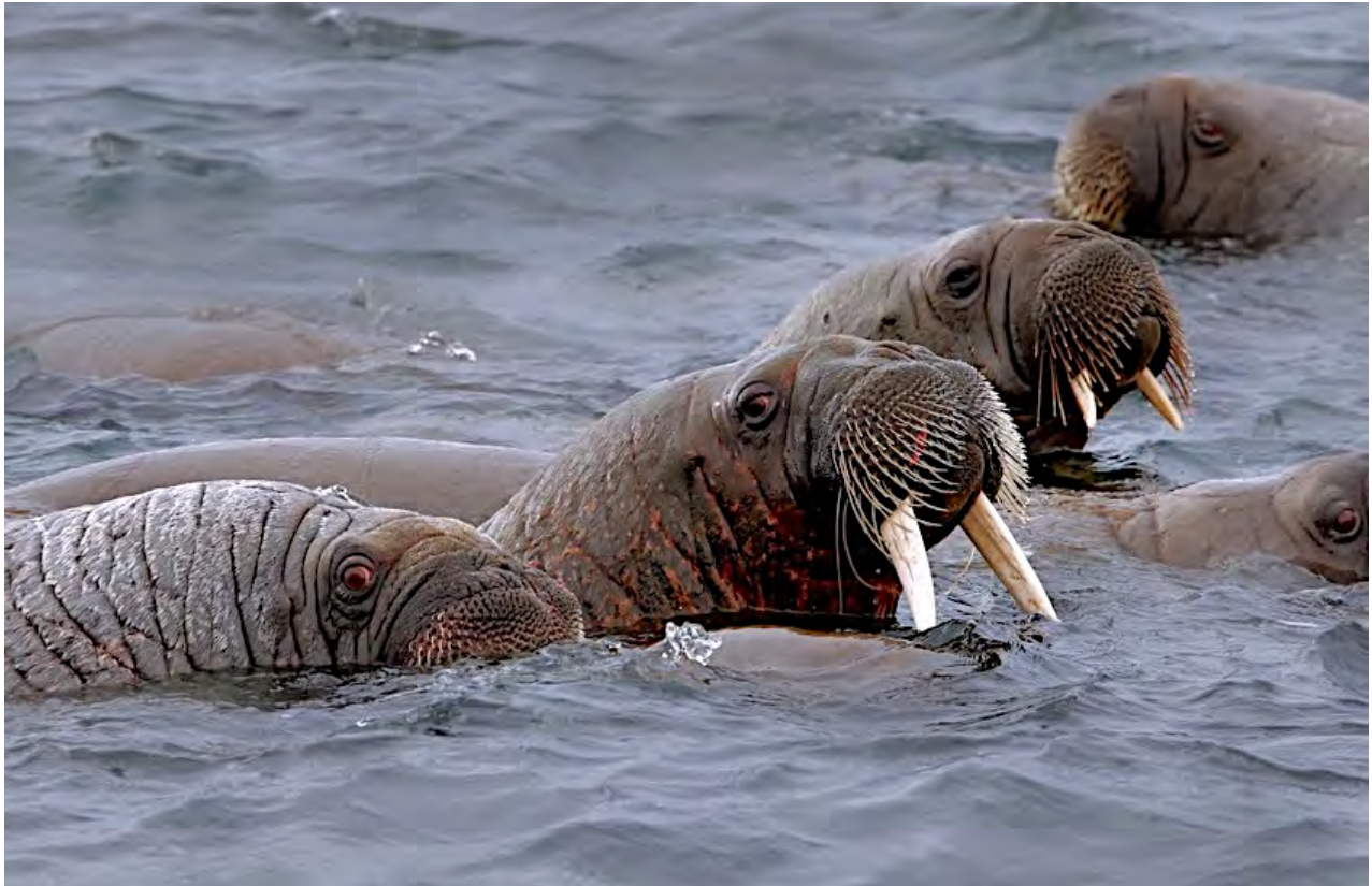
Walrus are one of the iconic mammals of the Arctic, and we'll visit several areas where we may find them lounging on the beach, or swimming to cool off.

Days 6-7, Sun-Mon, 7-8 July. Landing at Phippsøya, into the pack ice north or west of Phippsøya. We will have our northernmost landing at Phippsøya in the Seven Islands north of Nordaustlandet. Here, we will be at 81 degrees north, roughly 600 miles from the geographic North Pole. Polar Bears inhabit this region, along with Walrus, and perhaps, Ivory Gulls. After landing, we will sail to the pack ice and cruise the edge. We may sit for several hours in the pack ice, taking in our spectacular surroundings and watching for Polar Bears and Ivory Gulls near the ship. When the edge of the pack ice is several miles north of the Seven Islands, we will spend a second day to get to and in the sea ice. Alternatively, we may also visit Sorgfjord where we may find a herd of Walrus not far from the graves of 17th century whalers. We may encounter Rock Ptarmigan on a shore visit here.