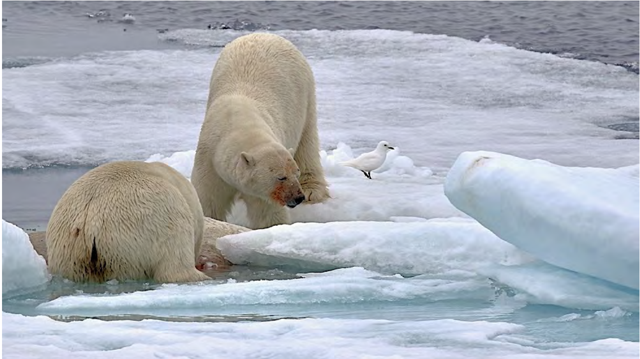
The Polar Bear and the Ivory Gull, two icons of the high Arctic, will be on our list of must-see animals. We've had excellent experiences with both on recent tours.

We include here information for those interested in the 2024 Field Guides Spitsbergen & Svalbard Archipelago cruise: