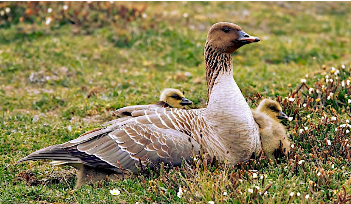
Pink-footed Geese and other waterfowl will be nesting on the tundra during our visit.

If you are uncertain about whether this tour is a good match for your abilities, please don't hesitate to contact our office; if they cannot directly answer your queries, they will put you in touch with the guide.