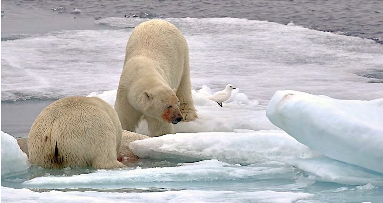
The Polar Bear and the Ivory Gull, two icons of the high Arctic, will be on our list of must-see animals. We've had excellent experiences with both on recent tours.

In the afternoon we'll sail to the small village of Ny Ålesund, the world's most northerly settlement. Once a mining community served by the world's northernmost railway, which can still be seen, Ny Ålesund is now an Arctic research center. Near the town is a breeding ground for Barnacle and Pink-footed geese and Arctic Terns, and the ponds around town might produce a few shorebirds and, perhaps, Red-throated Loon. Visitors interested in the history of Arctic exploration may want to walk to the anchoring mast used by Amundsen and Nobile on the airship Norge before their flights to the North Pole in 1926.