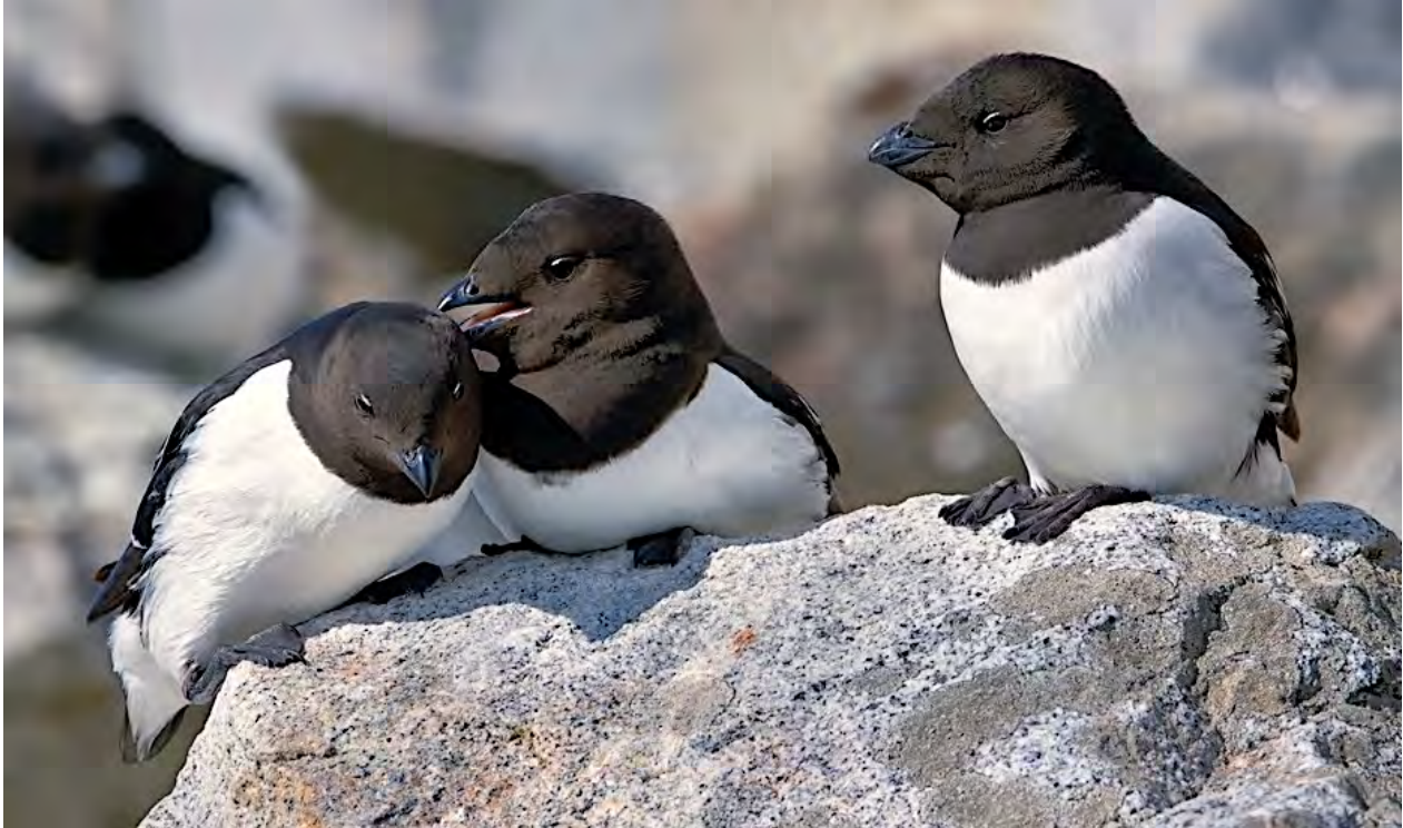
We'll see several species of alcids, including the tiny Dovekie.

Known as a region that is uncompromising to those species that inhabit it, the Arctic is one of the most beautiful and yet least birded areas of the world. The list of birds occurring in the far North is small when compared to tropical reaches, but the quality of the species is great. The magnificent bird cliffs along the Spitsbergen coast are a breeding ground for tens of thousands of Black Guillemots and Thick-billed Murres, with Atlantic Puffins, Dovekies, Northern Fulmars, and Black-legged Kittiwakes also in abundance on or around the cliffs. On the flowering tundra, Arctic Terns, Common Ringed Plovers, Purple Sandpipers, Great Skua, and jaegers thrive alongside fantastic scenery. And then there are those elusive gulls—Sabine’s, and the ghostly Ivory, a bird so dependent on ice-covered environs it seems to have mystical qualities. Spitsbergen’s coastal waters support several seal species including Bearded and Ringed, and the small Beluga, or white whale, and Minke, Fin and even Blue whales are often seen. Walrus can be found lounging on the ice-floes and on the beaches, and the lush tundra is home to the indigenous Svalbard Reindeer and Arctic Fox. And, with 20 percent of the world’s Polar Bear population, one of the largest carnivores in the world, we have excellent opportunities to see these magnificent creatures. Each of our past tours has had several sightings of this most engaging of mammals.