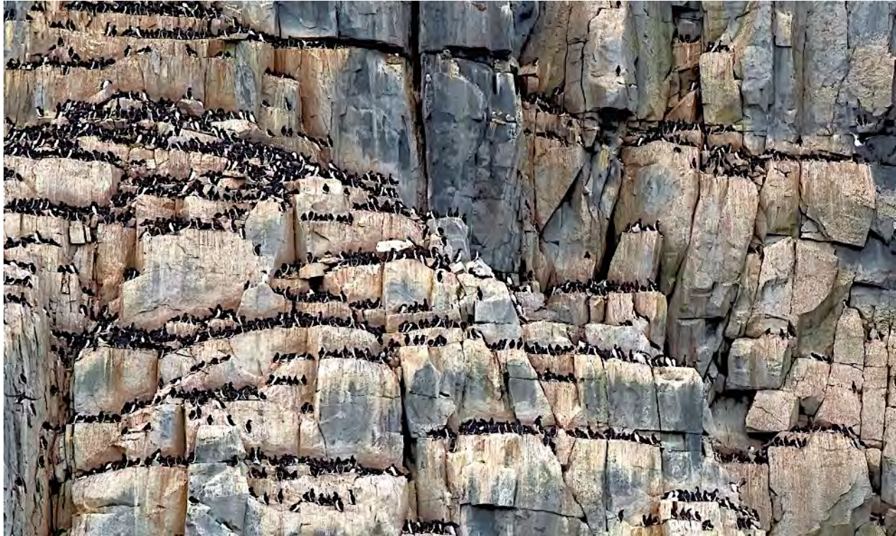
Svalbard is an important breeding ground for many Arctic seabirds. At Alkefjellet, we'll see magnificent cliffs covered with Thick-billed Murres.

We include here information for those interested in the 2025 Field Guides Spitsbergen & Svalbard Archipelago cruise: