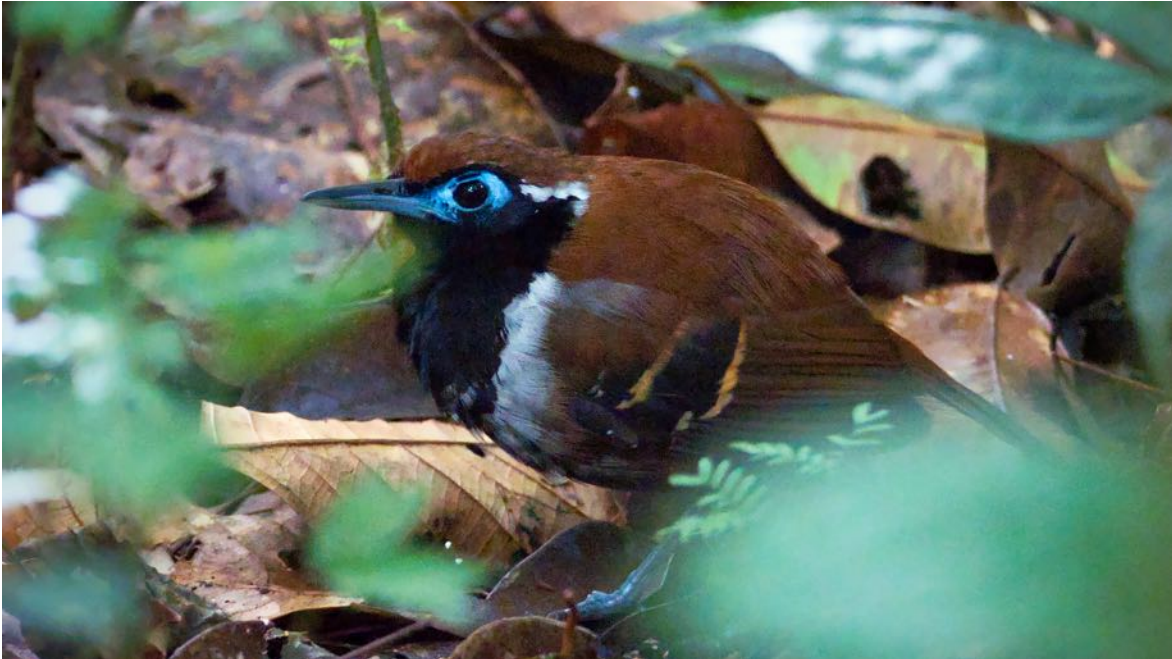
Ferruginous-backed Antbirds move around quietly on the forest floor, so spotting one takes a bit of careful watching between the understory leaves. But when you finally make contact with your bins...wow! It's among the fanciest of antbirds.

We include here information for those interested in the 2021 Field Guides Succinct Suriname tour: