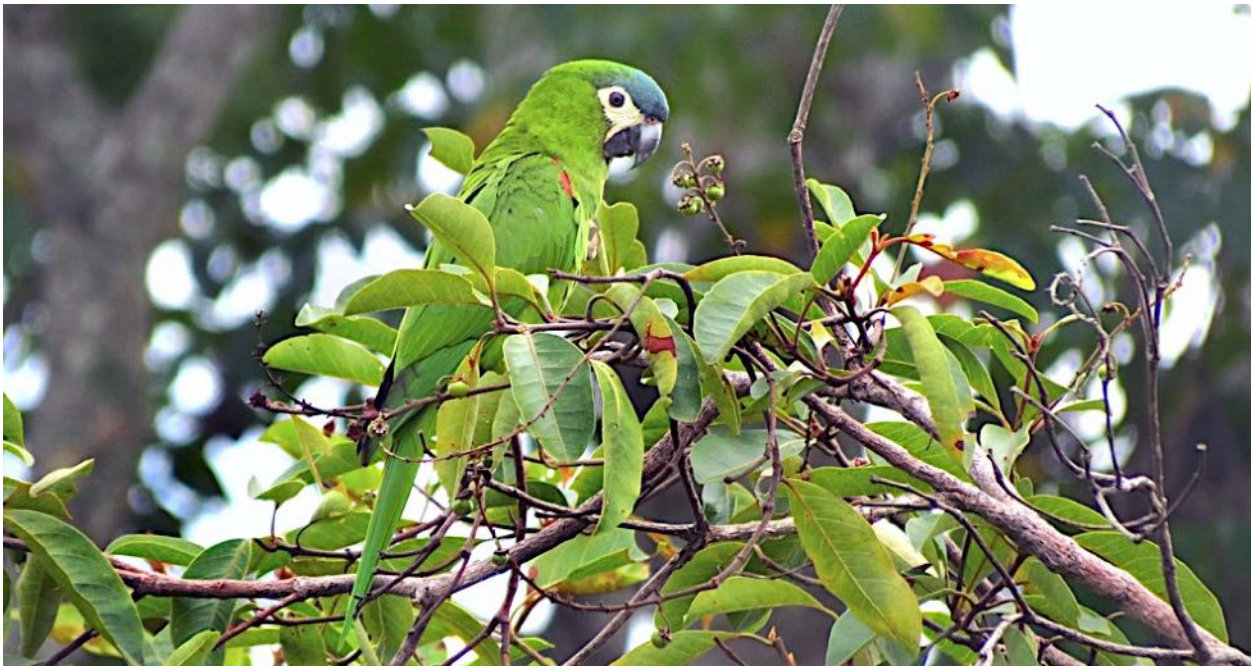
The Red-shouldered Macaw is the smallest of the macaws that we might see; it is found in savanna habitats, and nests in palm groves. We'll watch for them near Brownsberg.

Day 3, Mon. Kraka-Zanderij road and Colakreek area; to Brownsberg Nature Park. Our main destination this morning will be the extensive areas of 'low-bush' and 'high-bush' savannas and adjacent savanna border forest in the vicinity of the Zanderij International Airport, about 45 minutes from our lodging in Paramaribo. We'll leave after an early breakfast to reach our first stop just after dawn, when bird activity is highest and temperatures in the open are still comfortable. The two main savanna habitats here are home to a specialized avifauna that favors the scattered clumps of small trees in the low-bush savanna and the more densely packed Clusia bushes and trees in the high-bush areas. Trails through the adjacent woodland will allow us to escape the midday sun and to look for flocks. Mauritia palm groves in the area attract such species as Red-bellied and Red-shouldered macaws, Sulphury Flycatcher, Point-tailed Palmcreeper, and Epaulet (Moriche) Oriole. By mid-afternoon, and after lunch at Colakreek, we'll continue southward to Brownsberg Nature Park. After settling into our rooms, we'll spend the remainder of the afternoon birding in the park near our accommodations. Night at Brownsberg.