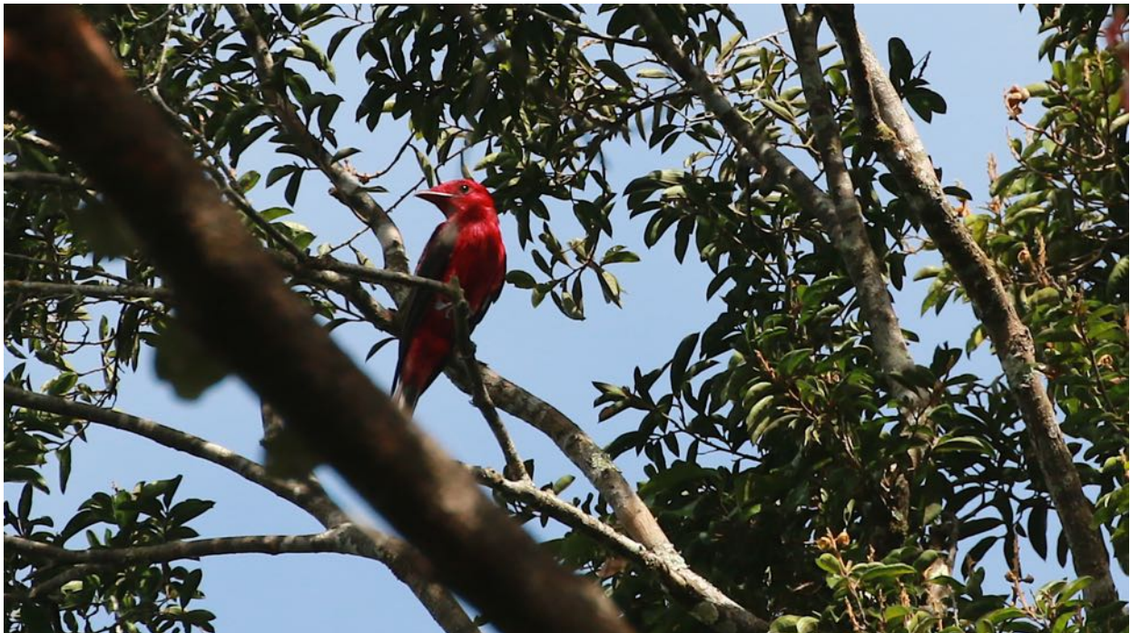
We'll see a variety of cotingas, including the wonderful Guianan Cock-of-the-Rock and bizarre Capuchinbird, and we'll hope for a sighting high in the trees of a Crimson Fruitcrow as well, shown here in a photo by guide Dave Stejskal.

Fredberg —This is a fairly new lodge located in the expansive lowland rainforest to the southwest of Brownsberg. We were able to visit this exciting new site in 2018 for the first time and came away impressed with the extent of undisturbed lowland forest habitat and the fine variety of birds that it hosted, especially the variety of cotingas. Our local tour operator has raved about it as a new and important birding destination in the country, and we couldn’t agree more! Many of the forest birds that we used to find only at Palumeu far to the south (like Crimson Fruitcrow) or at Raleigh Falls to the west (Guianan Cock-of-the-Rock) are found regularly here, and there’s no need for an internal flight to get here – it’s an easy drive from Brownsberg via good paved highway and a good dirt logging road. Our birding here will be along a good trail system and along the roadside of little-used dirt logging roads with very few steep or difficult sections. Lodging here is simple but comfortable with private cabins with two beds each and private toilets, and larger double-occupancy duplex bungalows with private bathrooms and cold water showers. Shower facilities are shared for those staying in the private double cabins and are in a separate building nearby, and meals are prepared buffet-style in the main lodge building.