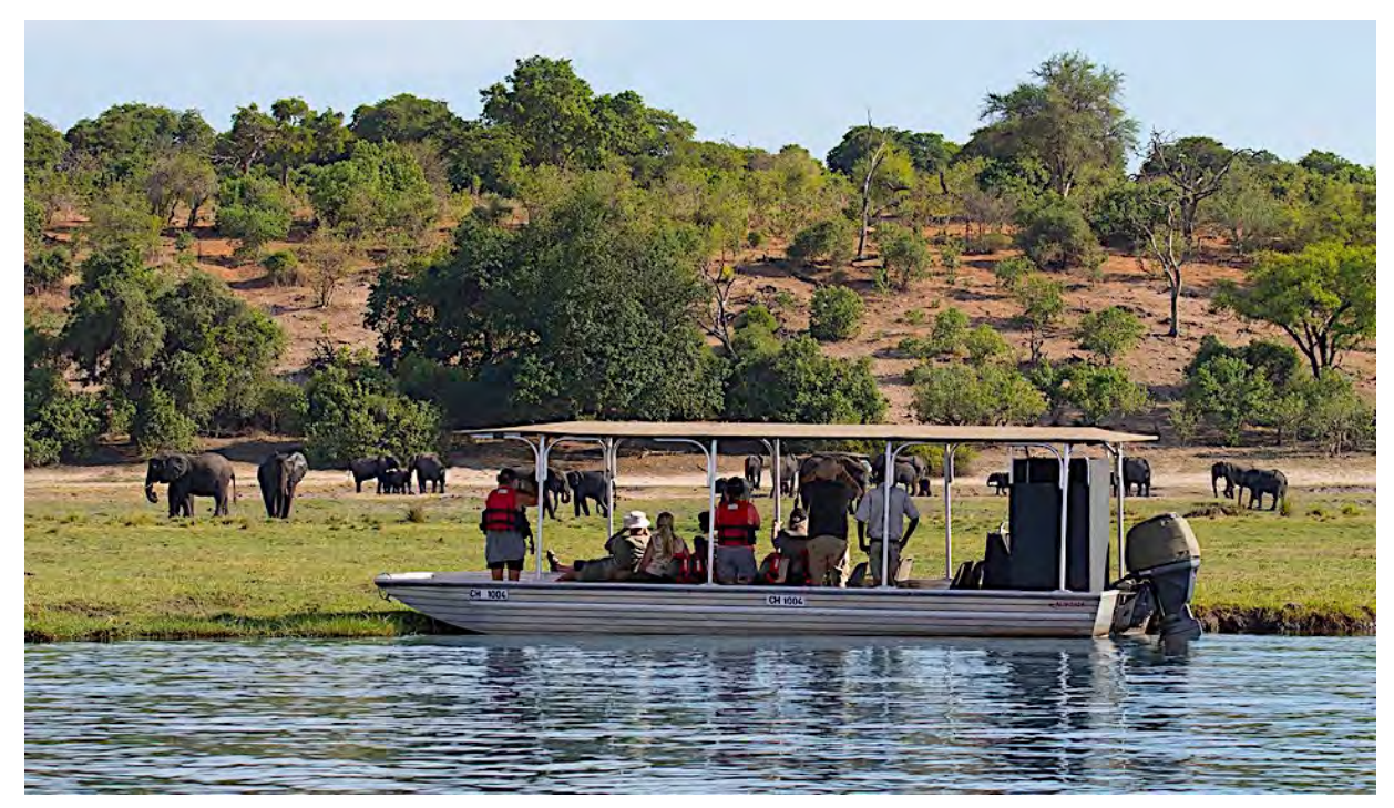
The Chobe River boat cruises offer excellent game viewing particularly in the dry season when large concentrations of Cape Buffalo and Elephant congregate along the shoreline and on the floodplains. The animals are completely at ease with the safari boats which provide an ideal base from which to watch and photograph them.

swim. The much localised (in Botswana) Puku and Red Lechwe antelope will be seen, along with many Hippo, Nile Crocodile, and dozens of Elephant frolicking in the river. The grassy islands, floodplains and river banks that form part of this river system are home to Slaty Egret, White-fronted Bee-eater, Purple Heron, Wire-tailed Swallow, Whiskered Tern, Collared Pratincole, and African Skimmer. Night in the Mowana Safari Resort.