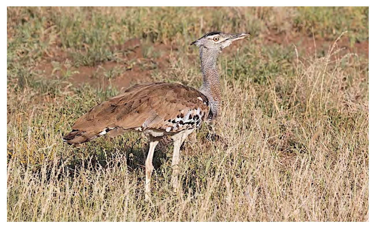
The largest member of the bustard family, the Kori is also reputed to be the world's heaviest flying bird. Pairs or family groups are often encountered on the savanah plains of central Kruger.

The park is probably best known for its spectacular elephant population; it contains an estimated 40,000, perhaps the highest elephant concentration in Africa. Birding is excellent here, with large numbers of African Fish Eagles, herons, including Goliath, Spoonbills, Openbills, various Ibis species, Marsh Harriers, Spur-winged Geese, and many other waterfowl species.