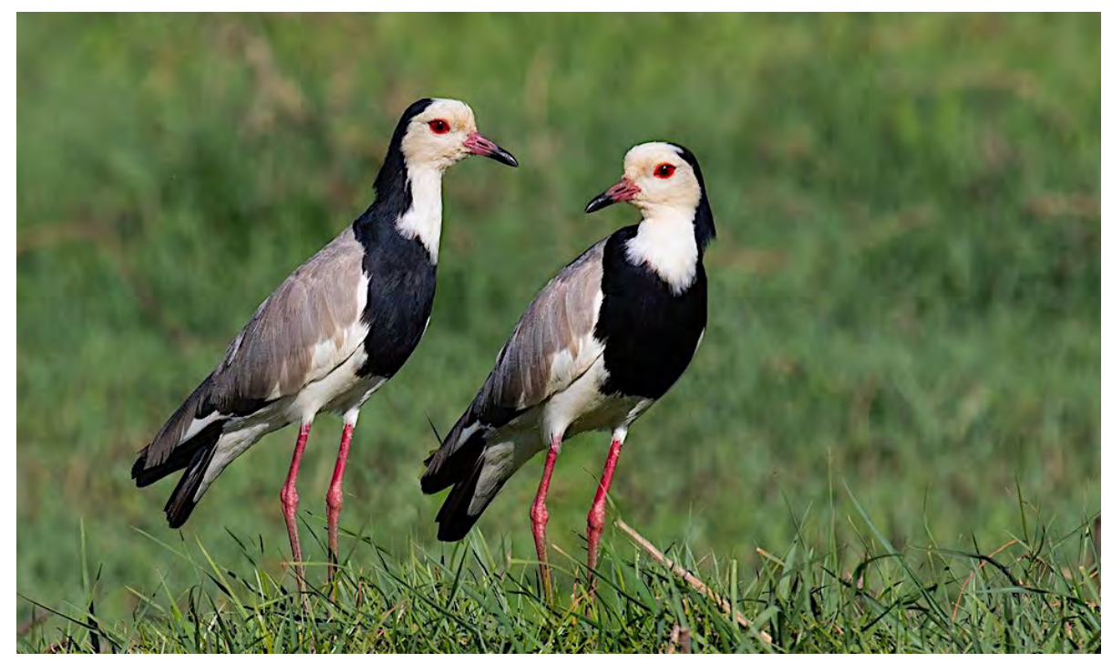
Dapper Long-toed Lapwings in their tuxedos are often seen in the flooded grasslands along the Zambezi River.

Heron, Dickenson's Kestrel, African Darter, Black Crake, African Wattled Lapwing, and pods of grunting hippopotamus are just a few of the species to look forward to, but the highlight will surely be an unforgettable Zambezi sunset. Night in the Avani Victoria Falls Resort.