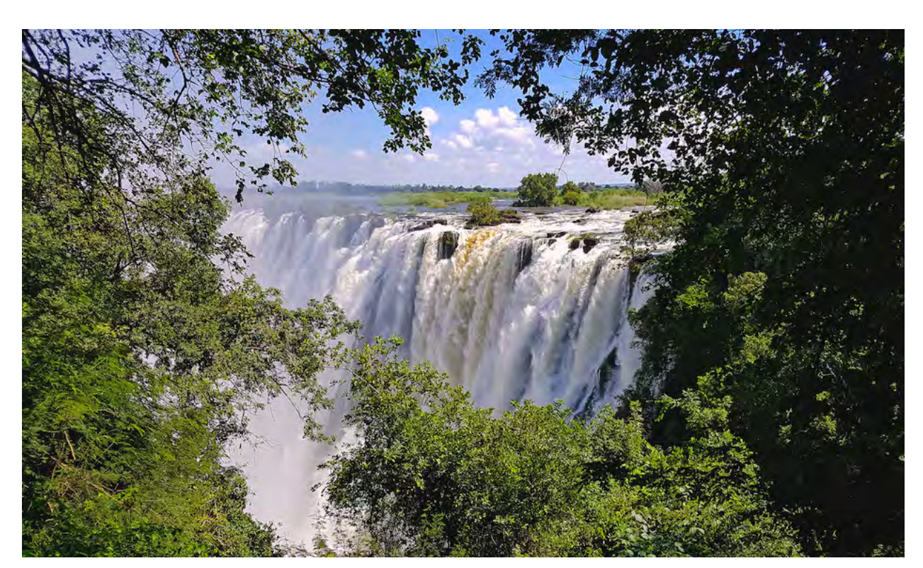
We'll visit the amazing Victoria Falls on the border of Zimbabwe and Zambia.

Victoria Falls – This natural wonder of the world is formed by the Zambezi River flowing over a 5600 foot (1700m) wide basalt wall and plummeting some 360 feet (110m) into a chasm below. The resulting blare and spray is what gives the Victoria Falls its local "Lozi" name Mosi-oa-Tunya , "The Smoke That Thunders". The waterfall is located on the border between the countries of Zimbabwe and Zambia. Habitats around the falls include rugged basalt cliffs, 'rainforest' (as a result of the spray and mist from the falls), riparian forest and teak woodlands. Some of the birds that we will be looking out for in the forests and on the river above the falls are African Black Swift, Crowned and Trumpeter Hornbill, Meves's Starling, Schalow's Turaco, Rufous-bellied Heron, White-headed Lapwing, Meyer's Parrot, and many more.