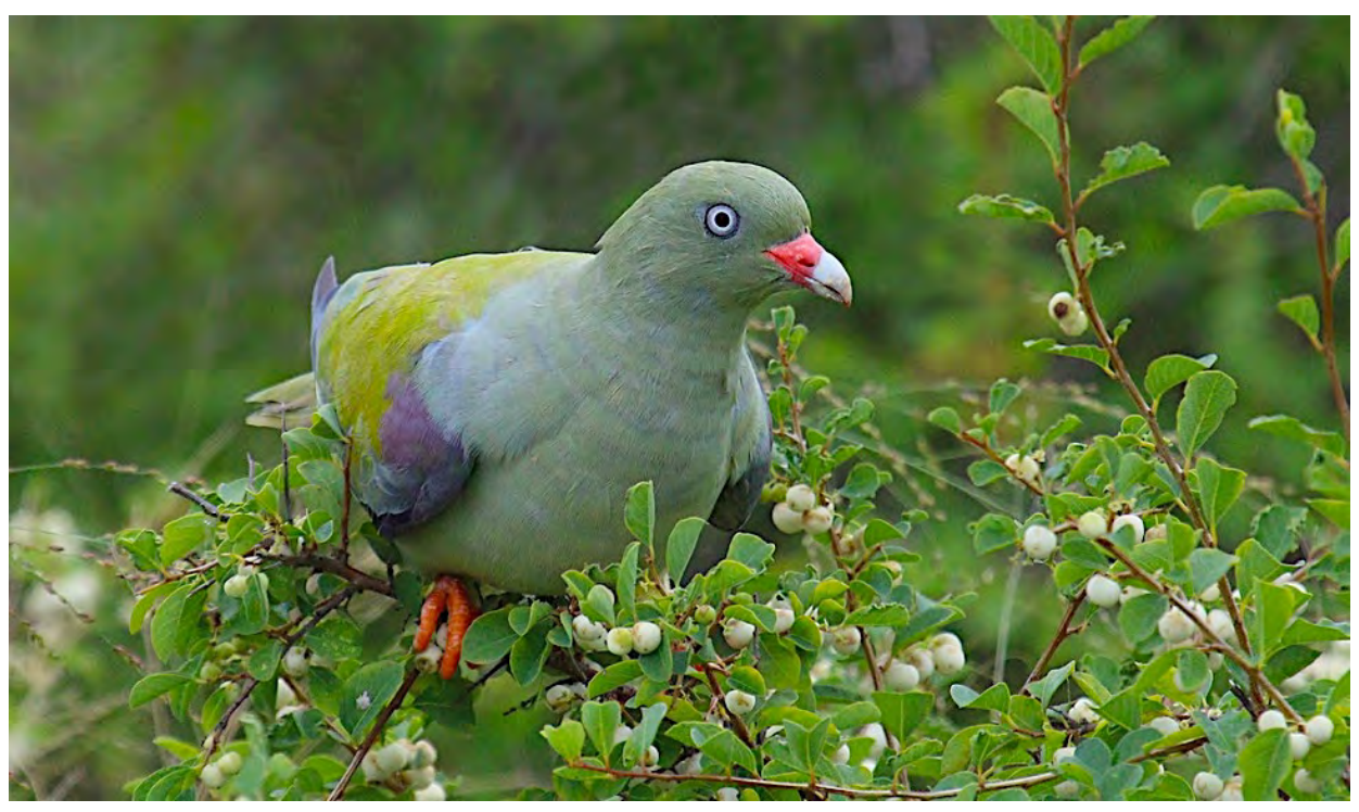
African Green-Pigeons are easily located in fruiting trees and shrubs along Kruger's watercourses. This one is attracted by the fruit of the White Berry Bush (Flueggea virosa).

Day 4, Tue, 4 Jul. We will take early morning and late afternoon drives, and enjoy some leisure birding in the beautiful grounds of Skukuza Camp in between. During the heat of the day, we can take in the views and wildlife of the tropical Sabie River from one of the many viewing areas along the camp perimeter and spend some time in a nearby bird hide which is well-known to most local bird photographers. While Skukuza provides an excellent base from which to encounter a wide veriety of mammals, the birdlife along the Sabie River and within the adjacent woodlands is just as interesting. Resident bird species that we will be looking out for include Purple-crested Turaco, Greater Blue-eared Starling, Emerald-spotted Wood Dove, Green Woodhoopoe, Southern White-crowned Shrike, African Green Pigeon, Red-crested Korhaan, Retz's Helmetshrike, and Natal Spurfowl. Night at Skukuza Camp.