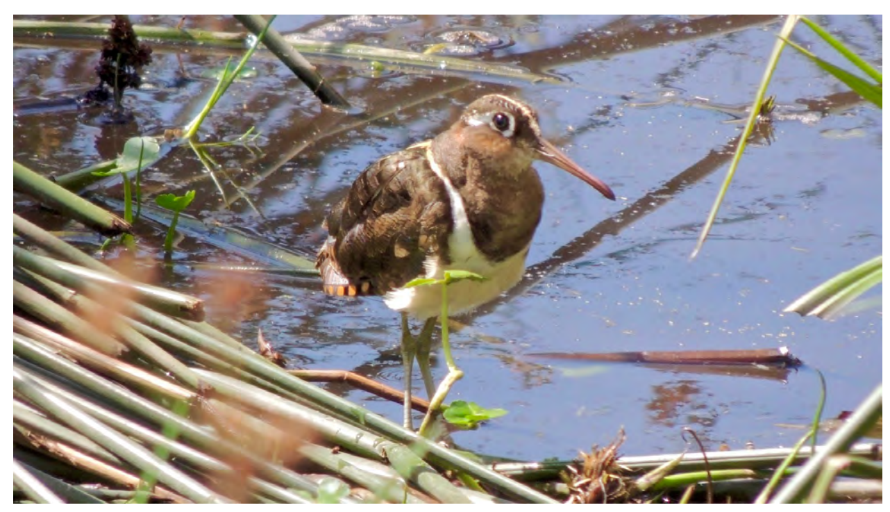
The Greater Kruger National Park is not only famous for its large mammals, it also boasts a impressive bird list. We'll watch for a Greater Painted Snipe when we bird along the Olifants River.

Conservancy), where we stay in a lovely private lodge. All drives here are in open safari vehicle and rangers are allowed to traverse off-road to get better views of the big-five mammals. The nights at Thornybush are usually filled with the sounds of nocturnal mammals and birds, with the territorial male lions dominating the chorus! Night in a private lodge in the Thornybush Game Reserve.