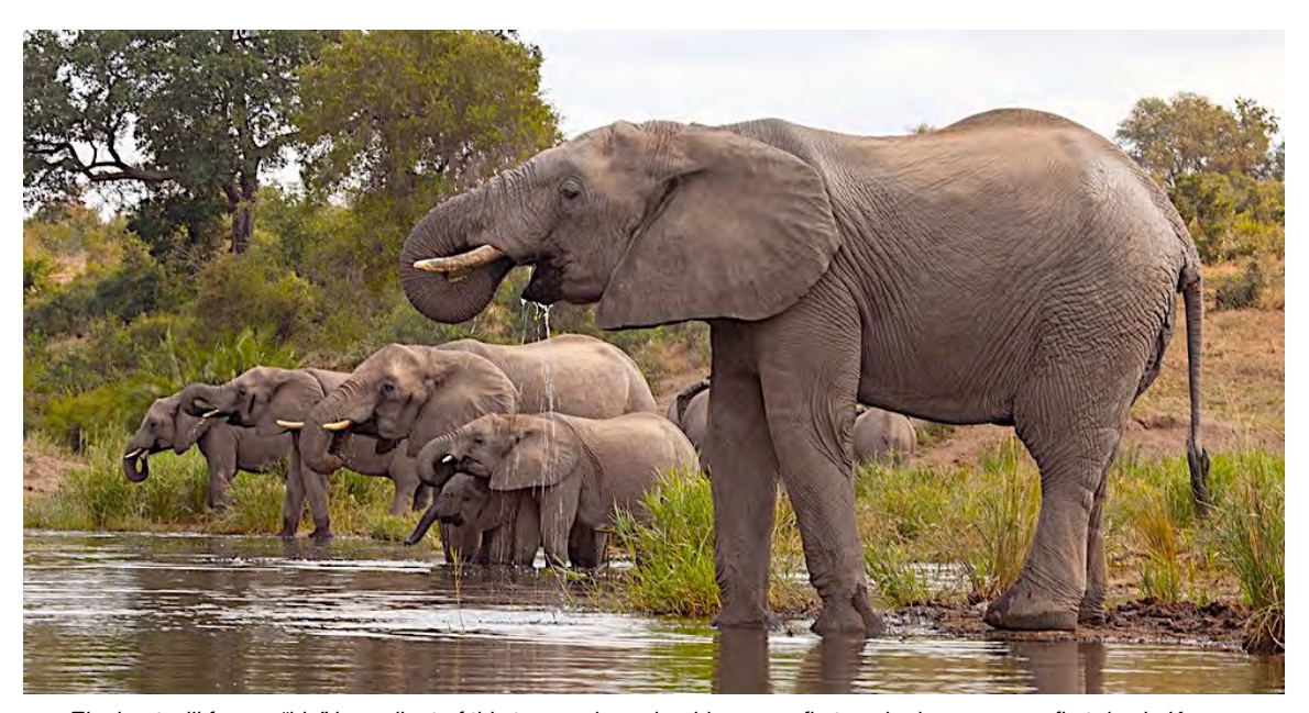
Elephant will form a "big" ingredient of this tour and we should see our first pachyderms on our first day in Kruger. This herd was photographed at the Sabie River near Skukuza Camp by guide Joe Grosel.

50 mammal species, including the much vaunted "Big 5" (Lion, Leopard, Rhino, Elephant and Cape Buffalo), plus a surprising variety of antelope, small carnivores and impressive numbers of Zebra and Giraffe. The tour should turn out a species list of well over 300 bird species, including most of the large terrestrial species such as Ostrich, Secretarybird, Kori Bustard and Southern Ground Hornbill, plus a variety of kingfishers, bee-eaters, rollers, barbets, sunbirds, hornbills, starlings and shrikes. The Zambezi and Chobe waterways provide some of the finest birding on the continent in terms of diversity and density. Our game viewing and birding activities will be conducted from open safari vehicles and flat-hulled boats, which are both ideal for wildlife photography. Excellent field guides and other reference material make preparation and fieldwork a pleasure, and you will be accompanied by an expert safari and bird guide from start to finish. Travelling between the three countries (South Africa, Zambia and Botswana) will be on local airlines and road transfer.