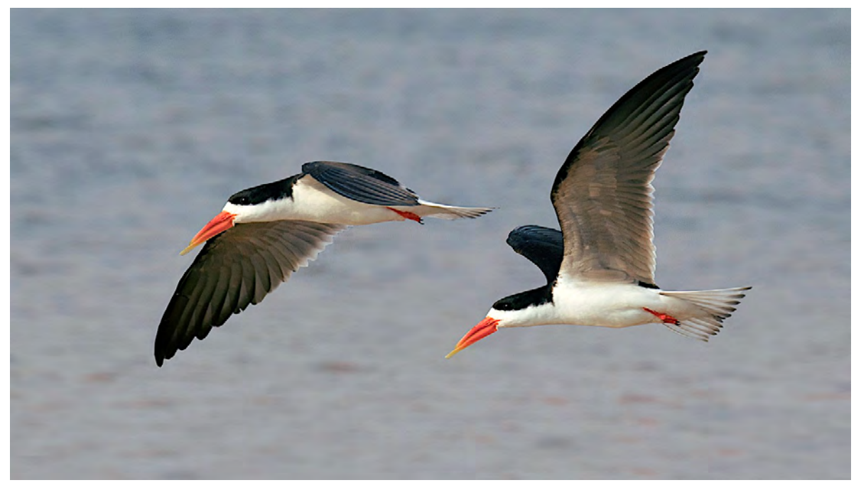
African Skimmers can be found on many rivers in Soutern Africa, including the Zambezi.

Kruger, Victoria Falls, Zambezi River, and Chobe July 1 – 16, 2023