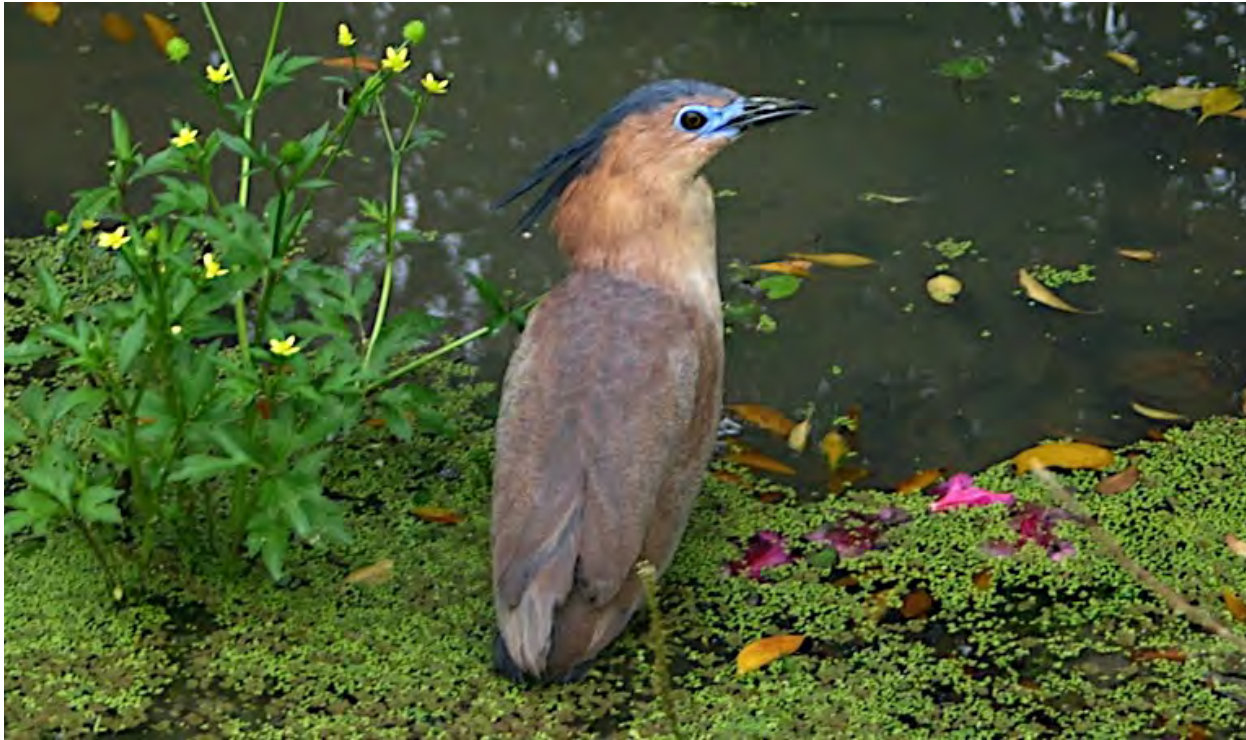
The Malay Night-heron is widespread in eastern Asia, but one of the best places to see it is Taiwan. Photograph by guide Phil Gregory.

Laughingthrush and other high elevation species. Then, we will visit the lower elevation of Alishan, with chances of White-backed Woodpecker, Taiwan Yuhina, Taiwan Barwing, Taiwan Sibia and Taiwan Laughing-thrush. Our destination is Kwanghua village (about 3300 feet; 1,000 meters). Night at Firefly Lodge, Kwanghua.