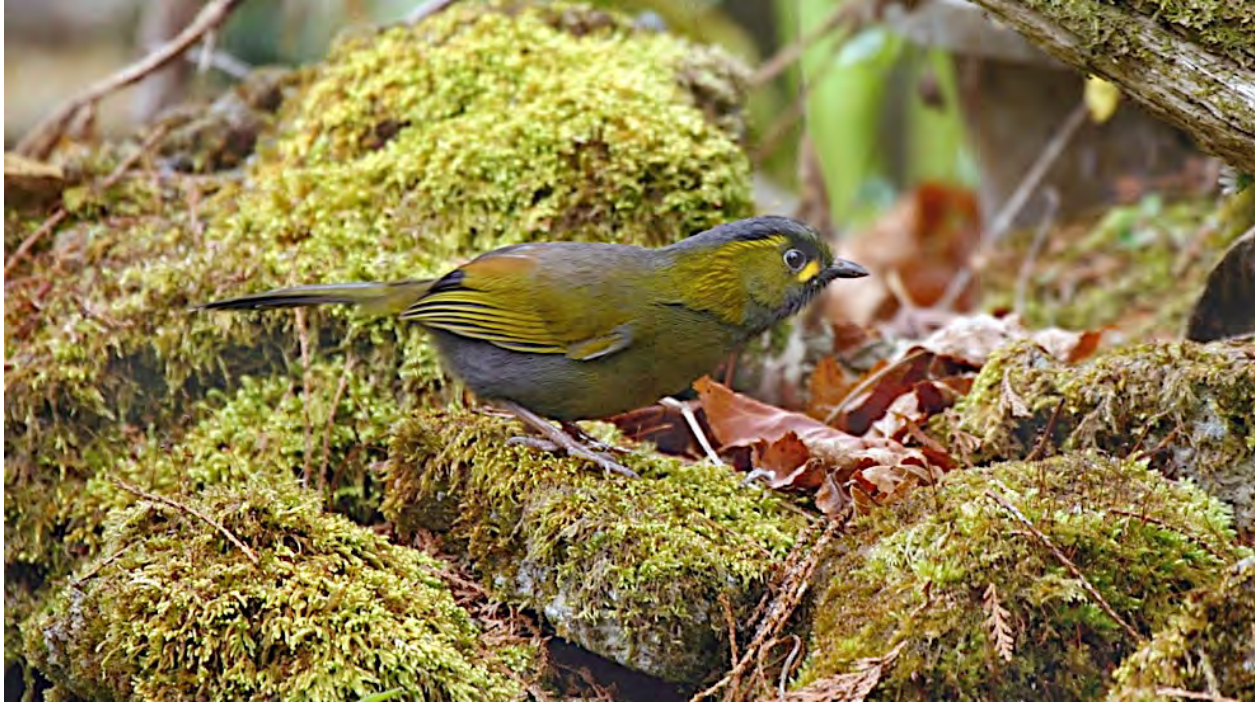
Steere's Liocichla is a small babbler found only in Taiwan. Though it is a range-restricted endemic, it is widespread in the higher elevations on the island.

We include here information for those interested in the 2021 Field Guides Taiwan tour: