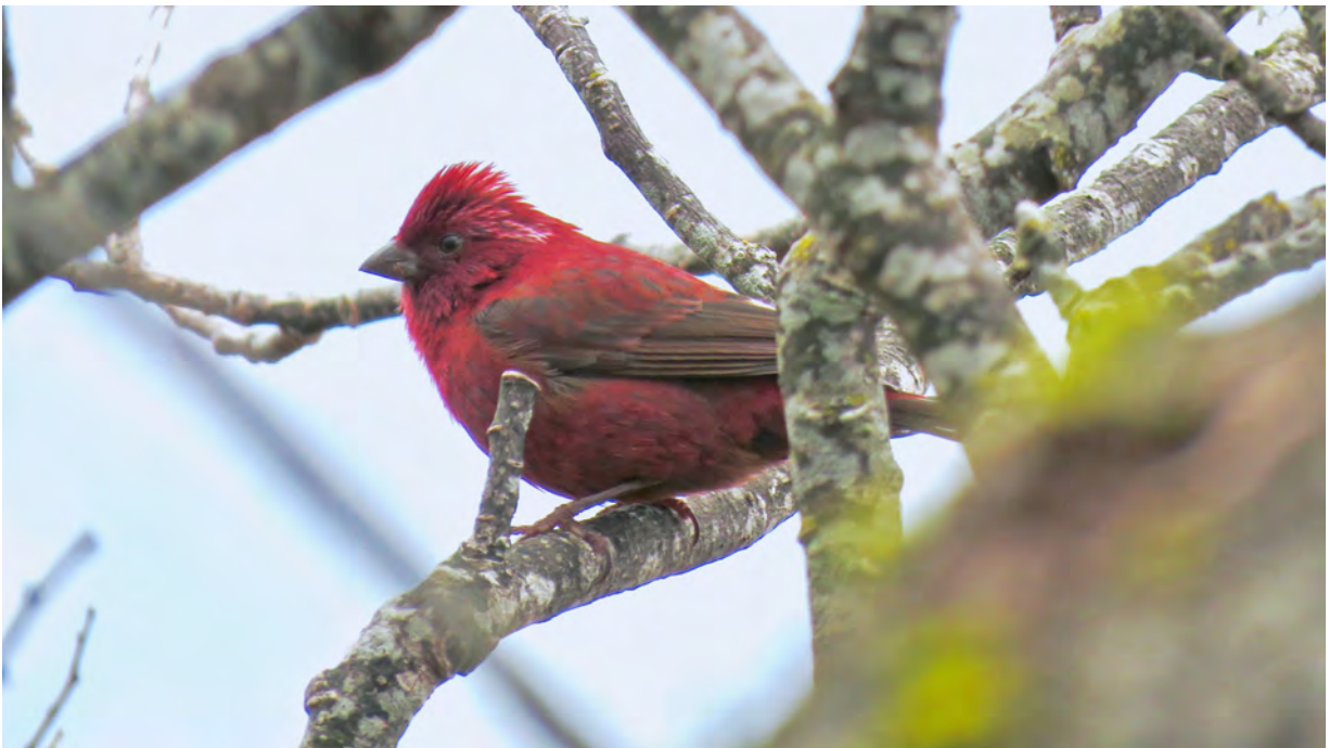
This gorgeous male Taiwan Rosefinch was seen well at Hohuanshan on our 2020 tour.

Our tour will sample the birds of the lowlands, hill forest, and mountains up to 11000' at Hehuanshan, in what is an outstandingly beautiful island, focusing on the endemics and regional specialties. Taiwan has a temperate climate and early starts are useful, but not as demanding as on tropical tours. Darkness comes around 7 p.m., so long evenings are not a feature, though we will try owling one night and some spotlighting for the spectacular endemic flying squirrel if the weather permits.