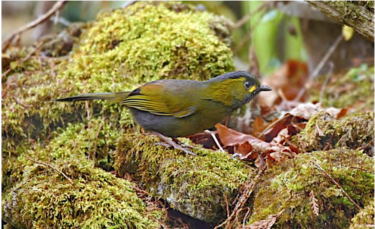
Steere's Liocichla is a small babbler found only in Taiwan. Though it is a range-restricted endemic, it is widespread in the higher elevations on the island.

We include here information for those interested in the 2023 Field Guides Taiwan tour: