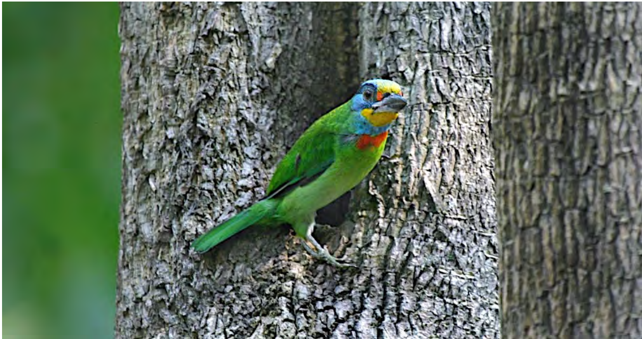
The colorful Taiwan Barbet is another range-restricted endemic that we'll find in the higher elevations near Guguan.

Day 4, Fri, 5 May. Full day birding at Dashueshan. There are also chances of White-backed Woodpecker, Scaly Thrush, White-tailed Robin, Vinaceous Rosefinch and other high elevation species. Night at Dashueshan National Forest Recreation Area.