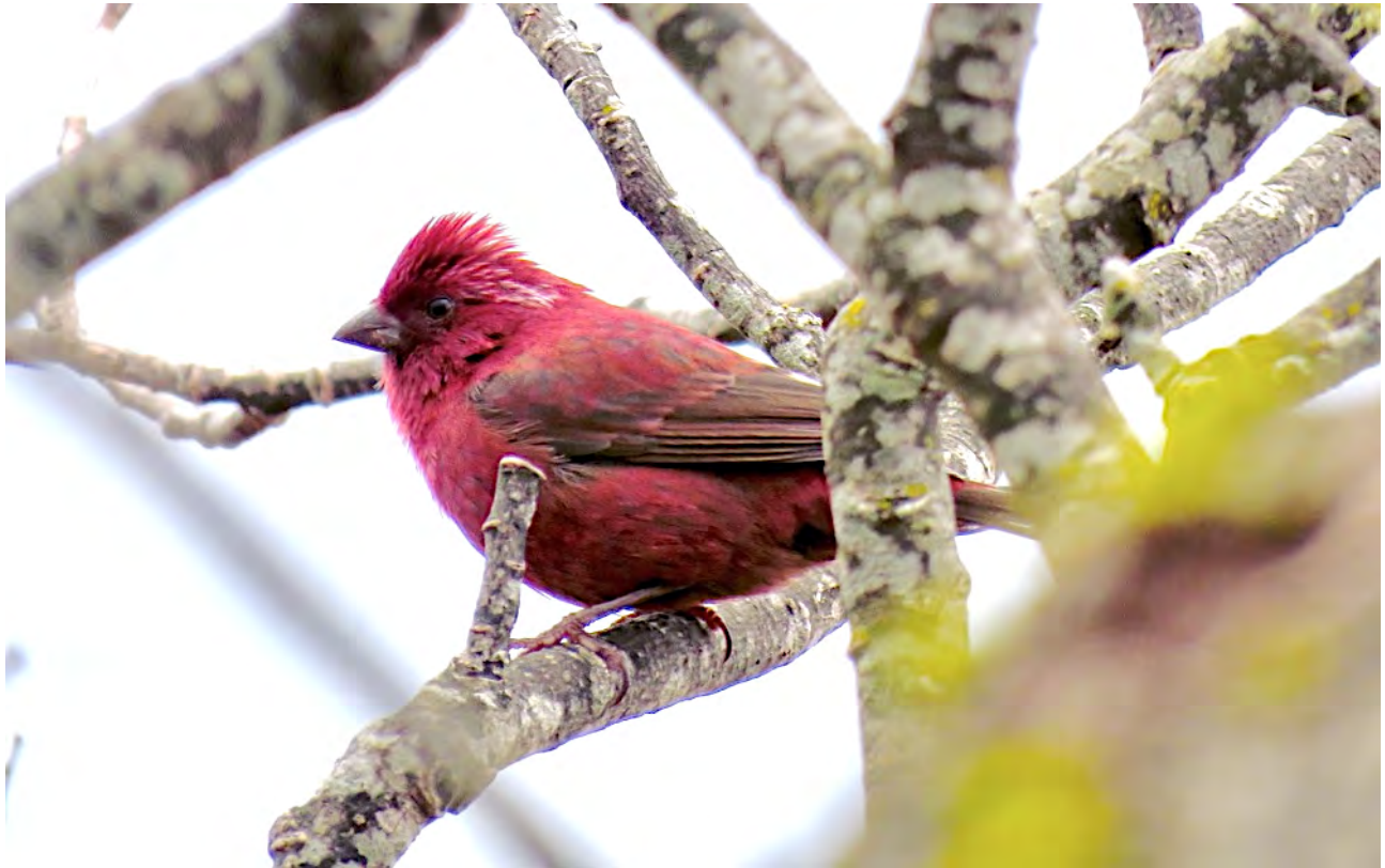
The endemic Taiwan Rosefinch was seen well on our 2020 tour.

Tourism in Taiwan is in its infancy: overseas visitors are still a bit of a novelty away from the cities. The people are extremely friendly and helpful, and in the cities, many understand English. And the Taiwanese people have a cultural reverence for nature, with sightseeing and nature in general as important recreational interests. International tourism in Taiwan largely ceased during the pandemic, and Taiwan only opened to foreigners again in late 2022. Join us for a spring tour to this beautiful and seldom-visited island.