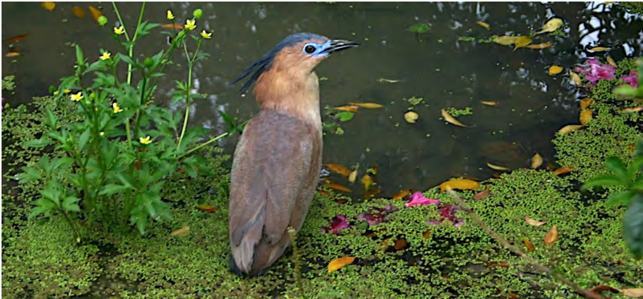
The Malay Night-heron is widespread in eastern Asia, but one of the best places to see it is Taiwan.

Day 8, Tue, 9 May. Puli – Yushan National Park (Tataka Recreation Area) – Alishan. We will head for Yushan National Park (Tataka Recreation Area) in the early morning. Tataka Recreation Area (2,600m) in Yushan National Park is another excellent site for more mountainous specialties. This is good site to find the stunning Mikado Pheasant, plus both Swinhoe's Pheasant and the very shy Taiwan Partridge may be found, whilst nearby areas have the distinctive Black-necklaced Scimitar-babbler (split from Rusty-cheeked), and Spotted Nutcracker. Collared Bush-robins and White-whiskered Laughingthrushes are everywhere here, and Yushan is also a good place for the shy Taiwan Wren-babbler and Taiwan Bush-warbler. We will also look for Taiwan Fulvetta (split from Streak-throated Fulvetta), Rusty Laughingthrush and other high elevation species. Then, we will visit the lower elevation of Alishan, with chances of White-backed Woodpecker, Taiwan Yuhina, Taiwan Barwing, Taiwan Sibia and Taiwan Laughing-thrush. Our destination is Kwanghua village (1,000 meters). Night at Firefly Lodge, Kwanghua.