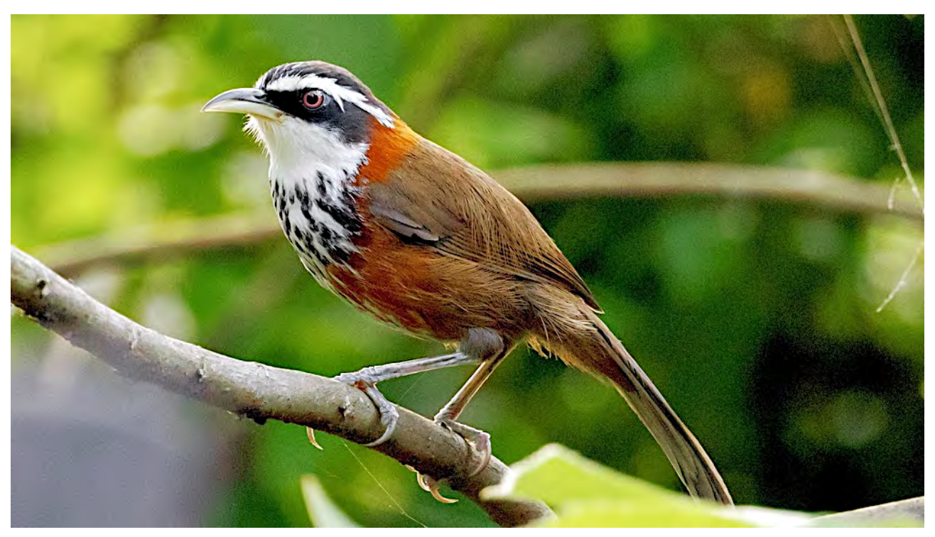
The attractive endemic Taiwan Scimitar-Babbler is found over much of the island.

Tourism in Taiwan is still developing: overseas visitors are still a bit of a novelty away from the cities. The people are extremely friendly and helpful, and in the cities, many understand English. The Taiwanese people have a cultural reverence for nature, with sightseeing, hiking and nature in general as important recreational interests. International tourism in Taiwan largely ceased during the pandemic, and Taiwan only opened to foreigners again in late 2022. The Daoist temples have to be seen to be believed, they are quite beautiful and impossibly exotic, whilst the cuisine is excellent and wide choice of food available, though we mainly eat in local restaurants where our guide can select what he recommends subject to our dietary needs. Please do join us for a spring tour to this beautiful and seldom-visited island.