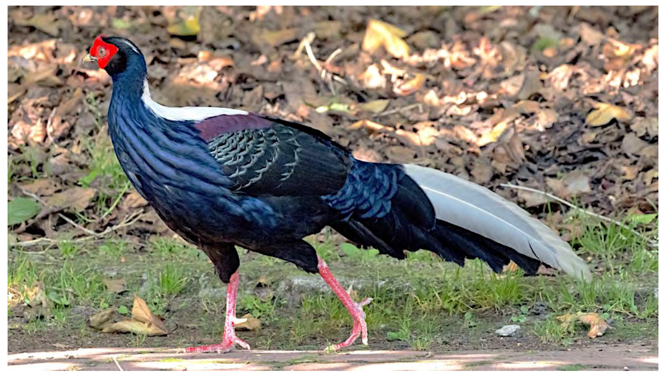
The male Swinhoe's Pheasant is a fancy bird! It is one of two endemic pheasants on Taiwan that we'll make an effort to find..

We include here information for those interested in the 2024 Field Guides Taiwan tour: