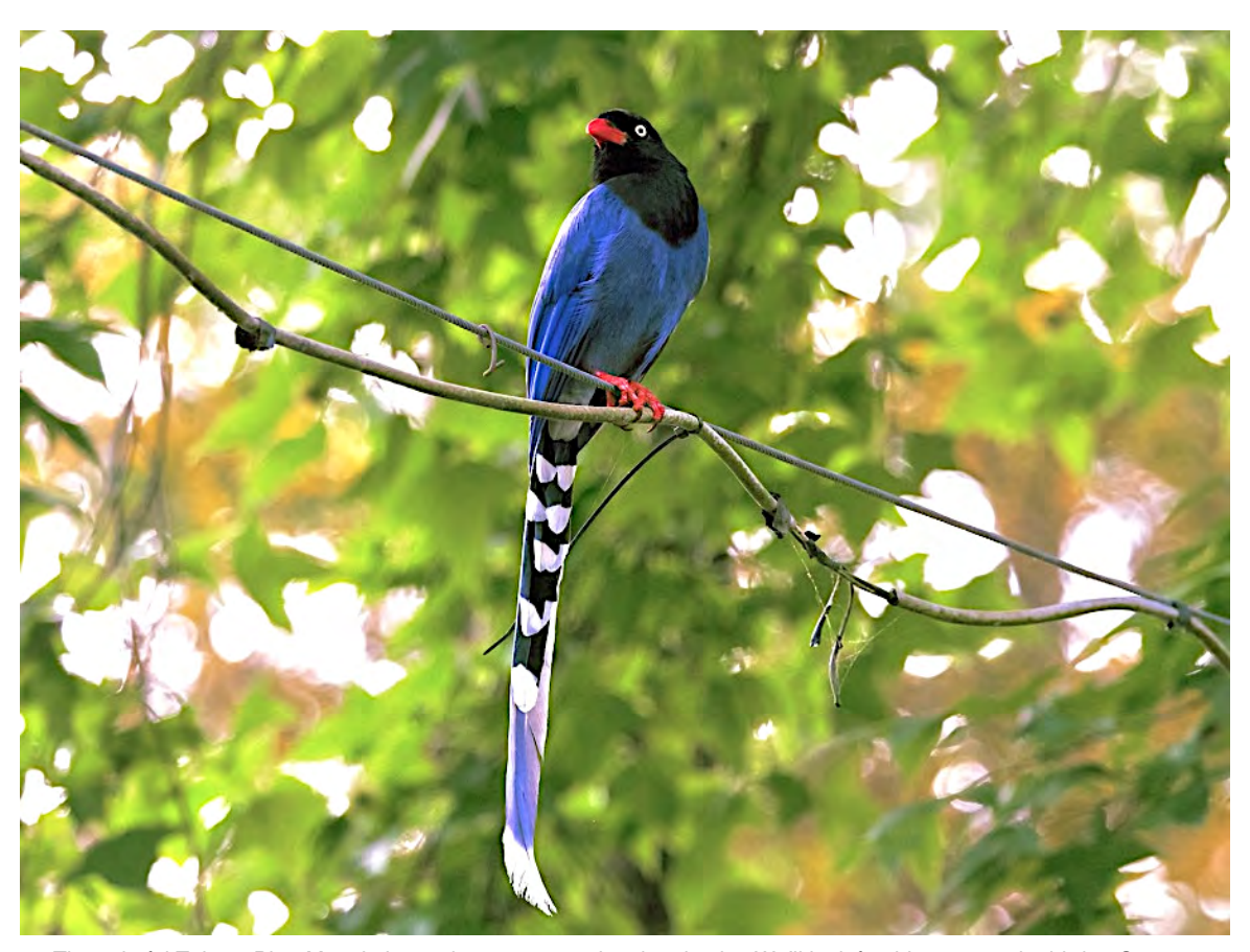
The colorful Taiwan Blue-Magpie is another range-restricted endemic. We'll look for this spectacular bird at Guguan.

Day 4, Fri, 3 May. Full day birding at Dashyueshan. We will explore various sites from the summit at km 50 and downwards, with good chances of both the pheasants and chances of White-backed Woodpecker, Scaly Thrush, White-tailed Robin, Taiwan (Vinaceous) Rosefinch and other high elevation species. Some owling is possible on one of these nights if the weather is suitable, with Mountain Scops Owl a good bet and the rare Himalayan Owl an outside chance. Night at Dashyueshan National Forest Recreation Area chalets. The spectacular White-bellied Giant Flying Squirrel can be seen near the lodge.