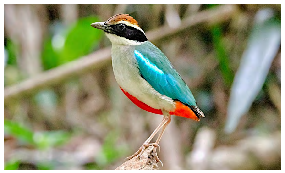
We'll look for the lovely Fairy Pitta near Huben.

Black-faced Spoonbill, Black-winged Kite, Eastern Marsh Harrier, and assorted waders including Avocet and other wetland species. Night at Grand Earl Hotel Douliou.