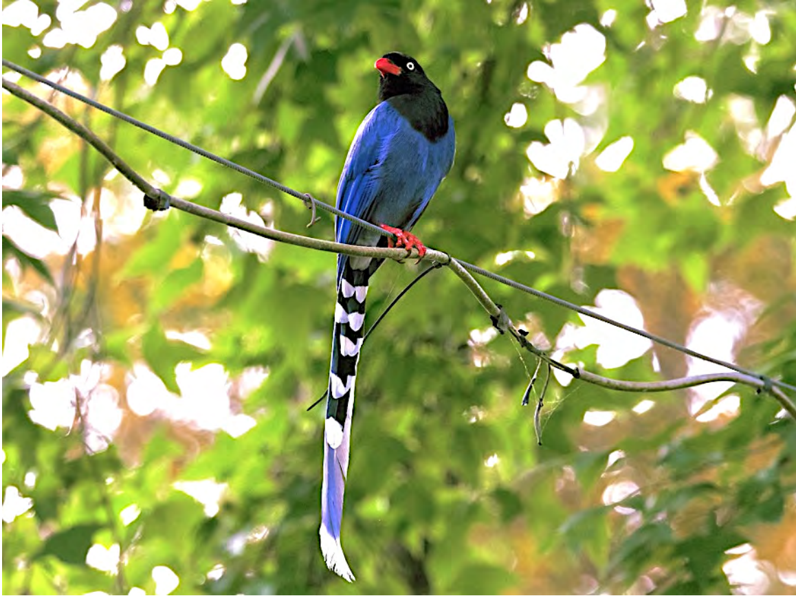
The colorful Taiwan Blue-Magpie is a distinctive endemic. We'll look for this spectacular bird at Guguan.

nights if the weather is suitable, with Mountain Scops Owl a good bet and the rare Himalayan Owl an outside chance. Night at Dashyueshan National Forest Recreation Area chalets. The spectacular White-bellied Giant Flying Squirrel can be seen near the lodge.