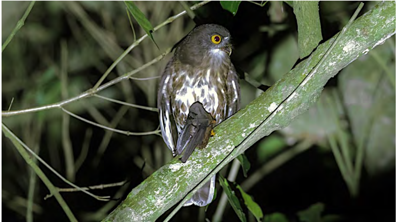
The Northern Boobook is a hawk-like owl found year-round in Taiwan. We'll have a chance to do some owling to look for this and several other owl species.

Tourism in Taiwan is still developing: overseas visitors are still a bit of a novelty away from the cities. The people are extremely friendly and helpful, and in the cities, many understand English. The Taiwanese people have a cultural reverence for nature, with sightseeing, hiking and nature in general as important recreational interests. International tourism in Taiwan largely ceased during the pandemic, and Taiwan only opened to foreigners again in late 2022. The Daoist temples have to be seen to be believed, they are quite beautiful and impossibly exotic, whilst the cuisine is excellent and wide choice of food available, though we mainly eat in local restaurants where our guide can select what he recommends subject to our dietary needs. Please do join us for a spring tour to this beautiful and seldom-visited island.