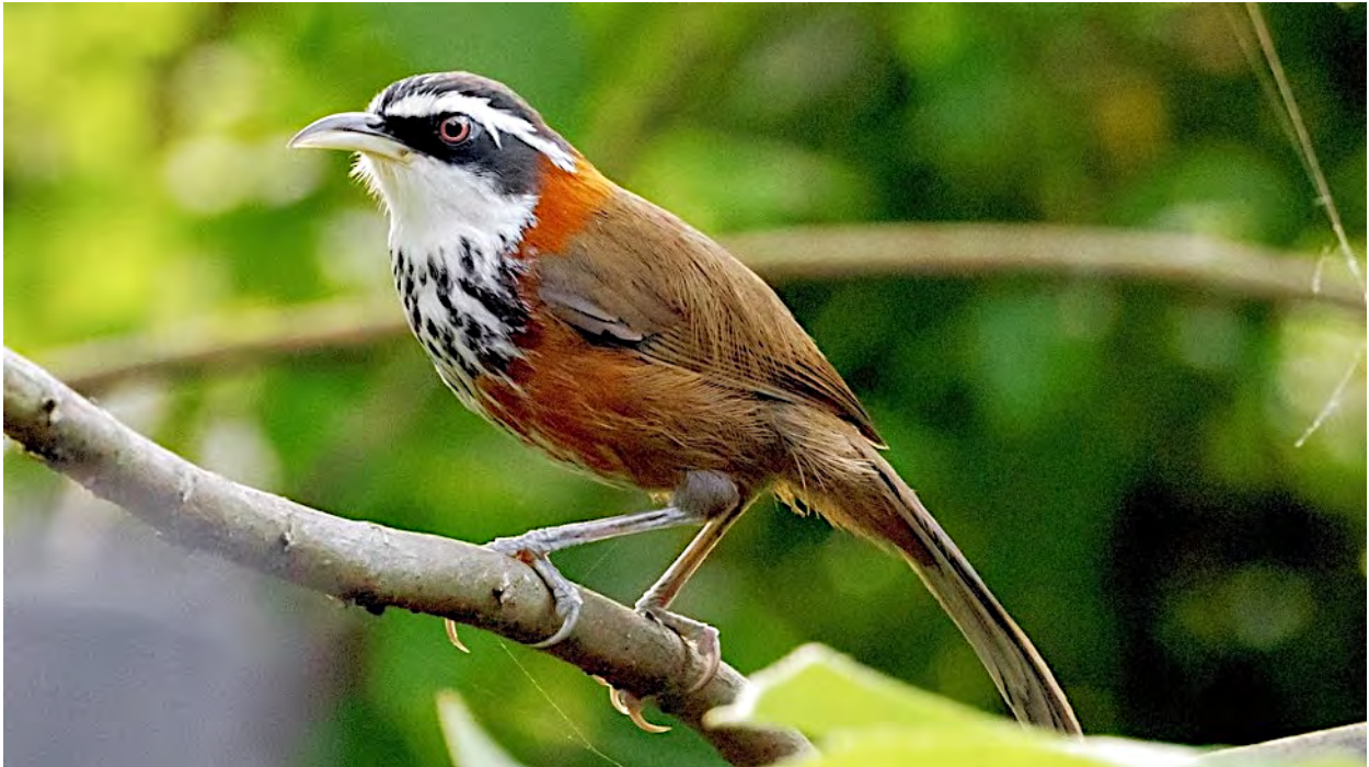
The endemic Taiwan Scimitar-Babbler is found over much of the island.

Black-faced Spoonbill, Black-winged Kite, Eastern Marsh Harrier, and assorted waders including Avocet and other wetland species. Night at Grand Earl Hotel Douliou.