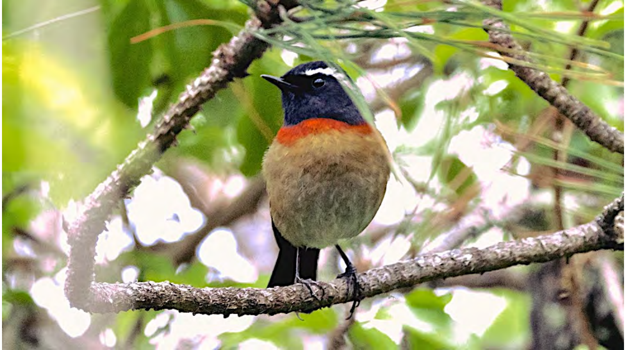
The Collared Bush-Robin is one of many endemics that we'll seek on the beautiful island of Taiwan.

We include here information for those interested in the 2025 Field Guides Taiwan tour: