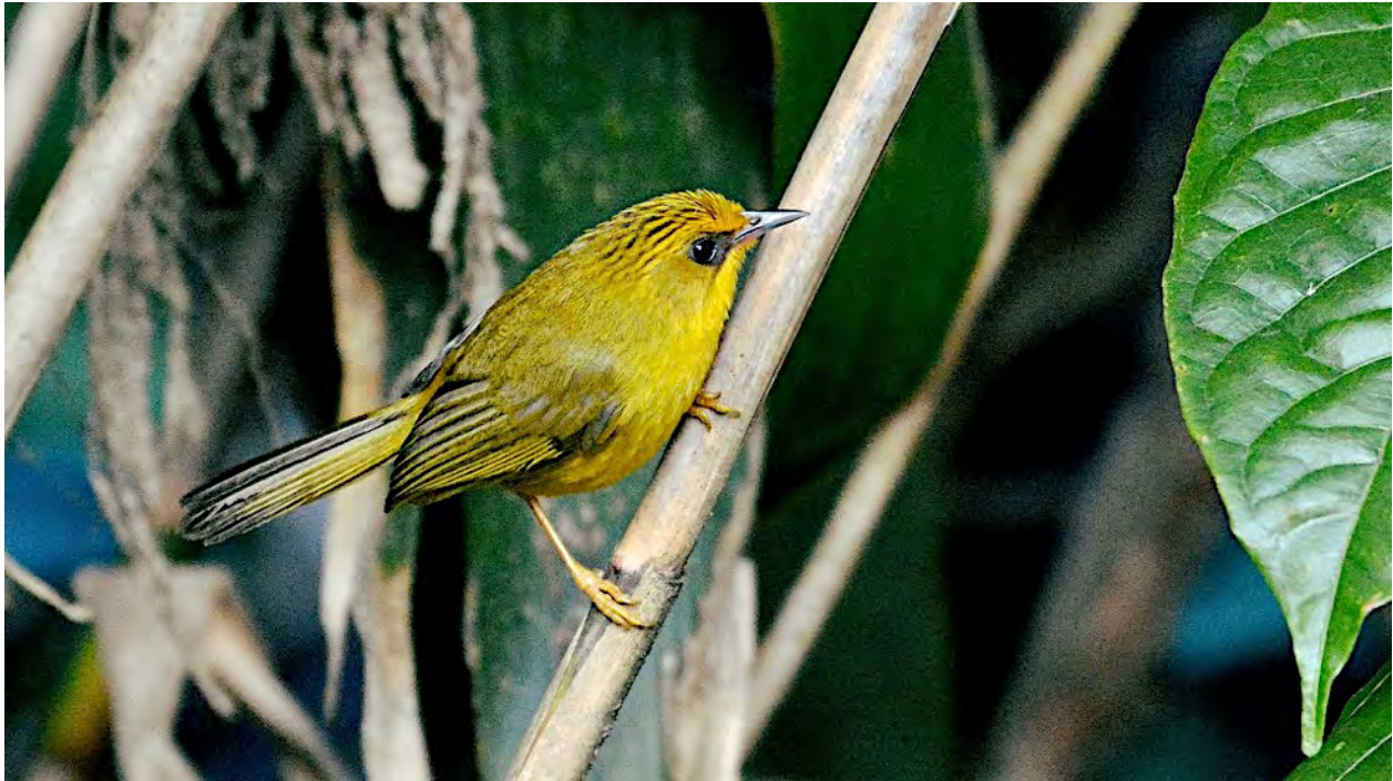
We will look for the charming Golden Babbler on Doi Inthanon and Doi Lang, where we've seen these tiny beauties on previous Field Guides tours.

Mae Ping National Park lies to the south of Doi Inthanon by about a couple of hours. Though the main habitat here—dry dipterocarp forest—is similar to what can be found on the lower slopes of Inthanon, most of the key birds of this habitat are much more easily found here than in the accessible parts of Inthanon, where many of these species are now scarce or absent. We will have one late afternoon and evening and the following morning to bird the park in search of specialties which include Black-headed, White-bellied, and Great Slaty Woodpeckers, Greater and Lesser yellownapes, Collared Falconet, White-rumped Falcon, Gray-headed Parakeet, Oriental Scops-Owl, Crested Treeswift, Burmese Nuthatch, Common Woodshrike, Large and Indochinese cuckooshrikes, Black-hooded Oriole, Rufous Treepie, and Red-billed Blue Magpie.