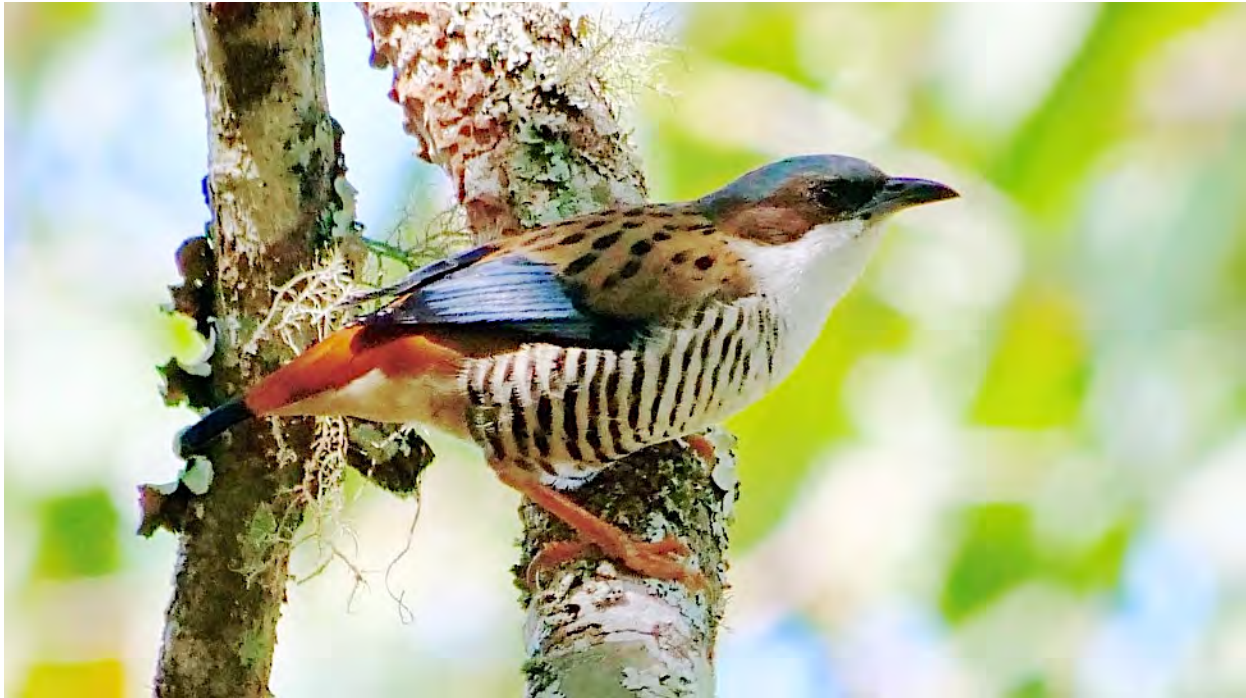
We've gotten good views of the attractive Himalayan Cutia on Doi Lang.

Doi Ang Khang is located on the Thai-Myanmar border about 150 kilometers northwest of Chiang Mai. Although this mountain, which rises to about 1800 meters (ca. 6000 feet), has less forest than Doi Inthanon, remnant woodland, scrub, and grasslands are still rich in bird life, including Mountain Bamboo-Partridge, Hodgson's Frogmouth, Crested Finchbill, Brown-breasted and White-headed bulbuls, Russet Bush-Warbler, White-browed Laughingthrush, Scarlet-faced Liocichla, Silver-eared Mesia, Streaked Wren-babbler, White-browed and Rusty-cheeked scimitar-babblers, White-tailed Robin, Daurian Redstart, Black-breasted Thrush, Yellow-streaked Warbler, and Spot-breasted Parrotbill. Wintering species, such as White-bellied Redstart and Aberrant Bush-Warbler, are also present (and need to account for themselves!). Note: all accommodations on the mountain have recently been closed by decree of the new king, so it is no longer possible to stay here, though we will still visit the area on a day trip from Fang.