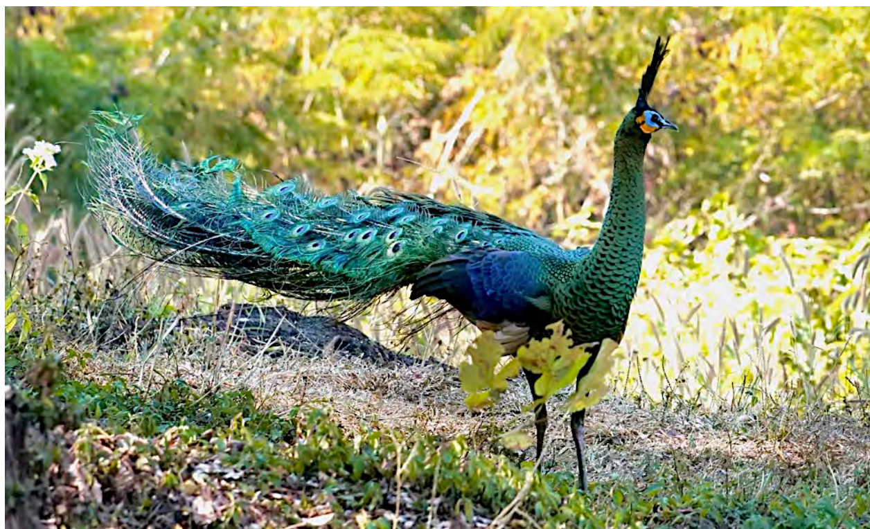
We had wonderful views of the endangered Green Peafowl on our way from Chiang Mai to Mae Ping National Park.

Day 12, Wed, 24 Jan. Morning birding near Chiang Mai; to Mae Ping National Park. We'll have the morning to bird the dry forest and paddies near Chiang Mai just out of town after our early hotel breakfast. We'll need to load the luggage vehicle with our bags before departing the hotel this morning, so make sure that you have all that you need for the day with you. Before we head south to Mae Ping NP (or on our way back north tomorrow), we'll stop in at a hillside reserve set up to protect a healthy population of the stunning and endangered Green Peafowl, which have become quite habituated as a result of the protection. All of our birding this morning will be along good paved and dirt roads on mostly level terrain (a few dirt levees out through the rice paddies, but nothing serious). Depending on our timing, lunch may be in the field, or, more likely, at a well-chosen restaurant along the way. We'll spend the late afternoon birding at Mae Ping NP along a good 15 km paved road through high quality, dry dipterocarp forest, with many dead trees for the numerous woodpeckers here in the park. After a picnic dinner in the park, we'll do some owling on our way out of the park, targeting Oriental Scops-Owl, Oriental Bay-Owl, and Blyth's Frogmouth. Night near Mae Ping NP.