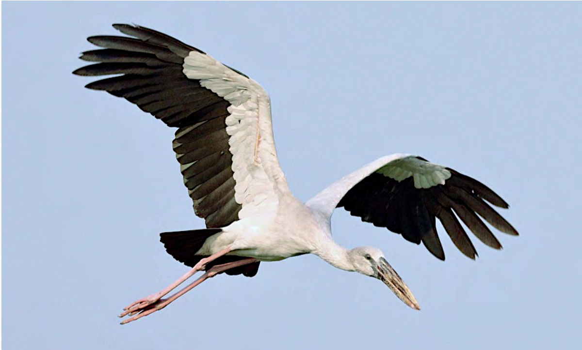
The Asian Openbill is common in Thailand's wetlands, and we'll see many near Bangkok, and in the rice paddies of the north.

Long-billed Plover (both rare these days), Pied Harrier (large numbers of these can be seen heading to roost late in the afternoon), Freckle-breasted Woodpecker, Baikal Bush-Warbler, Paddyfield Warbler, Chestnut-capped Babbler, Jerdon's Bushchat, Chestnut-eared Bunting, and many other scarce species. In recent years, even such Thai mega-rarities as Wallcreeper, Firethroat, Chinese Rubythroat, and Mandarin Duck have been found here at this season! It should be an exciting area to finish our birding before we fly back to Bangkok at the end of this tour.