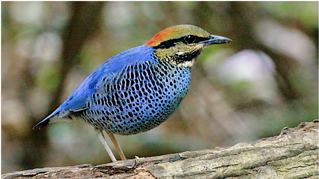
The lovely Blue Pitta can be very shy and difficult to see, but we have gotten some nice views on past tours, and we will hope to see one well this year.

Khao Yai's avifauna is similar to that of Kaeng Krachan, but there's certainly enough non-overlap to make a visit to both of these magnificent parks well worth our while. Some of the birds we hope to see include Jerdon's Baza, Red Junglefowl, Vernal Hanging-Parrot, Green-billed Malkoha, Collared Owlet, Great Eared-Nightjar, Orange-breasted and Red-headed trogons, Blue-bearded Bee-eater, Wreathed Hornbill, Moustached, Green-eared, and Blue-eared barbets, Greater Flameback, Heart-spotted Woodpecker, Great Iora, Bar-winged Flycatcher-shrike, Scarlet Minivet, Blue-winged Leafbird, Greater Racket-tailed Drongo, Asian Fairy-bluebird, and the familiar, but natural and native, Common Hill Myna. Khao Yai's beautiful streams and trails also provide the lucky with opportunities to see some rare and/or shy species such as Siamese Fireback, Silver Pheasant, the range-restricted Coral-billed Ground-Cuckoo and Brown Hornbill, Banded and Blue-eared kingfishers, Blue and Eared pittas, Banded Broadbill, Slaty-backed Forktail, and Van Hasselt's (split from Purple-throated) and Ruby-cheeked sunbirds. Open areas, remaining from pre-park cultivation, add to the diversity of wildlife, including the handsome White-throated Kingfisher and Indochinese Roller. Oh, yes, feel free to reconsider that Great Hornbill: Great Hornbills are resident at Khao Yai, as are Dhole (wild dogs), Asiatic Black Bears, Indian Elephants, and two species of gibbons.