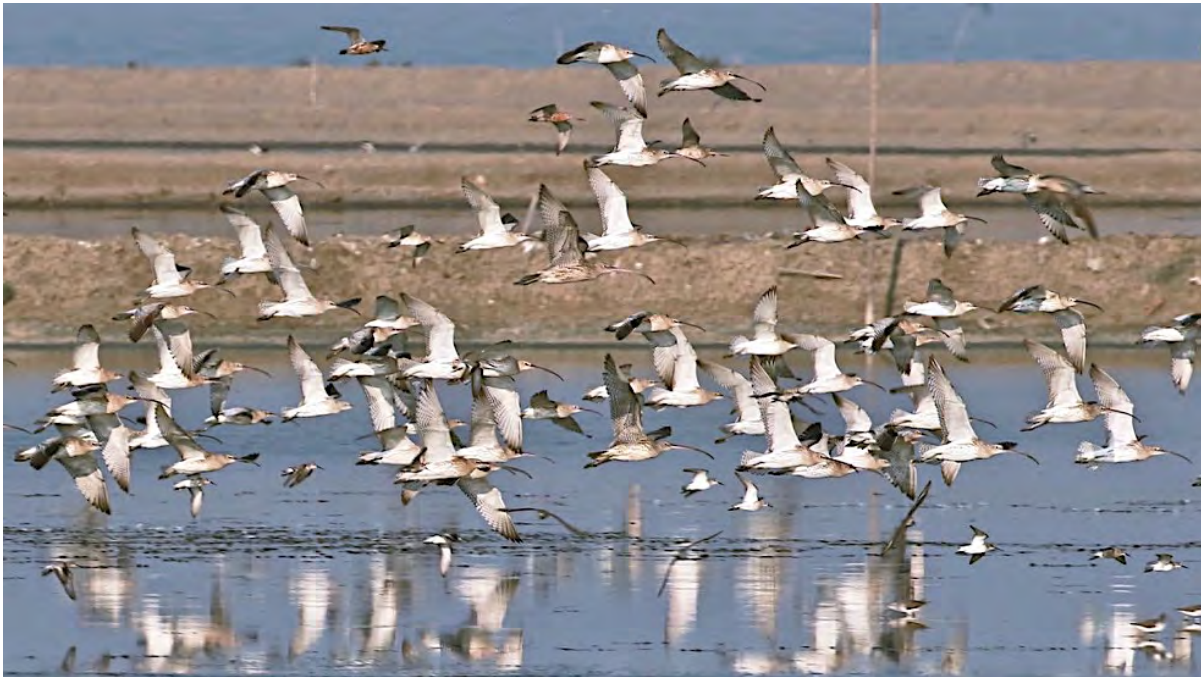
We will hope to find large flocks of wintering shorebirds such as this mixed species group at Pak Thale. This view includes two Far Eastern Curlews among the more common Eurasian Curlews, plus a number of smaller species.

Pak Thale and Laem Phak Bia —Saltpans, shrimp ponds, and coastal mudflats near Phetchaburi, about eighty kilometers south of Bangkok, host impressive concentrations of waterbirds, including thousands of Palearctic shorebirds, making this area perhaps the most alluring spot in the world for shorebirding. Some of the regular species are Marsh Sandpiper, Red-necked, Temminck's, and Long-toed stints, Curlew and Broad-billed sandpipers, Common and Spotted redshanks, Black-winged Stilt, Lesser and Greater sand-plovers, Brown-hooded Gull, and Whiskered Tern. Other rare possibilities along the coast here and a bit further south include Malaysian Plover, Nordmann's Greenshank, Asian Dowitcher, Great Knot, Lesser Black-backed (Heuglin's) Gull, and Pallas's (Great Black-headed) Gull. And in most years, the unique and Critically Endangered Spoon-billed Sandpiper puts in an appearance somewhere along this coast! We'll orchestrate our activities on the coast according to where target birds are being seen this winter, giving special consideration to finding the Spoon-billed Sandpiper during our time here.