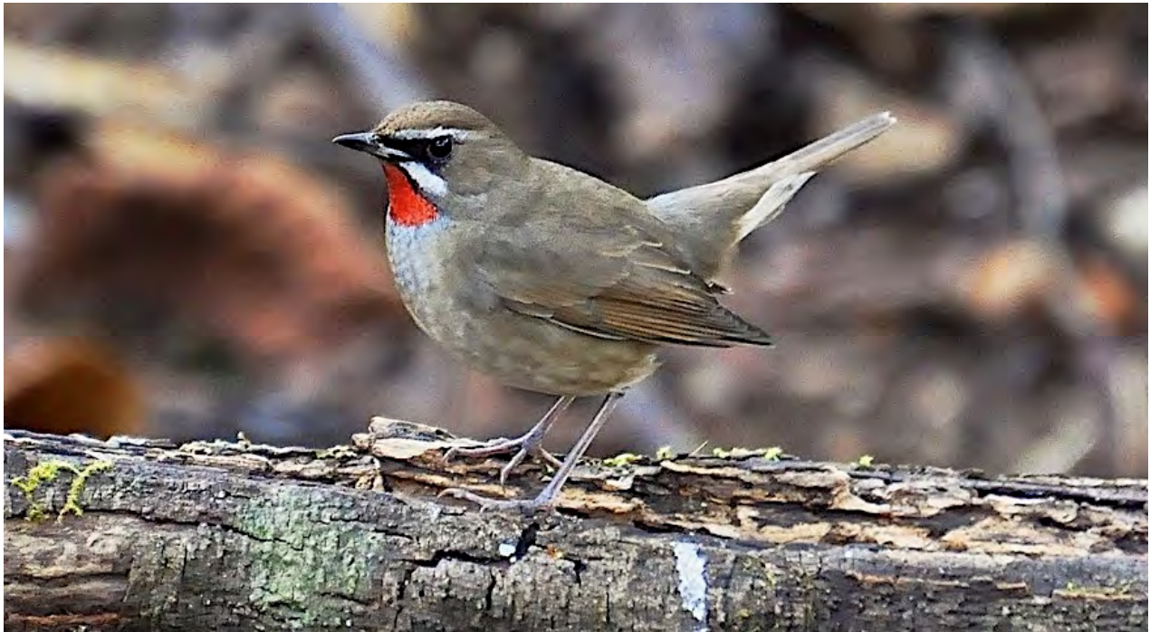
Siberian Rubythroat is a winter visitor to Thailand; we should get good looks at them on the tour.

As for the “wonderfully different and bizarre,” these are many: humongous hornbills with wingbeats that sound like an oncoming locomotive; barbets that should provide the basis for any soundtrack of exotic jungle sounds; the gaudy broadbills; aerodynamic treeswifts that perch on snags and wires; brilliant pittas that hide so well; strangely shaped and exotically colored woodpeckers; forest-loving kingfishers; and drongos with racket tails. Even the prosaic in Europe isn’t prosaic if you haven’t been to Europe—Doi Inthanon is a fun place to see your lifer Eurasian Jay or Eurasian Hoopoe.