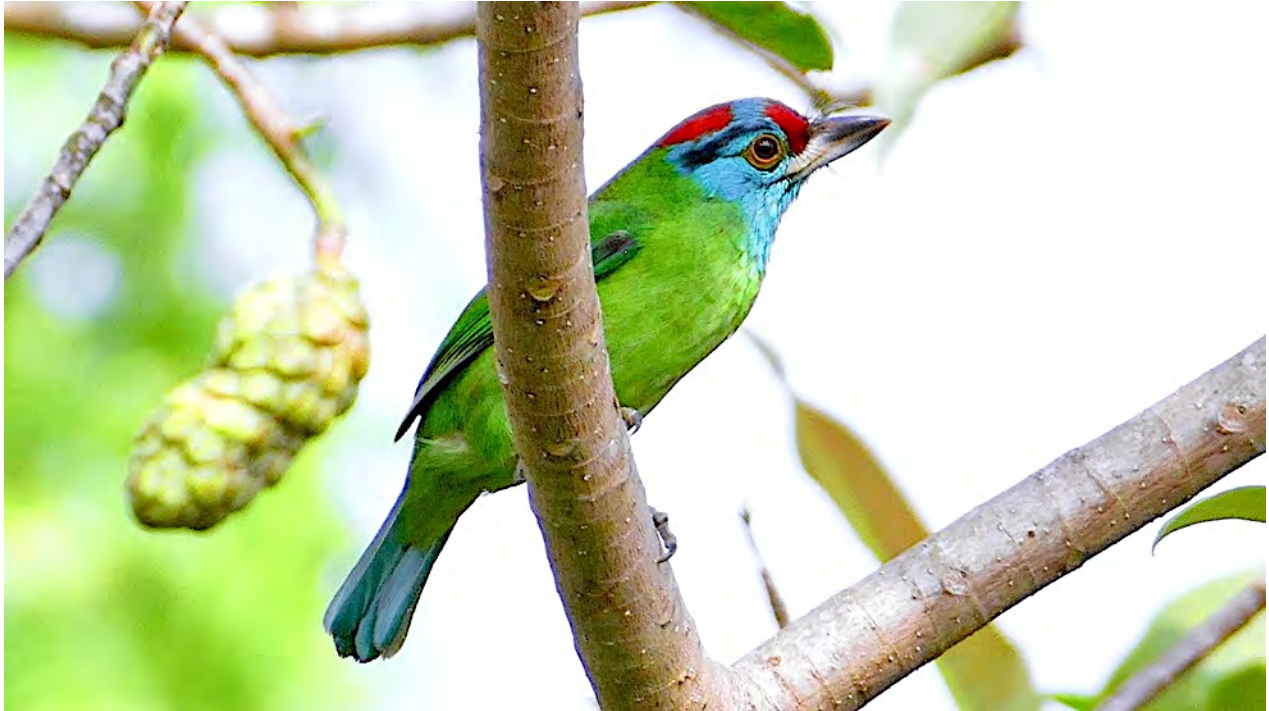
Barbets are common inhabitants of Asian forests, and we'll find quite a few on this tour, including the beautiful Blue-throated Barbet.

We include here information for those interested in the 2024 Field Guides Thailand tour: