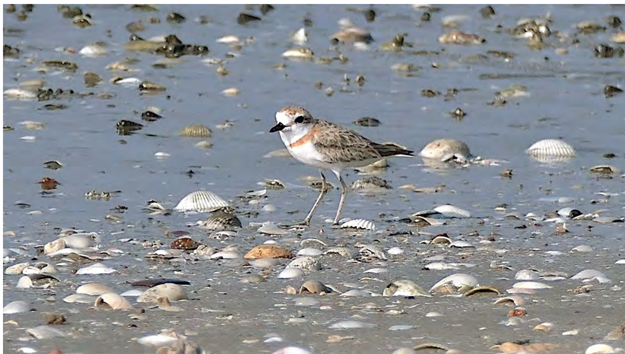
The dainty Malaysian Plover is one of the rarer shorebirds we'll watch for on the beach near Laem Phak Bia.

There are birds aplenty to search for today and tomorrow, including a fine variety of shorebirds, herons, terns, kingfishers, and several very local land birds found in these coastal habitats—like Germain’s Swiftlet, Golden-bellied Gerygone, Mangrove Whistler, and Asian Golden Weaver. In addition to Spoon-billed Sandpiper, we’ll also be looking for some other rare specialties, including Asian Dowitcher, Nordmann’s Greenshank, and the Endangered Chinese Egret. This area of the coast has a long history of turning up some incredible finds! If the tide is right, we’ll plan to take a two-hour boat trip in shallow water today or tomorrow afternoon to a sandy spit in search of the rare and local Malaysian and White-faced plovers (it’s a wet landing at the spit that hosts the plovers). Our very comfortable resort hotel for the night sits right on the beach overlooking the Gulf of Thailand and boasts some fabulous Thai seafood. Night near Laem Phak Bia.