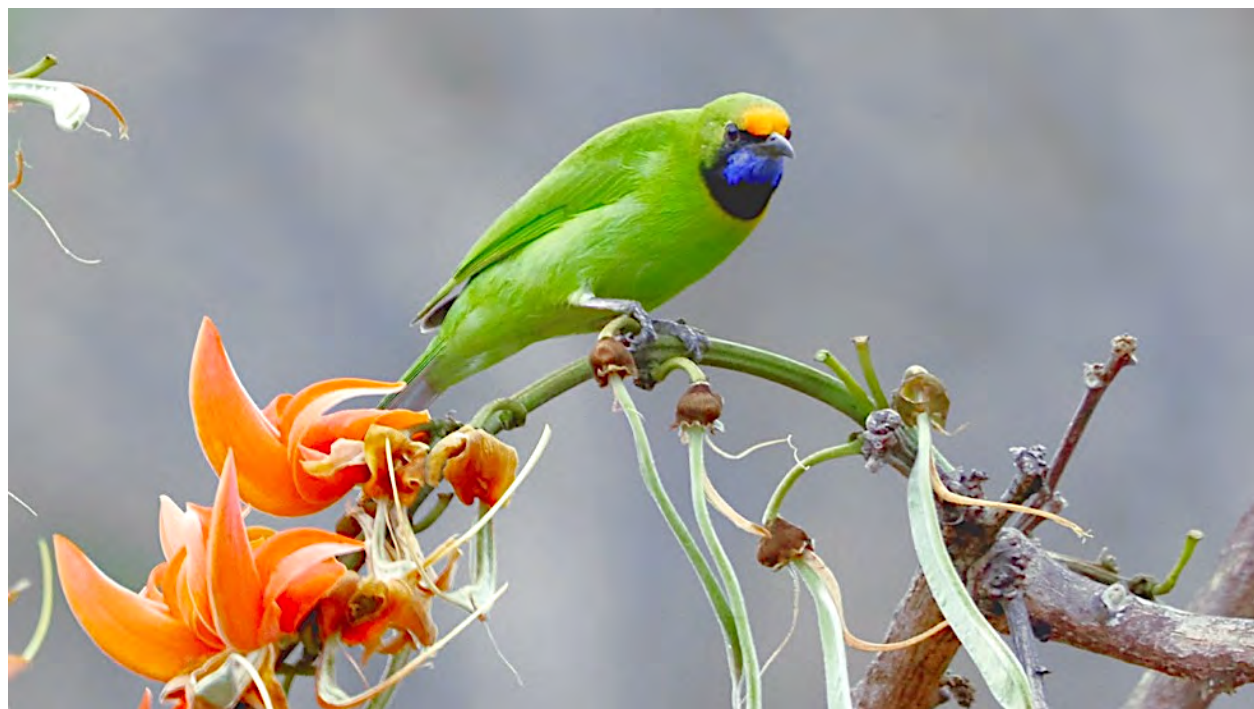
Golden-fronted Leafbird is one of the gaudier birds we'll seek, but they can be very difficult to see, as their color blends in with the trees. We've seen them well on Doi Inthanon.

Day 16, Sun, 26 Jan. Morning birding in lower portions of Doi Inthanon; afternoon drive to Fang. After breakfast, we'll load our bags into our luggage vehicle and we'll head to a nearby dry forested hillside in order to catch a glimpse of the beautiful Blossom-headed Parakeet before it heads off to a favored feeding site. An hour or so of birding here should