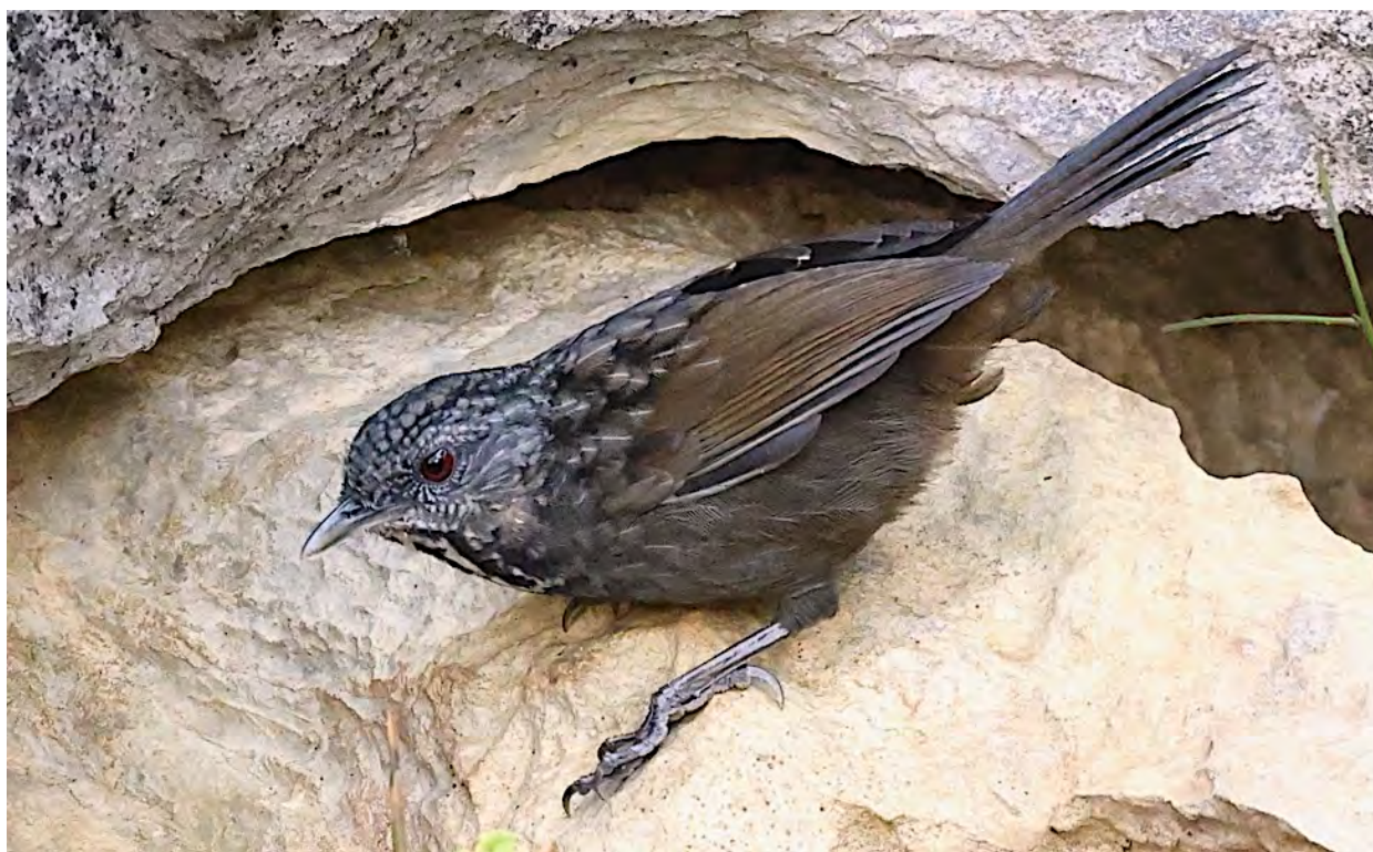
The Annam Limestone Babbler is a skulker, but we've gotten some good looks at them.

Days 17-19, Mon-Wed, 27-29 Jan. Doi Ang Khang and Doi Sanju. We'll use the next 3½ days to explore these two wonderful birding sites, both easily accessible from Fang. On Doi Ang Khang, we'll search for species such as Cook's Swift, Great Barbet, Crested Finchbill, Brown-breasted Bulbul, Spot-throated Babbler, White-browed and White-necked laughingthrushes, Giant Nuthatch, Scarlet-faced Liocichla, Spot-breasted Parrotbill, Russet Bush-Warbler, and Slender-billed Oriole, plus a fine variety of Palearctic migrants such as White-tailed Robin, Chestnut-bellied Rock-Thrush, Daurian Redstart, and Crested, Little, and Chestnut buntings. Targets on Doi Sanju (aka Doi Lang) will include the gorgeous Hume's Pheasant, Necklaced Woodpecker, Gray-backed Shrike, Gray Treepie, Black-throated Tit, Gray-headed Parrotbill, Whiskered Yuhina, Long-tailed Sibia, Ultramarine, Rufous-gorgeted, and Sapphire flycatchers, Siberian Rubythroat, White-bellied Redstart, and even the beautiful, but scarce, Himalayan Cutia, to name just a few. Picnic lunches will be enjoyed in the mountains, allowing us to maximize our birding time at these fantastic sites. Nights in Fang.