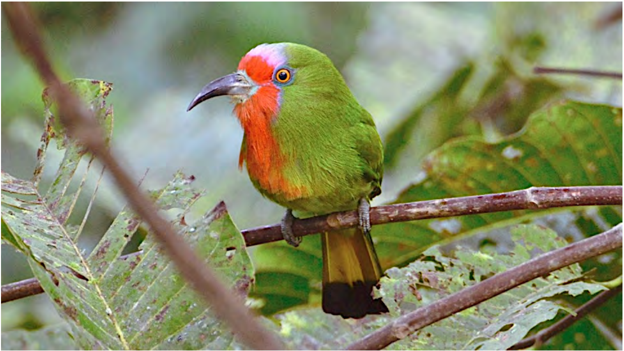
The colorful Red-bearded Bee-eater is found in forested regions of southern Thailand. We'll look for this stunner at Kaeng Krachan National Park.

Kaeng Krachan National Park is Thailand's largest national park and one of Southeast Asia's biggest expanses of accessible forest. The park protects the watershed of a large reservoir about 250 kilometers southwest of Bangkok. The primary habitat in the 3000-square-kilometer park is broadleaf evergreen forest, with small areas of hill evergreen and mixed deciduous forest. We'll devote time to all three of these habitats, but we'll concentrate on the evergreen forest at the higher elevations. Among the most special prizes of Kaeng Krachan are some very range-restricted species—the Rusty-cheeked Hornbill, known only from southern Myanmar and adjacent western Thailand; and Ratchet-tailed Treepie, until discovered here, a species previously known only from Vietnam, Laos, and Hainan Island (China) far to the east.