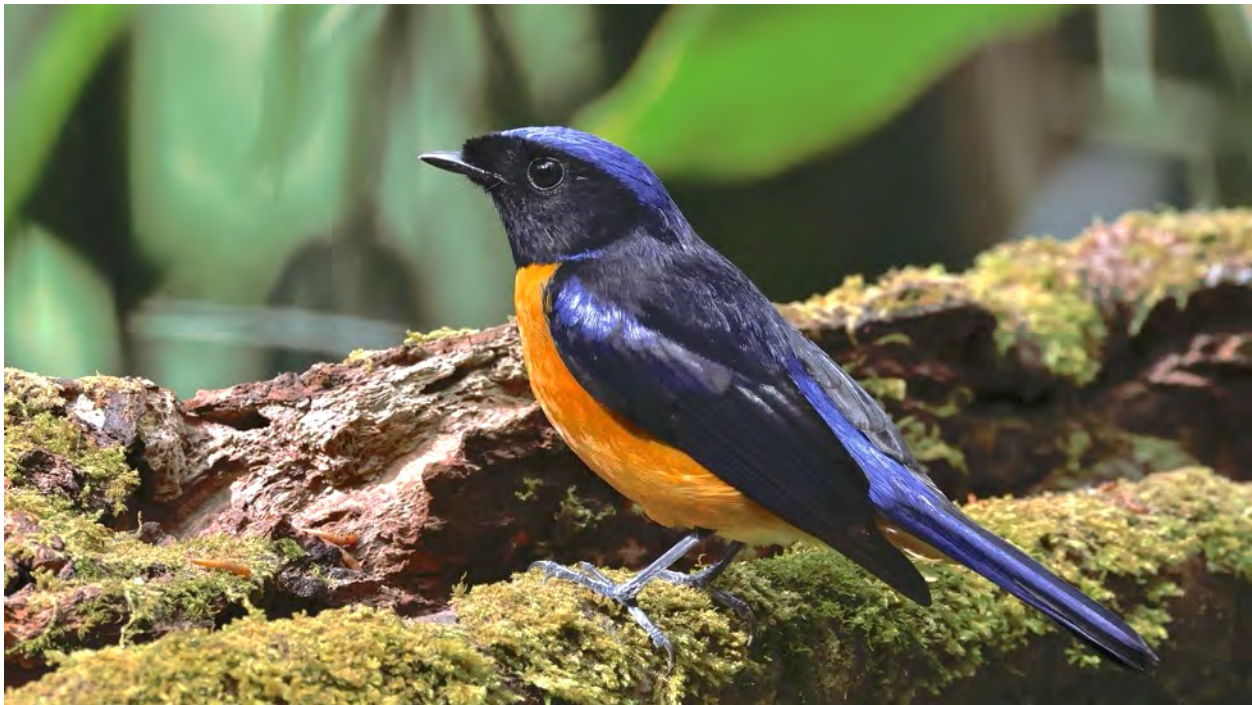
The beautiful Rufous-bellied Niltava is one of many colorful flycatchers we'll see.

As for the "wonderfully different and bizarre," these are many: humongous hornbills with wingbeats that sound like an oncoming locomotive; barbets that should provide the basis for any soundtrack of exotic jungle sounds; the gaudy broadbills; aerodynamic treeswifts that perch on snags and wires; brilliant pittas that hide so well; strangely shaped and exotically colored woodpeckers; forest-loving kingfishers; and drongos with racket tails. Even the prosaic in Europe isn't prosaic if you haven't been to Europe—Doi Inthanon is a fun place to see your lifer Eurasian Jay or Eurasian Hoopoe.