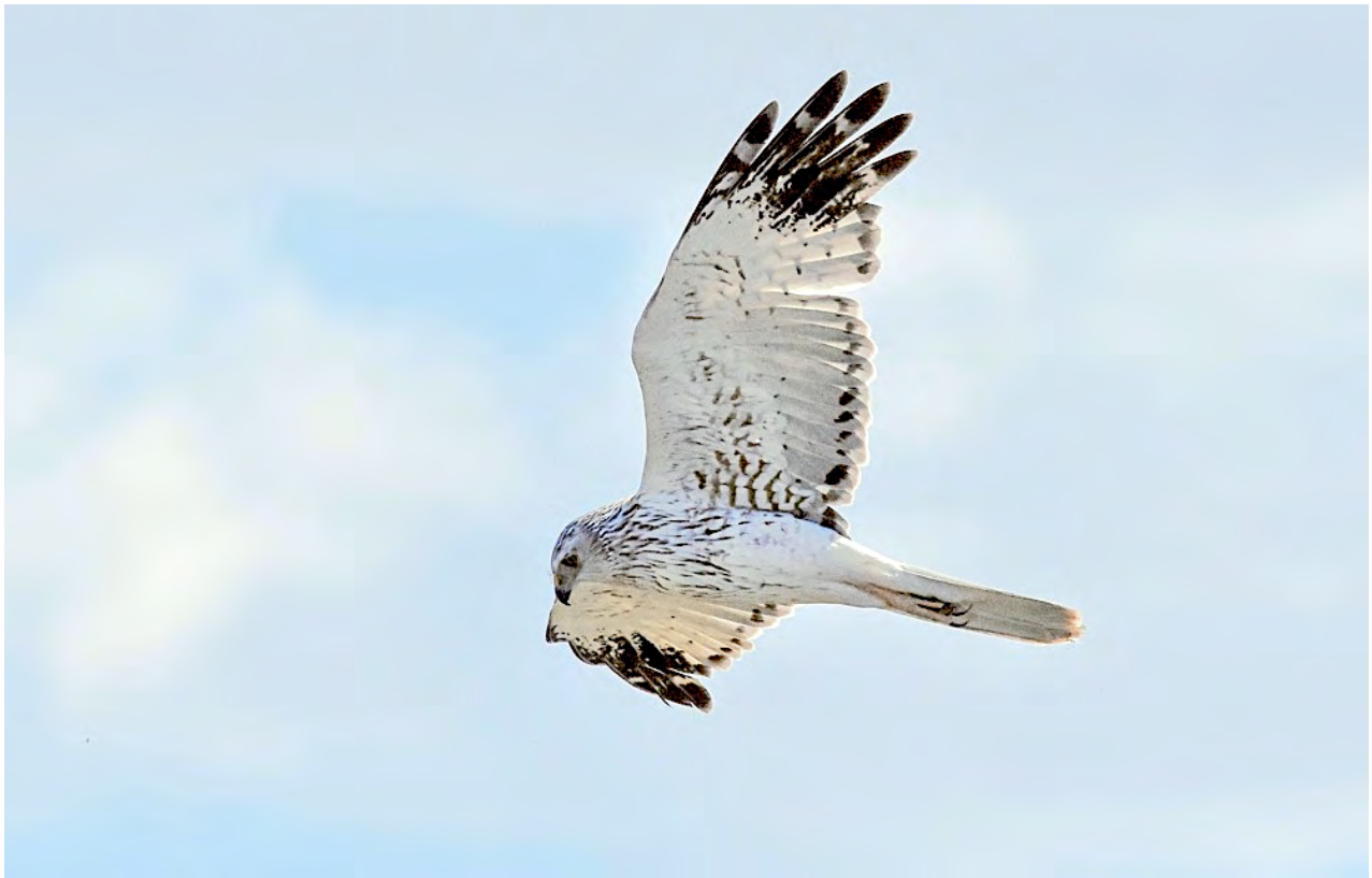
We'll look for Eastern Marsh Harrier when we visit the wetlands along the Mekong River. There is a large harrier roost near Chiang Saen, where we'll see these and the beautiful Pied Harrier.

Chiang Saen —Our final birding venue of the tour lies in the famed ‘Golden Triangle’, where Myanmar, Laos, and Thailand converge along the banks of the impressive Mekong River. We’ll have most of an afternoon and much of the next day to bird the banks of the river, agricultural habitats, remnant patches of forest, and productive lakes in search of the many wintering species found here. We’ll likely see our first Indian Spot-billed Duck, Gray-headed Swamphen, Small Pratincole, and Gray-throated Martin of the trip here, but we’ll want to be especially vigilant for the likes of Baer’s Pochard (individuals of this vanishing species are found in some winters here), Ferruginous and Tufted Duck, River Lapwing and Long-billed Plover (both rare these days), Pied Harrier (large numbers of these can be seen heading to roost late in the afternoon), Freckle-breasted Woodpecker, Baikal Bush-Warbler, Paddyfield Warbler, Chestnut-capped Babbler, Jerdon’s Bushchat, Chestnut-eared Bunting, and many other scarce species. In recent years, even such Thai mega-rarities as Wallcreeper, Firethroat, Chinese Rubythroat, and Mandarin Duck have been found here at this season! It should be an exciting area to finish our birding before we fly back to Bangkok at the end of this tour.