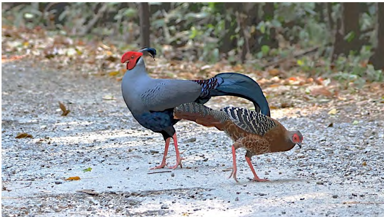
We'll try to get good views of the fabulous Siamese Fireback, the national bird of Thailand. This lovely pair was seen on our 2024 tour.

Should we arrive at our hotel in time to do some additional birding, we may want to stake out a nearby site to witness the early-evening exodus of large numbers of Wrinkle-lipped Free-tailed Bats from their roost within a cave in the limestone mountains. Night near Khao Yai NP.