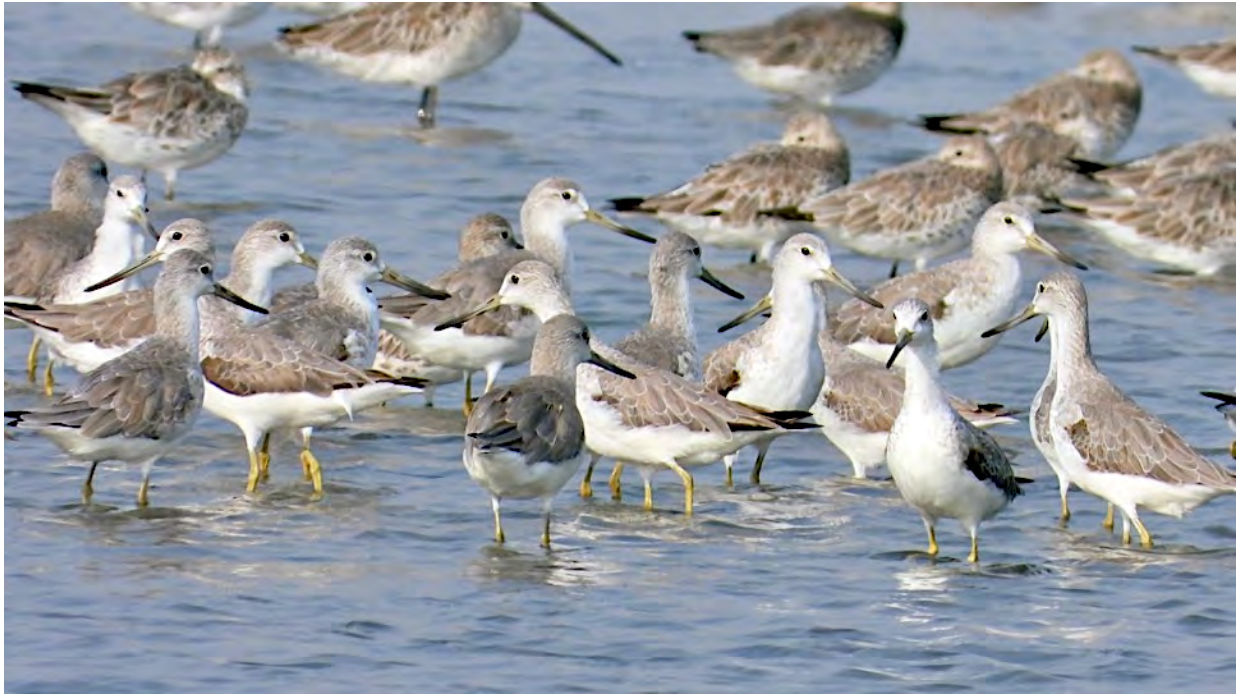
Pak Thale, on the inner Gulf of Thailand, is an important wintering spot for shorebirds such as the endangered Nordmann's Greenshank. We'll also look for the rare Spoon-billed Sandpiper here.