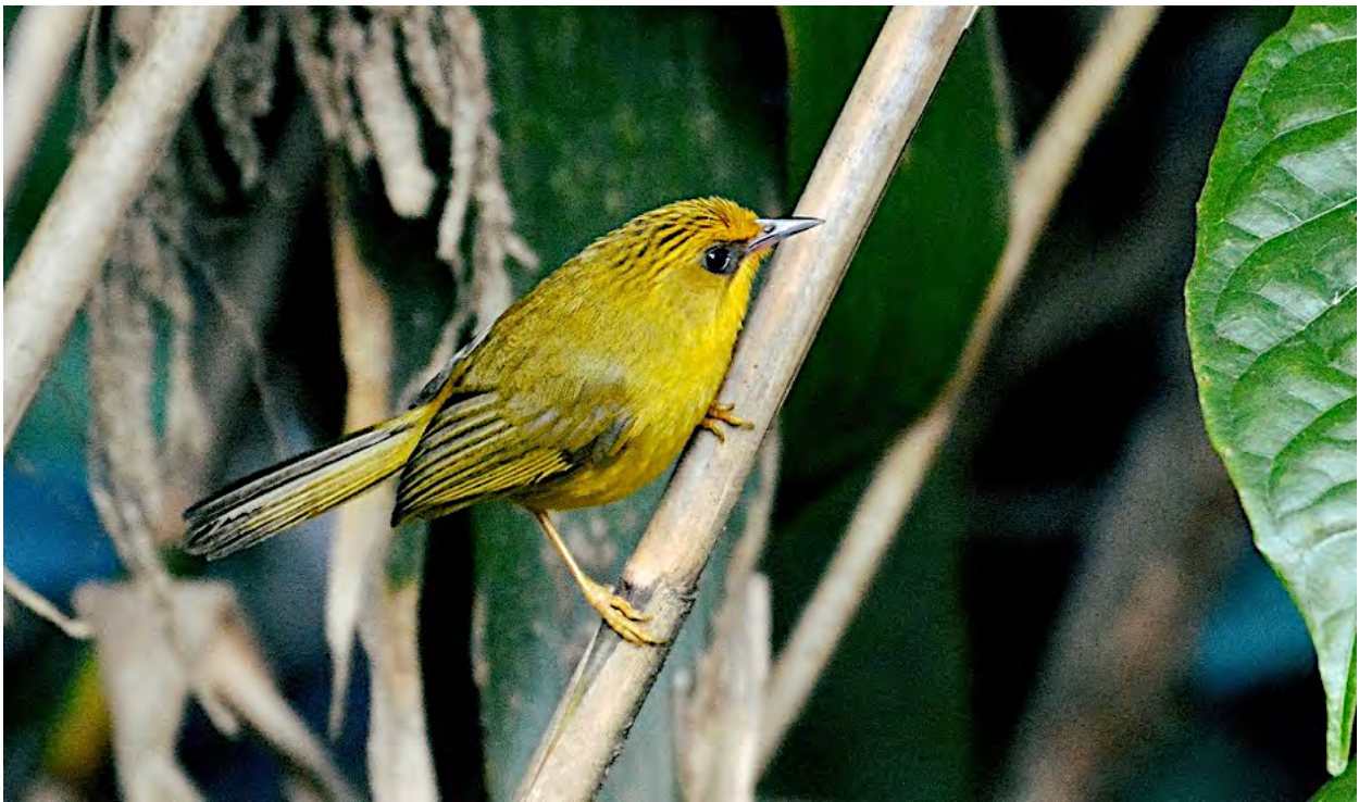
We will look for the charming Golden Babbler on Doi Inthanon and Doi Lang, where we've seen these tiny beauties on previous Field Guides tours.

Nor will we discriminate against the many LDJs (Little Dull Jobs—they are birds, too, and we are a fairly equal-opportunity bird-finding company), such as babblers and leaf warblers. Migrants are in abundance from the lowlands to the rhododendron-lined bog near the summit, a frequent haunt for Eurasian Woodcock, Buff-barred Warbler, Common Rosefinch, and Eyebrowed, Dark-sided, and Gray-sided thrushes.