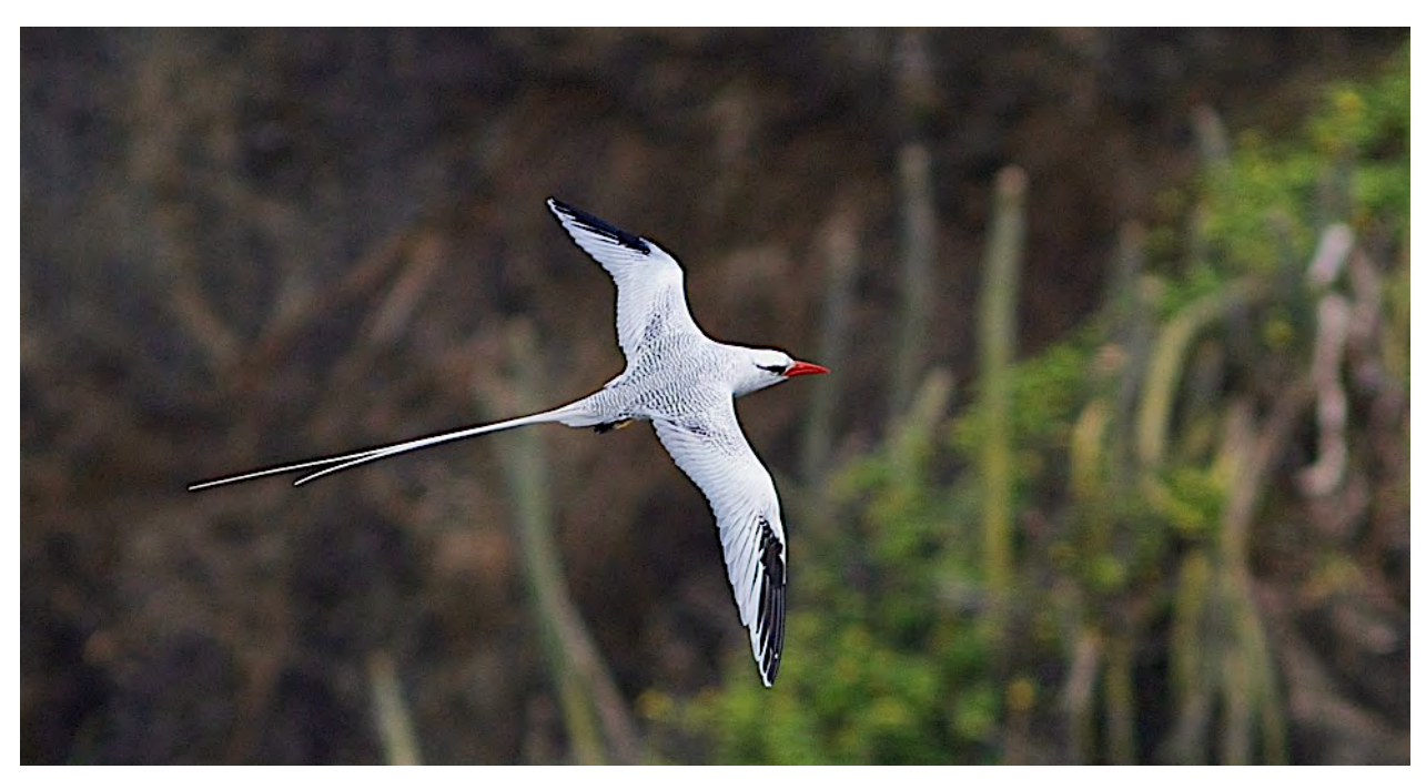
The spectacular Red-billed Tropicbird breeds on Little Tobago, and we should be able to watch them at their nests as well as in the air.

Day 9, 5 Jan. Little Tobago Island. Located just offshore from our seaside hotel, Little Tobago is a small but interesting island that is home to several fascinating species of seabirds. The trip across takes about 20 minutes and can be rough in windy weather; those who are prone to seasickness should take the appropriate measures. Once on Little Tobago, we will climb slowly (up many concrete steps and a wide, dirt trail) to the lookout, where we should be able to see both Brown and Red-footed boobies (the latter in two color morphs) at nests. Even more spectacular are the Red-billed Tropicbirds, which glide past only a few yards away or sit on nests tucked under nearby cacti or broadleaf plants. On our way back to the main island, we might take a bit longer and travel slowly over Angel Reef or the Japanese Garden, giving us an excellent chance to see many spectacular corals and reef fish through the glass bottom of our boat. After lunch at Blue Waters Inn, we'll head to the Tobago airport for the short flight back to Trinidad. Once we arrive, we'll transfer to our hotel, which is located right near Trinidad's Piarco International Airport. Our final dinner will be nearby. Night at Holiday Inn Express Suites in Trincity.