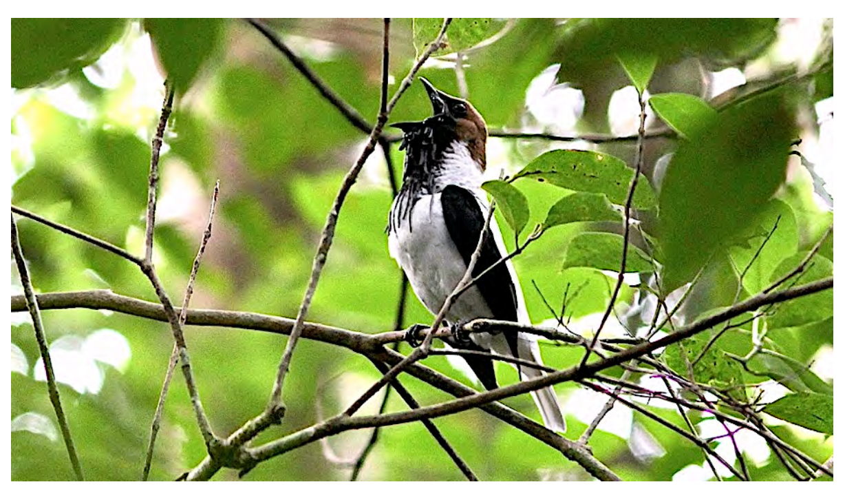
The Bearded Bellbird is an iconic bird of the Neotropics, and we've had great views of them at AWNC.

Trinidad, measuring about forty by fifty-five miles and much closer to the mainland, is the larger and more diverse of the two islands. Here, while based at the Asa Wright Nature Centre, we'll explore the rainforest of the island's Northern Range, the drier savanna and scrub habitats near the old Waller Field air base, and the freshwater marsh at the edge of the island's huge Nariva Swamp. But we won't have to go very far to enjoy birding during our stay at Asa Wright. The Centre's grounds are full of birds, with tanagers and honeycreepers crowding the feeding trays at the veranda, hummingbirds buzzing at the garden flowers, and Crested Oropendolas hanging upside down in vocal display from adjacent trees.