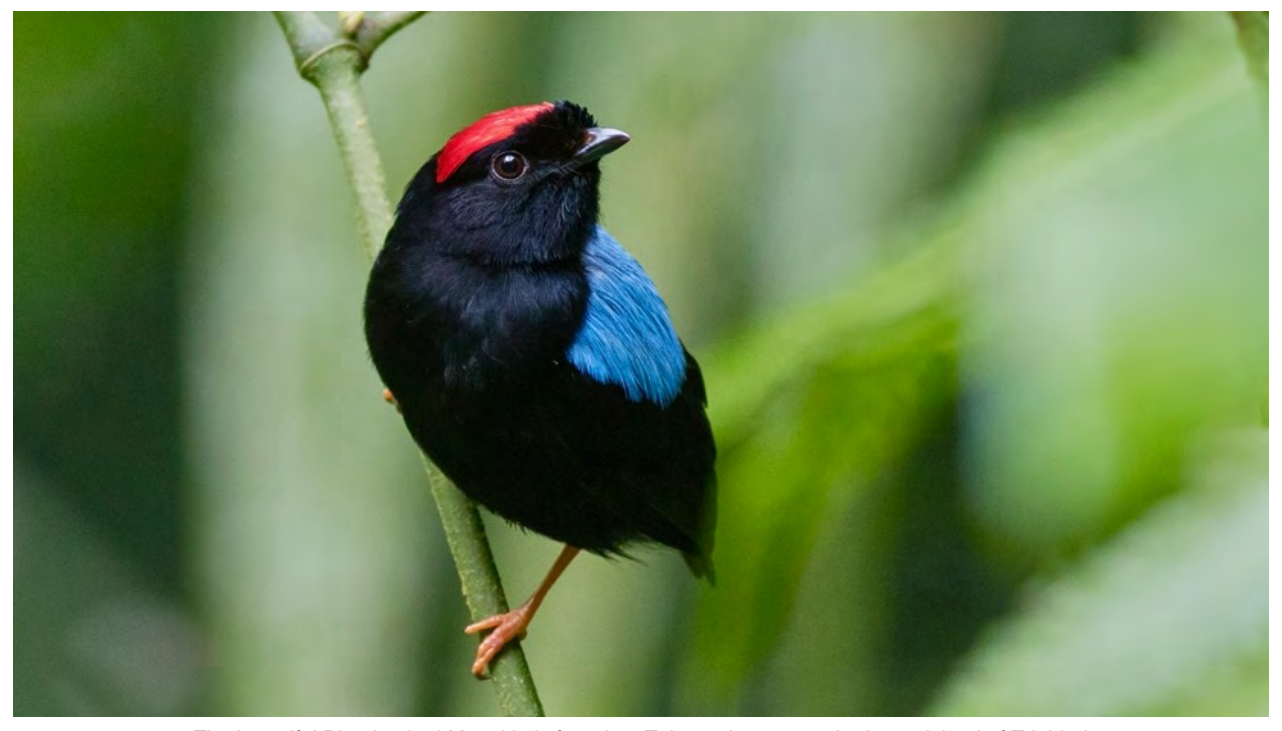
The beautiful Blue-backed Manakin is found on Tobago, but not on the larger island of Trinidad.

We include here information for those interested in our 2023 Field Guides Trinidad & Tobago tour: