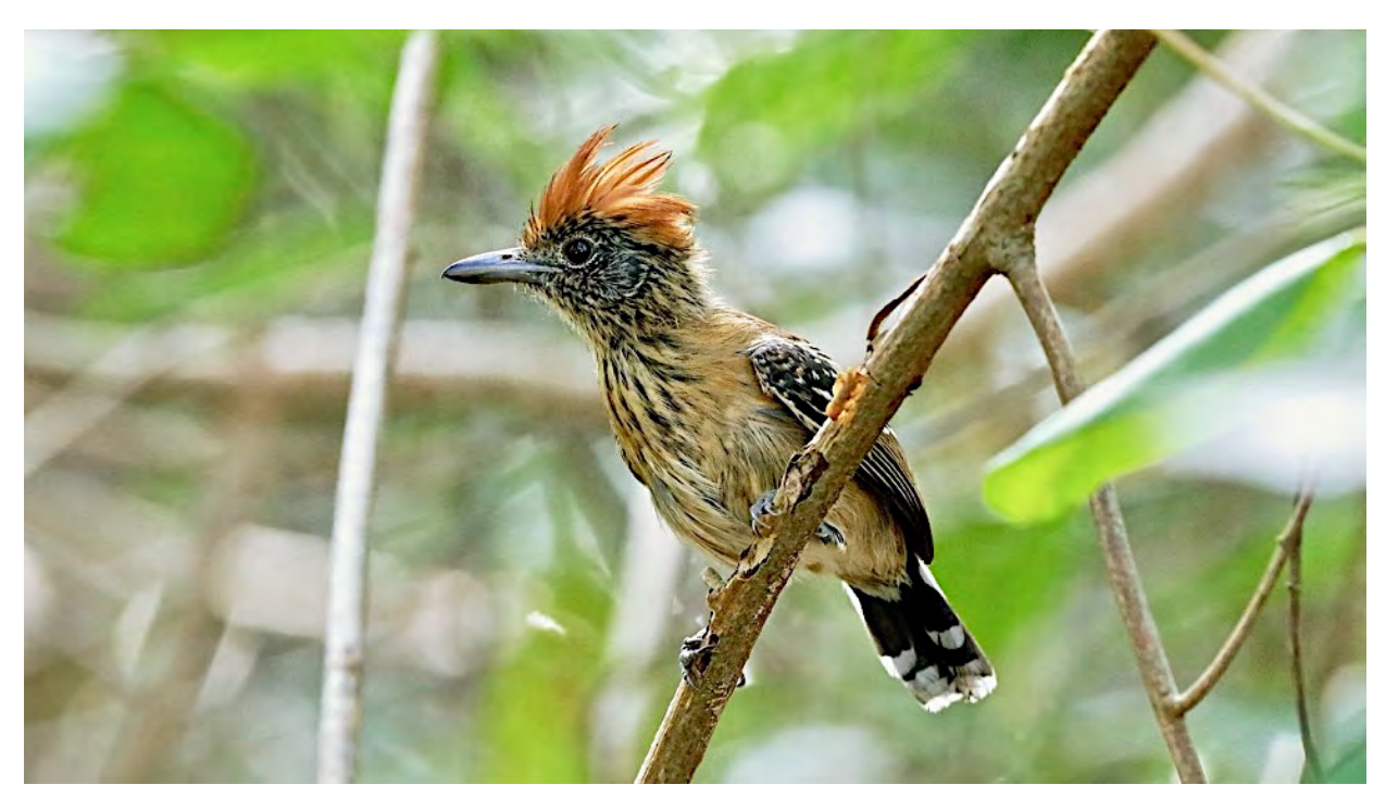
This female Black-crested Antshrike shows that all female birds are not dull! This species is one that is found from the northern parts of the South American continent to Trinidad.

Our first morning will be hectic, with dozens of hummingbirds, honeycreepers, and tanagers having a mass breakfast on the Centre's legendary feeders, while toucans, bellbirds, oropendolas, or even an Ornate Hawk-Eagle might perch further out on a matchwood snag. As we traverse the Northern Range along the Blanchisseuse Road, the quality forest we first encountered at the Centre continues in breathtaking beauty and is home to a host of much-anticipated species, including White Hawk, Blue-headed Parrot, Green-backed Trogon, Black-faced Antthrush, Gray-throated Leaftosser, Golden-headed Manakin, Speckled Tanager, and more. Trinidad's lowlands are much altered but still contain some very important habitats. We'll visit the Nariva Swamp on the east coast, searching for highlight species like Pinnated Bittern, Silvered Antbird, Black-crested Antshrike, Ringed and Green kingfishers, and numerous raptors.