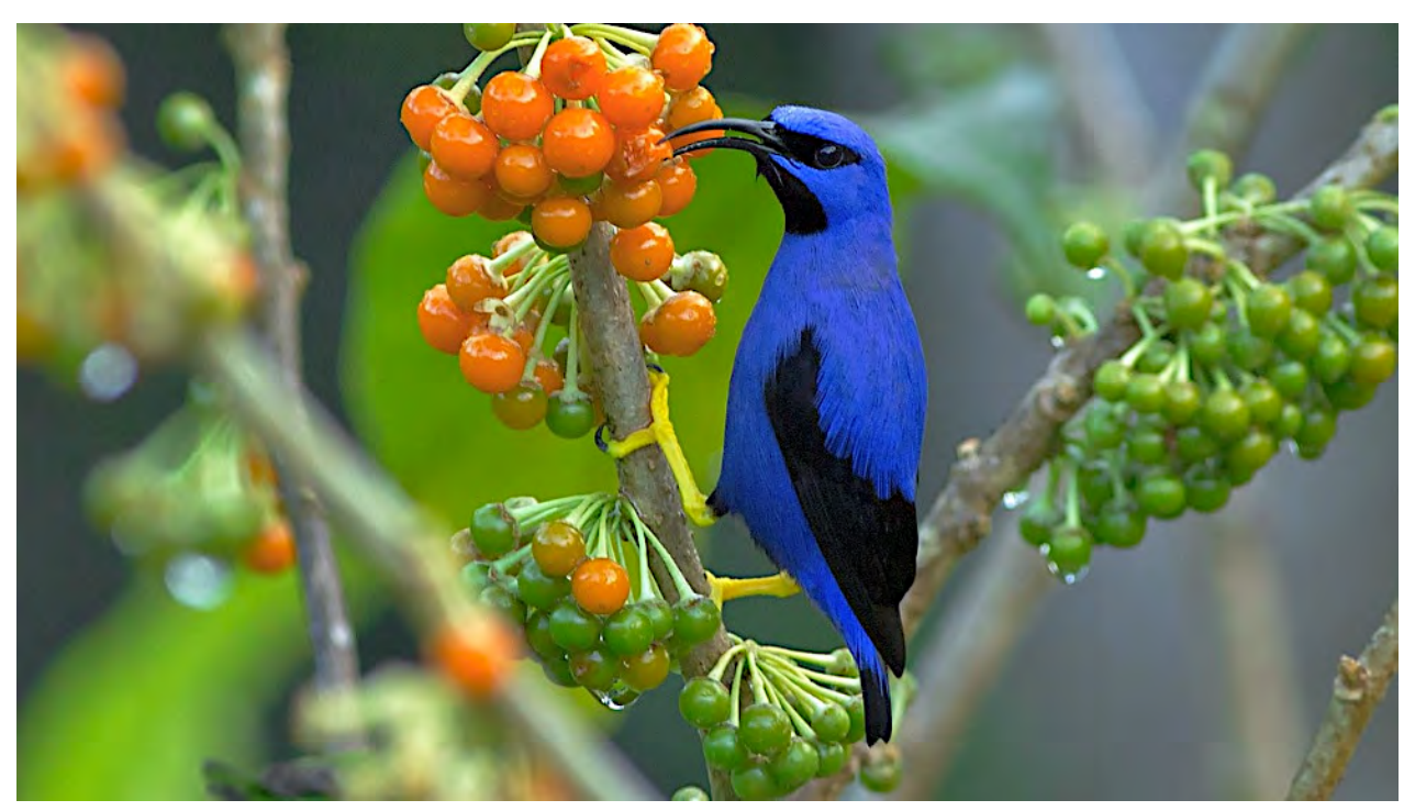
The subspecies of the brilliant Purple Honeycreeper found on Trinidad is endemic to the island.

About the Trinidad Piping-Guan: On our itinerary, we have a low to moderate chance of encountering the Trinidad Piping-Guan, an endemic Cracid found only in Trinidad's Northern Range. For those who might be interested in booking a pre- or post-trip extension through Asa Wright Nature Center to seek the Trinidad Piping-Guan in Grand Riviere at the northeastern corner of Trinidad, please contact our office.