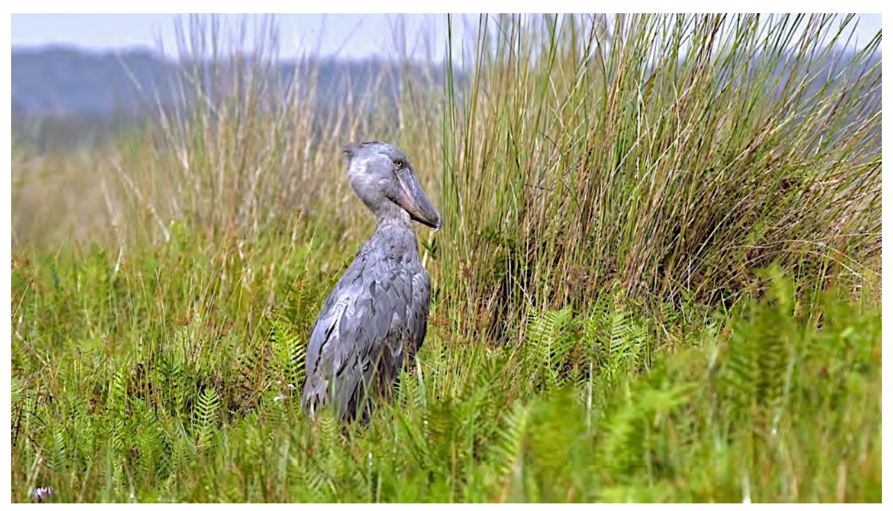
Of course, finding a Shoebill is one of our priorities on this tour. These amazing birds can be found in the Mabamba Swamp, near Entebbe.

be realistic about the situation. We will do the best we can, and we work with a great local operator. You must contact our office to reserve and purchase your permit(s) at the time of your deposit. Availability of permits is not guaranteed until payment is made.