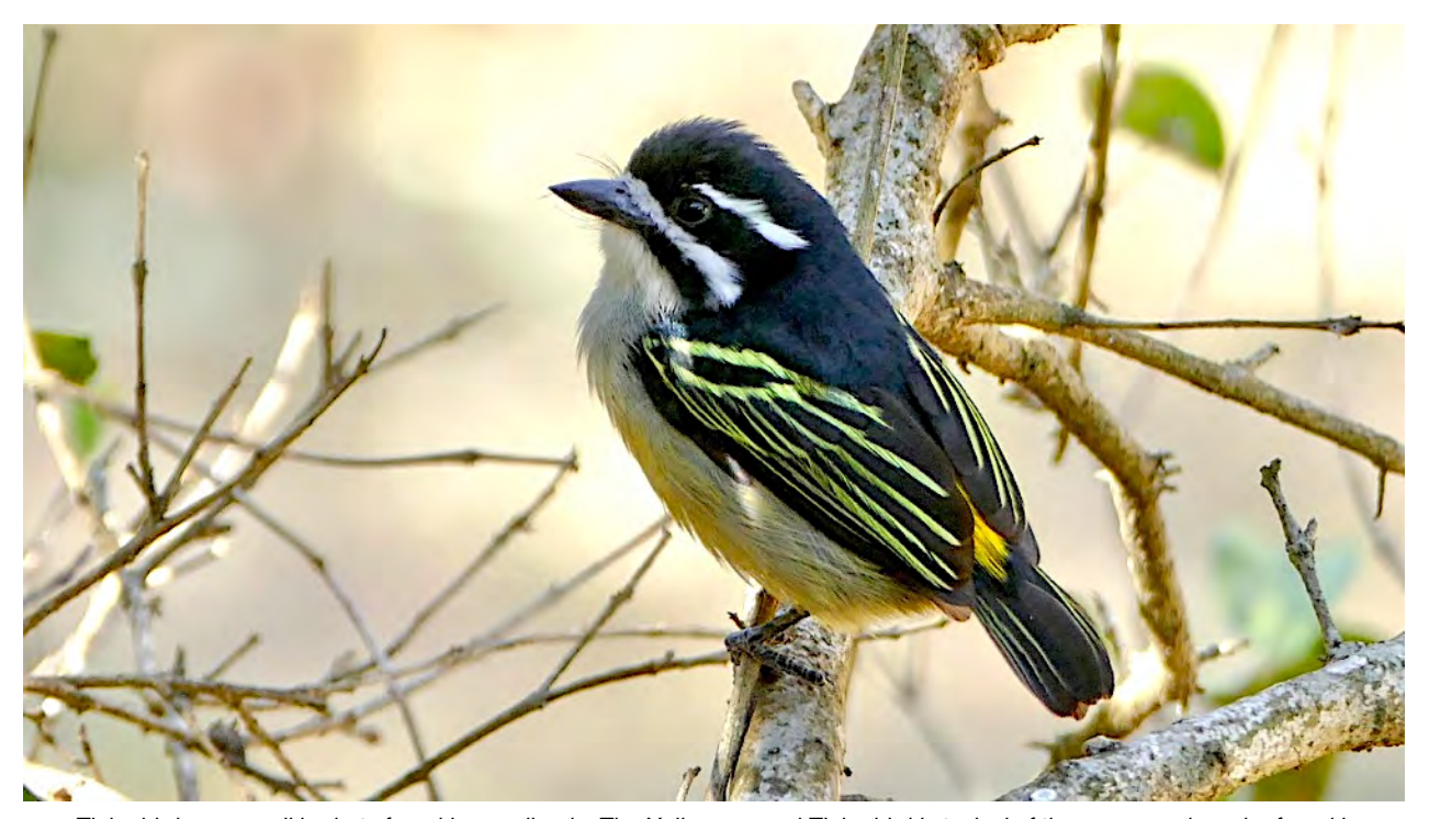
Tinkerbirds are small barbets found in woodlands. The Yellow-rumped Tinkerbird is typical of the group, and can be found in many forested areas. We'll watch for it when we are in Kibale Forest.

Birdlife is prolific, but as in many tropical forests, birds can be shy and difficult to observe. The park is a good site for a number of birds that are hard to find elsewhere, including Speckle-breasted Woodpecker, Cabanis's and Joyful greenbuls, White-spotted Flufftail, Olive Long-tailed and Dusky Long-tailed cuckoos, Lesser and Least honeyguides, Blue-shouldered Robin-Chat, White-chinned Prinia, Gray Apalis, Olive-green Camaroptera and White-collared Oliveback. We'll hope for Gray Parrot, Narina's Trogon, Gray-throated Barbet, Honeyguide Greenbul, White-tailed Ant-Thrush, Fire-crested Alethe, African Shrike-Flycatcher, Narrow-tailed Starling, and White-breasted Nigrita. If we're extremely lucky, we may also see African and Green-breasted pittas, Black Bee-eater, Yellow-rumped Tinkerbird, Little Greenbul, Brown-chested Alethe, Blue-breasted kingfisher, and Crowned Eagle. Night at Chimpanzee Forest Lodge.