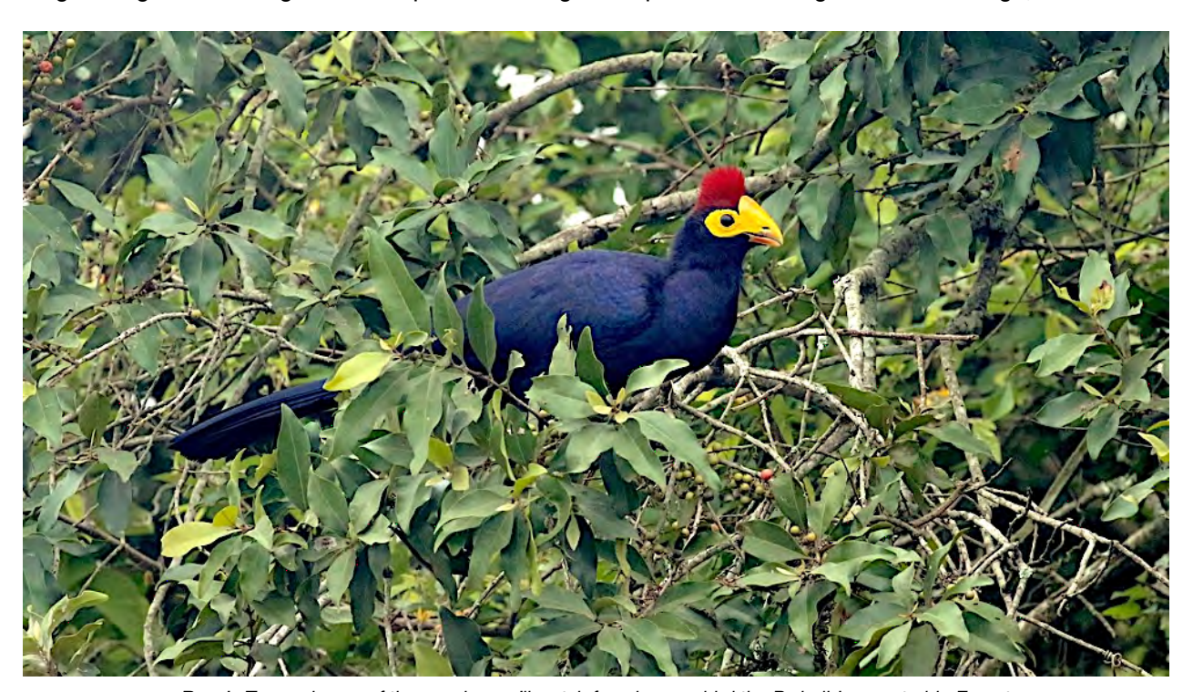
Ross's Turaco is one of the species we'll watch for when we bird the Bwindi-Impenetrable Forest.

Day 7, Fri, 7 Nov. The Bwindi-Impenetrable Forest. After an early breakfast, we'll report to the park headquarters for a briefing prior to heading out into the forest in search of Eastern Mountain Gorillas. Several groups of habituated gorillas are accessible to visitors at the park, and by prior arrangement, we will have an opportunity to visit these magnificent creatures. However, please note that only a limited number of visitors are allowed to see them on any one day, so visits must be booked well in advance (see About Gorillas for more information). We'll do our best to stick together as a group, but (depending on our group size) it's possible the park officials may split us up between multiple groups. It's a fantastic (some prior clients have said life-changing) experience to stare into the eyes of these gentle giants, and watch as they eat, groom, play and go about their daily activities. While some gorilla families may be closer than others (and thus require less hiking to reach them), you must expect to be out all day hiking, walking, scrambling, etc. to see your gorilla family, typically leaving at 8:30 a.m. and not returning until 3 or 4 p.m. For $30 US, you can hire a porter to carry your belongings and help you up and down the hills; believe us, it's money very well spent! Those who don't think they're up to the rigors of gorilla tracking have the option of birding in the park instead. Night at Haven Lodge, Buhoma.