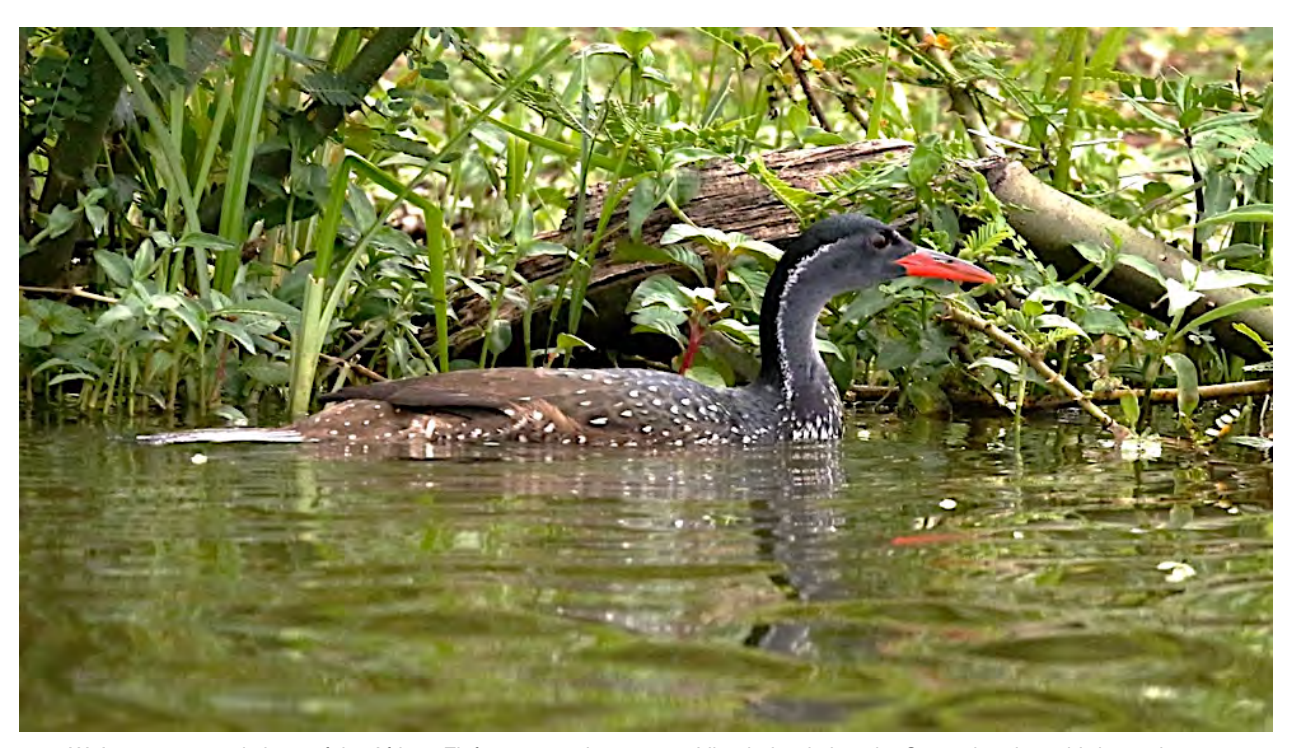
We've gotten good views of the African Finfoot on previous tours. Like their relative, the Sungrebe, these birds can be very secretive, but they are known from Lake Mburo.

In the afternoon, we'll proceed to Lake Mburo National Park, stopping along the way if we see anything of interest. Night at Kigambira Safari Lodge, a very comfortable, classic, old-style safari tent camp.