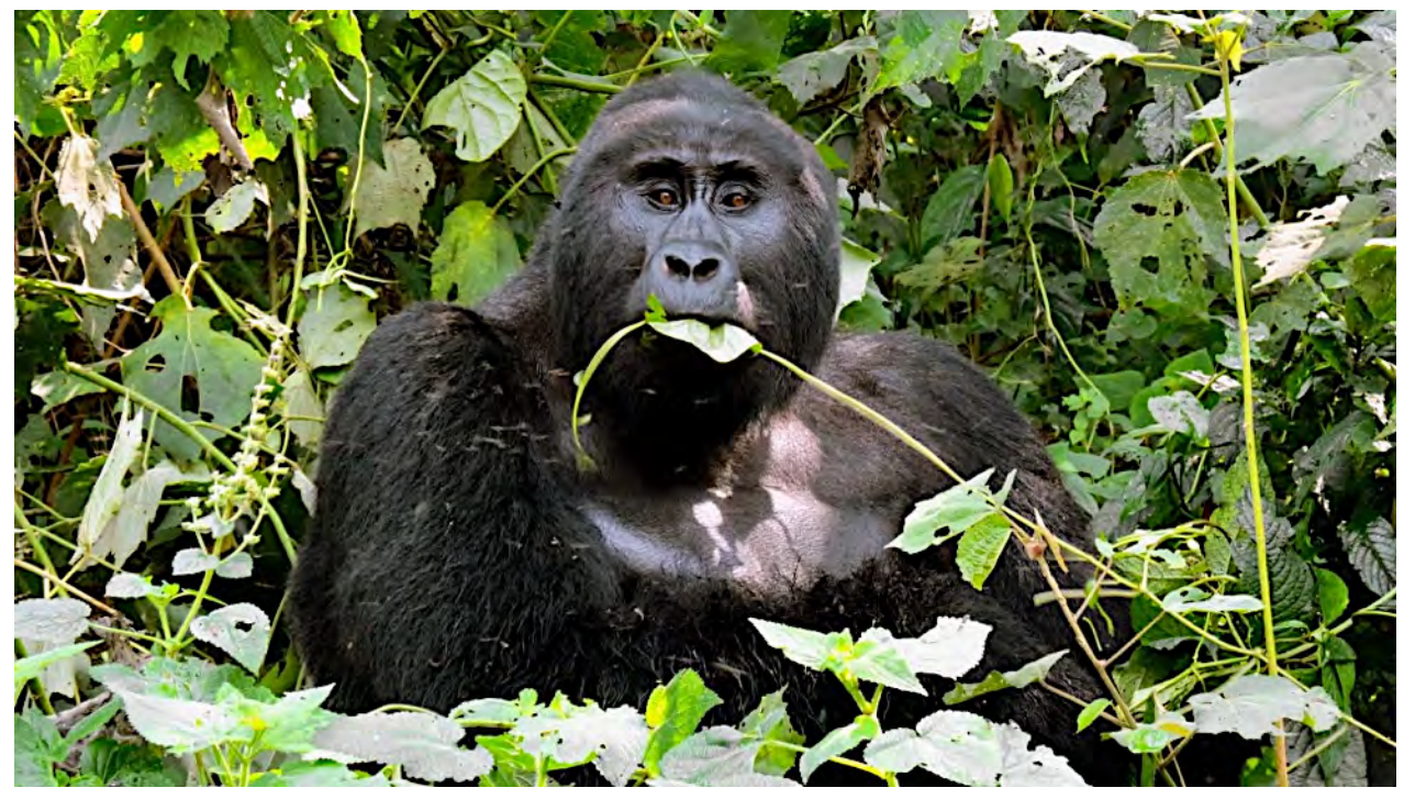
Bwindi-Impenetrable Forest is the home to the endangered Eastern Mountain Gorilla. On this tour, we'll have the chance to climb into the mountains to visit a family of habituated Gorillas.

We include here information for those interested in the 2025 Field Guides Essential Short Uganda tour: