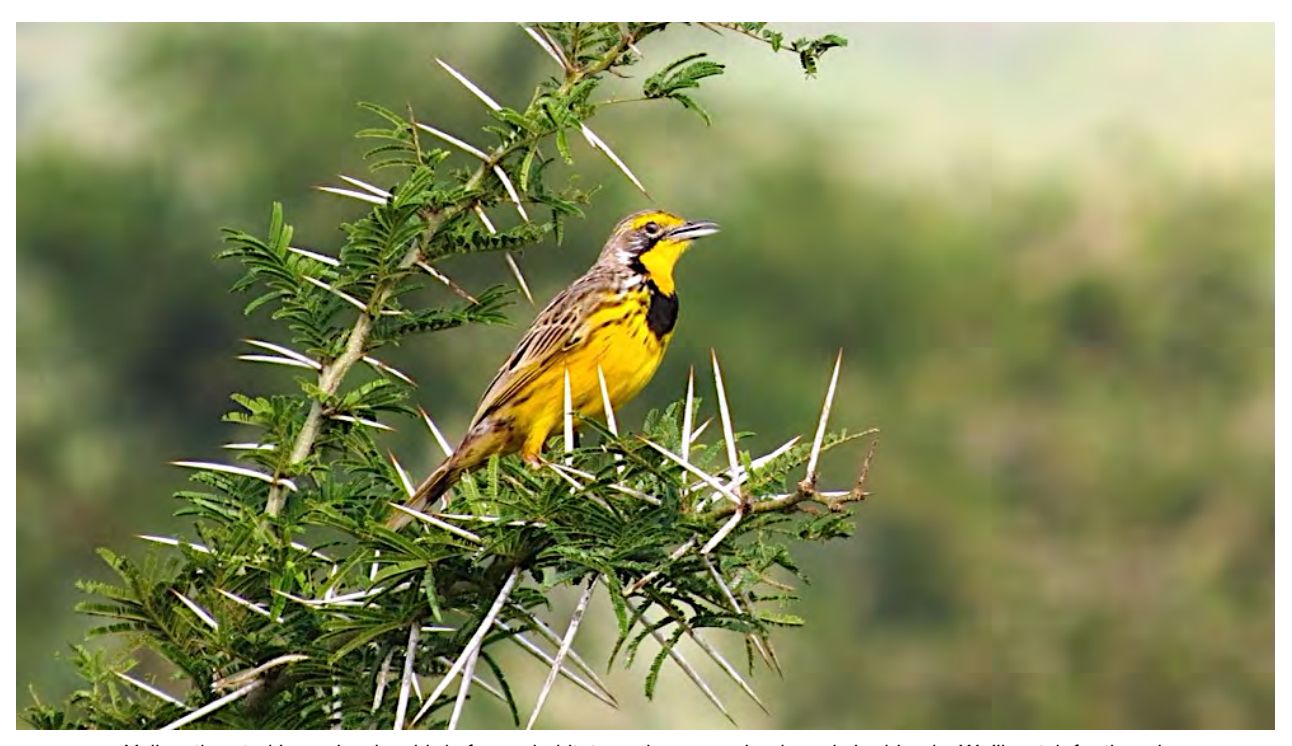
Yellow-throated Longclaw is a bird of open habitats such as grasslands and shrublands. We'll watch for them in Queen Elizabeth National Park.

Day 9, Sun, 9 Nov. To Queen Elizabeth National Park. This morning, we'll drive north to Uganda's second-largest national park—Queen Elizabeth National Park, named for the queen of England, who visited the park in 1954. In terms of diversity, it ranks among the best birding destinations in Uganda, with more than 610 species recorded and a one-day record of 296 species. Special birds include Harlequin and Blue quails, Small Buttonquail, African Crake, White-winged Warbler, Martial Eagle, African Skimmer, Verreaux's Eagle-Owl, Ovampo Sparrowhawk, Greater and Lesser flamingoes, Caruthers's Cisticola, Secretary Bird, and Temminck's Courser. Mammals may include African Elephant, Spotted Hyena, Leopard, Lion, Kob, Side-striped Jackal, Olive Baboon, Bushbuck, Waterbuck, Warthog, and Giant Forest Hog, to mention but a few. Our newly renovated lodge is situated on a hill overlooking both Lake Edward and the Kazinga Channel; beyond it lies an extensive area of rolling grass-covered hills, wooded valleys, and a series of extinct volcanic craters. Night at Mweya Safari Lodge.