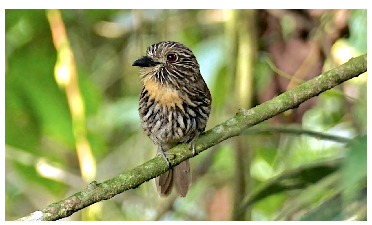
Black-streaked Puffbirds have a limited range along the eastern slope of the Andes. Wildsumaco Lodge is located at the perfect elevation for this uncommon species, so we'll be watching for it!

As we look for all these specialties, additional good things will happen, like being shown a Great Potoo on a dayroost or seeing a Solitary Eagle circling overhead. We're excited about the prospect of sharing this wonderful site.