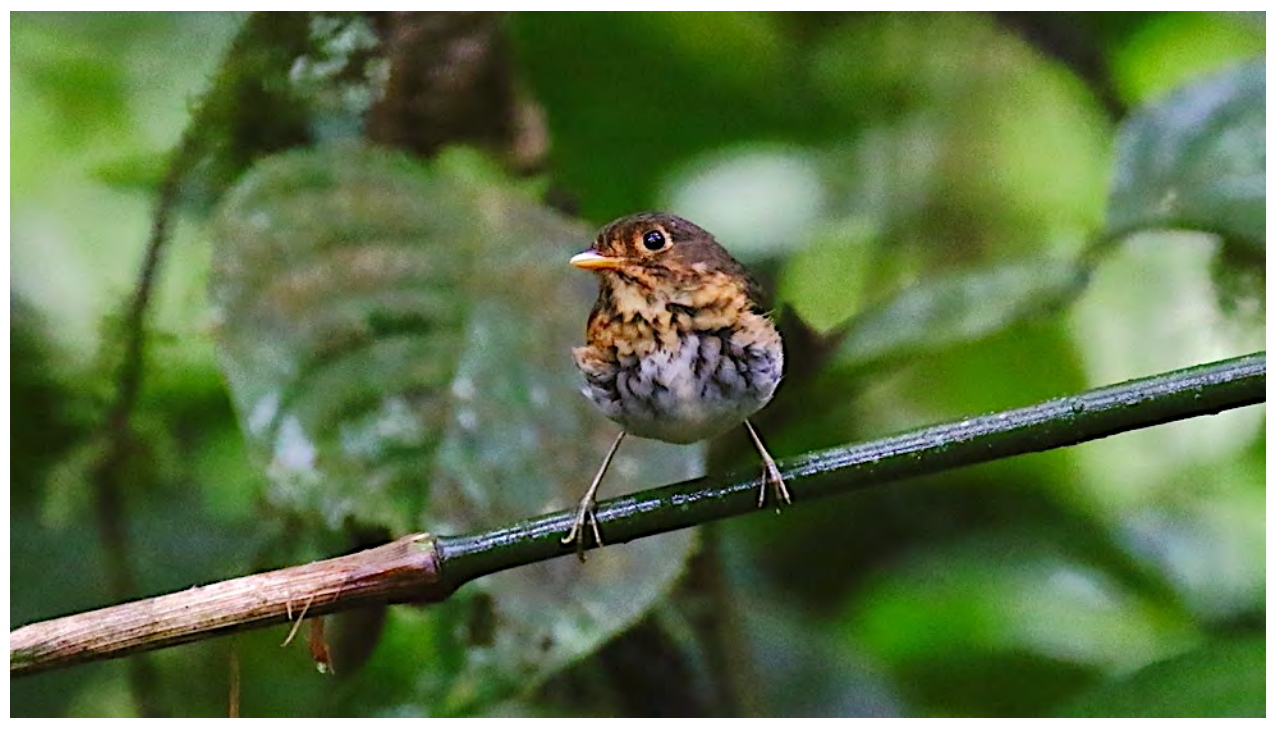
The tiny Ochre-breasted Antoitta is one of the species that has been "trained" to come to worm-feeders at Wildsumaco, giving us a chance for great views of these charming little birds.

We include here information for those interested in the 2023 Field Guides Holiday at Ecuador's Wildsumaco Lodge tour: