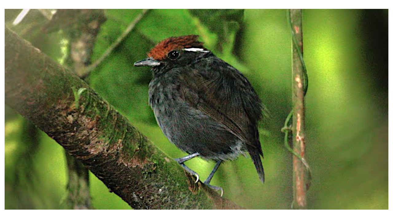
The Chestnut-crowned Gnateater is another species confined to the Andes. While these tiny birds are generally uncommon, we've had good luck finding them at Wildsumaco.

The Lodge is located on the edge of a deep valley, and from the deck there is a fabulous view of both forest and clearings (with, we will admit, the sound of chainsaws intruding from time to time and reminding us of the current threatened status of much of the accessible foothill forest). Hummingbird feeders at the edge of the deck buzz with activity (often including Napo Sabrewing, Lazuline Sabrewing, Black-throated Brilliant, and Gould's Jewelfront!), and the purple-flowered vervain hedge attracts Gorgeted Woodstars, Wire-crested Thorntails, and Violet-headed Hummingbirds. It is a great place from which to watch swifts and raptors, mixed flocks moving through the patches of trees below, and birds that "sit out" in the late afternoon, ranging from flycatchers to frugivores. On the occasional "really clear day," Volcan Antisana is visible from the deck and Volcan Sumaco looms at close range from the road; and views out over forested valleys and ridges (a series of smaller ridges lie between Sumaco and the Amazonian lowlands) are also inspiring. The main lodge building is one large, open room that includes the bar, living room, and dining area. Beside/behind the main lodge building are two detached wings, each with five private rooms. Several trails enter the forest beside the lodge, while another enters forest across the road.