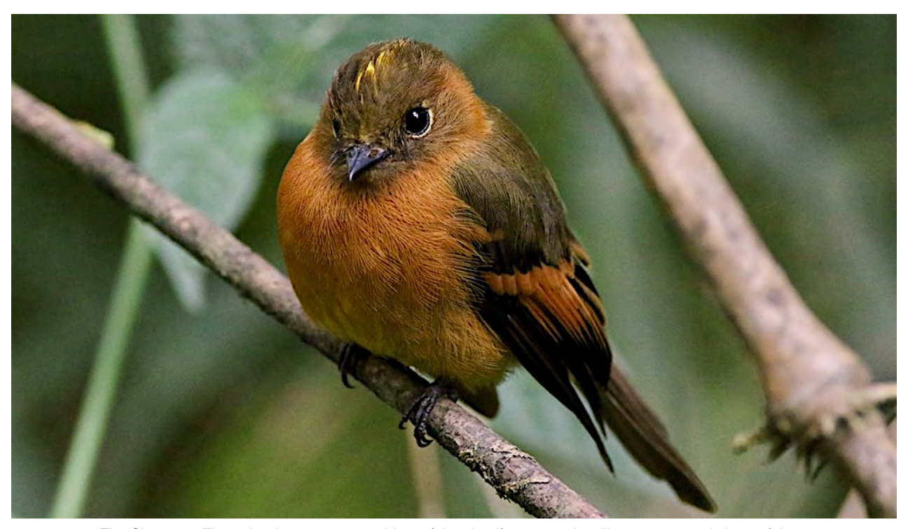
The Cinnamon Flycatcher is a common resident of the cloudforests, and we'll get some good views of these lively little birds at San Isidro.

Day 2, Thu, 28 Dec. Antisana Reserve; to San Isidro. We'll start with an early buffet breakfast with a departure from the hotel shortly after. (Bags should be outside your room before you arrive for breakfast.) We'll take a box lunch with us to eat during our travels. We'll head straight for Antisana Reserve, where we'll be birding mostly above treeline, from the road edge near the bus, for several hours. We'll be moving slowly at these high elevations, where the weather can vary from cloudy and cold to sunny and warm, so layer up and bring raingear just in case. Chances are that it will be warming up some by the time we reach the birding areas, and you'll want to peel a layer; but a wind or a cold mist can reverse that. We'll have water on the bus, but you'll need your own water bottle with you (to sip frequently), as one dehydrates easily in these high climes. After our picnic lunch en route, we'll plan to stop at Guango Lodge for a short break (if time permits). We can sort through the hummingbirds at the feeders, watching especially for any interesting puffleg, the Sword-bill, and the scarce Mountain Avocetbill. Then we'll continue to San Isidro for the night. We'll hope to meet the San Isidro Owl after dinner. Night at the Cabañas San Isidro near Cosanga.