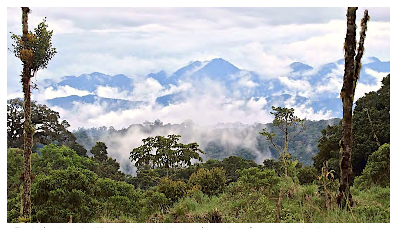
The view from the porch at Wildsumaco Lodge is nothing short of extraordinary! One can only imagine what birds are waiting to be discovered!

Field Guides first visited Wildsumaco in March of 2008, shortly after it opened. We realized immediately that this new lodge, at a perfect elevation (4600 feet or 1400m) and reachable from Quito in one day, was in a dreamy location. The panoramic view from the big deck, toward the main cordillera of the Andes, is truly awe-inspiring, and the quiet for sleeping is wonderful. Designed for birders by birders (Jonas Nilsson and Bonnie and Jim Olson), it offers all the amenities that birders appreciate, including well-lit, spacious rooms (with plenty of hooks and electric outlets), good beds, private baths with hot-water showers, boot jacks on the porches, and a great boot-washing station. The central lodge building, with a big, partially covered deck off the back, houses a clean, modern kitchen and a large, open (and beautifully appointed) dining area and a sitting area, complete with a bar and a fireplace. Delicious, home-style cooking, at whatever hours we want it, is included in the price of the lodging.