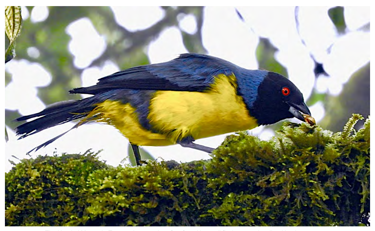
The Hooded Mountain-Tanager is a species often found in small flocks, occasionally with other tanagers.

The line between specialties of "outlying ridges" and simply special foothill species is largely one of relative abundance. Other notable foothill species we seek include Sickle-winged Guan, Rufous-breasted Wood-Quail, Spotwinged Parrotlet, Military Macaw, Rufescent Screech-Owl, Band-bellied Owl, Many-spotted Hummingbird, Wire-crested Thorntail, Coppery-chested Jacamar, Black-streaked Puffbird, Chestnut-tipped Toucanet, Yellow-throated Toucan, Dusky Spinetail, Black-billed Treehunter, Lined Antshrike, Foothill and Ornate Stipplethroat, Yellow-breasted, Rufous-winged and Rufous-rumped Antwrens, Black, Spot-backed ( terra firme ) and Common Scale-backed (foothills) antbirds, Rufous-breasted and Short-tailed antthrushes, Plain-backed Antpitta, White-crowned Tapaculo, Black-and-white Tody-Tyrant, Ecuadorian Tyrannulet, Lemon-browed Flycatcher, Green-backed (Yellow-cheeked) Becard, White-crowned ( D. p. coracina ) and Golden-winged manakins, Foothill Schiffornis ( S. aenea ), Gray-mantled and Musician wrens, Slaty-capped Shrike-Vireo, Olivaceous Greenlet, Gray-mantled Wren, Speckled Nightingale-Thrush, Blue-browed Tanager, Ashythroated and Yellow-throated Chlorospingus, Golden-collared Honeycreeper, and Deep-blue (Golden-eyed) Flowerpiercer. Only a few tanagers have been mentioned, but this zone is a superb one for tanagers, many of them widespread and many of them jaw-dropping, including 13 species of Tangara (think Orange-eared, Golden, Golden-eared, ...Paradise)!