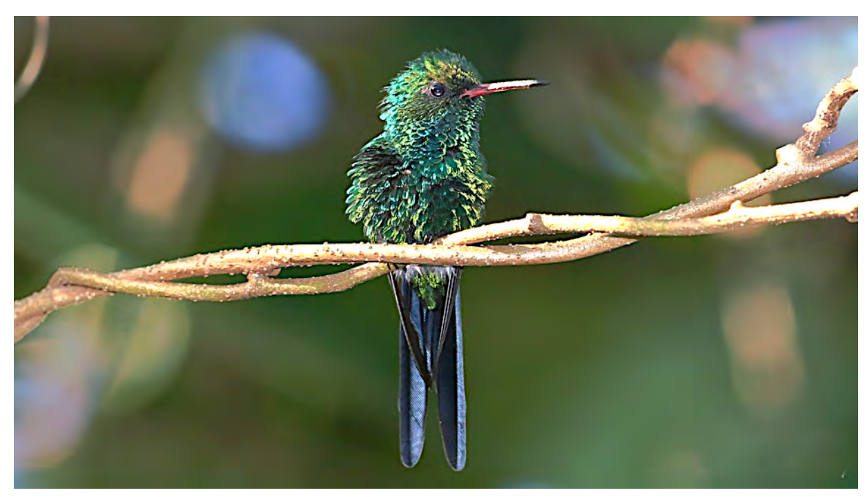
One of the endemics we'll find on Cozumel is the Cozumel Emerald.