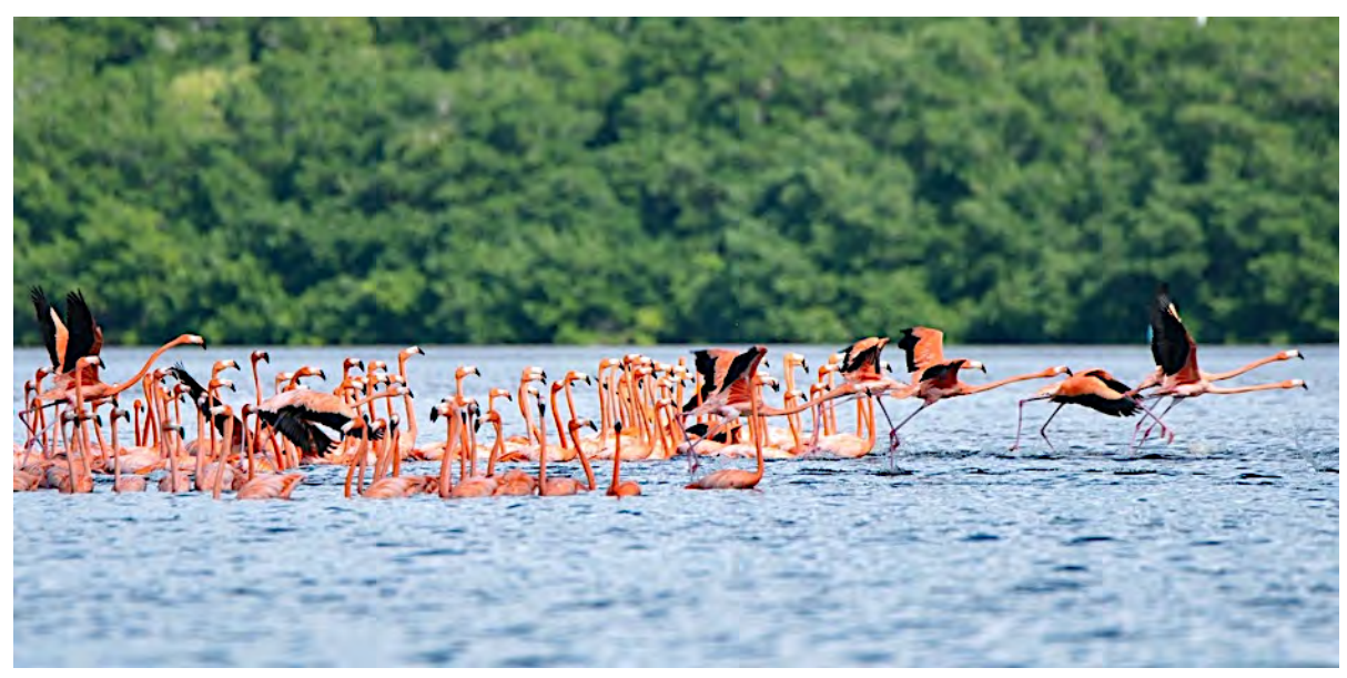
A highlight of this tour is a trip to the Estero de Celestun, where we'll be able to see a wintering flock of brilliant American Flamingos.

We include here information for those interested in the 2023 Field Guides Holiday Mexico: Yucatan & Cozumel tour: