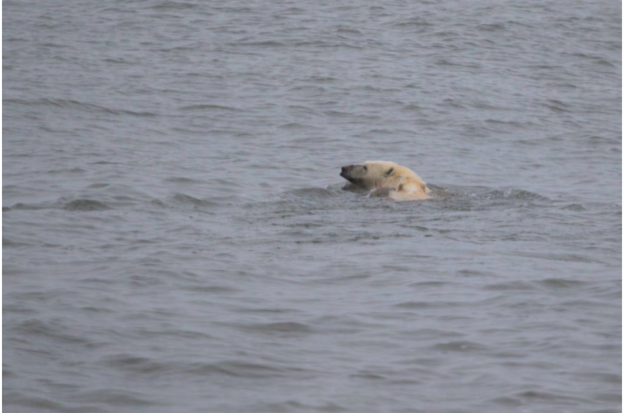
At one point the two Polar Bears were right offshore from us in our vehicle!

We spent the following day scoping offshore and driving a few of the roads we could manage (but the roads were very icy!). We continued to see Ross's Gulls, migrating to the northeast distantly offshore. More flocks of migrating ducks were seen including hundreds of Long-tailed Ducks and more Common Eiders. Nearby in the short willowy habitat, we found a flock of Willow Ptarmigan. Offshore, we saw Yellow-billed and Pacific loons migrating south and getting to see some swimming Yellow-billed was a real highlight.