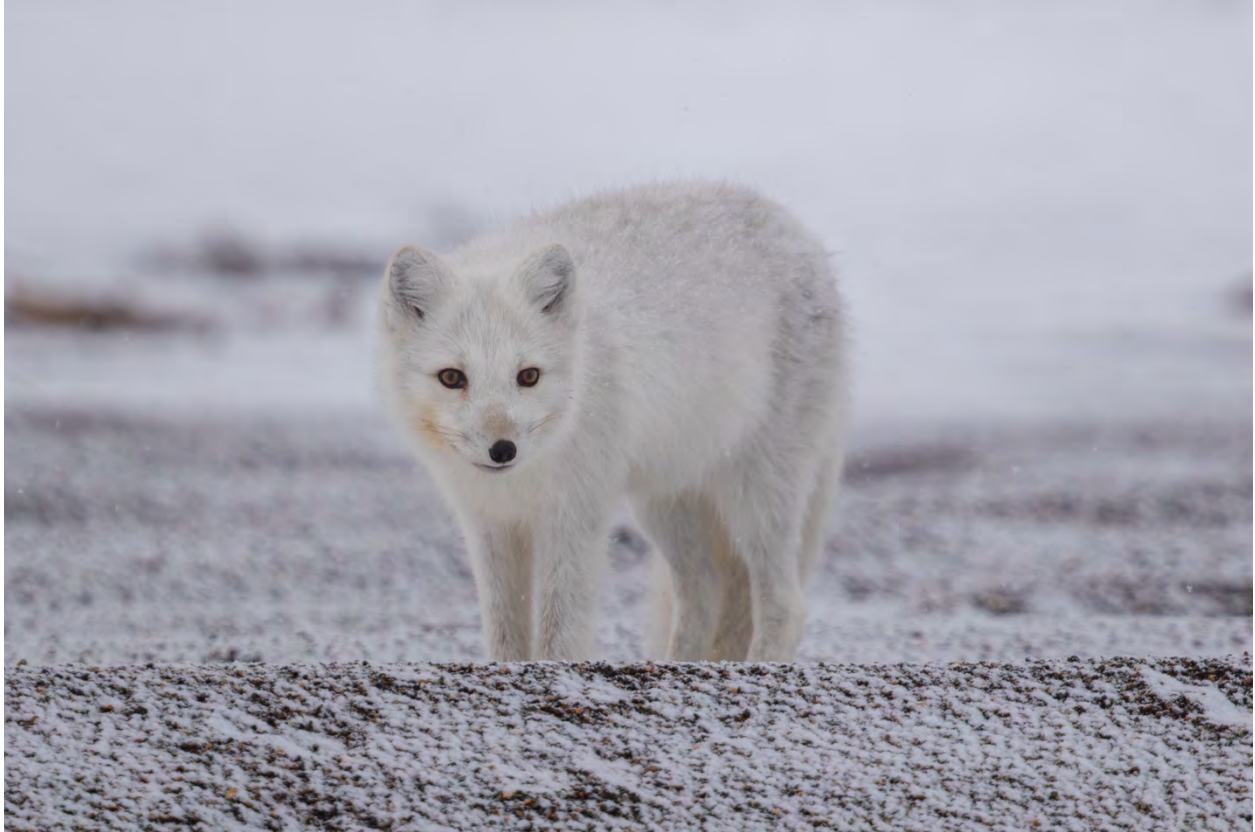
The Arctic Foxes were both curious and rather adorable in their winter coats.

Our flight up to Barrow was uneventful and we got underway immediately after getting bundled up. Scoping offshore, we saw distant Ross's Gulls (30-40!), migrating Long-tailed Ducks and Common Eiders, and nearly 1000 Glaucous Gulls lining the ground where the whaling was taking place. It was really quite interesting to see so many Short-tailed Shearwaters as well, and we ended up seeing hundreds!