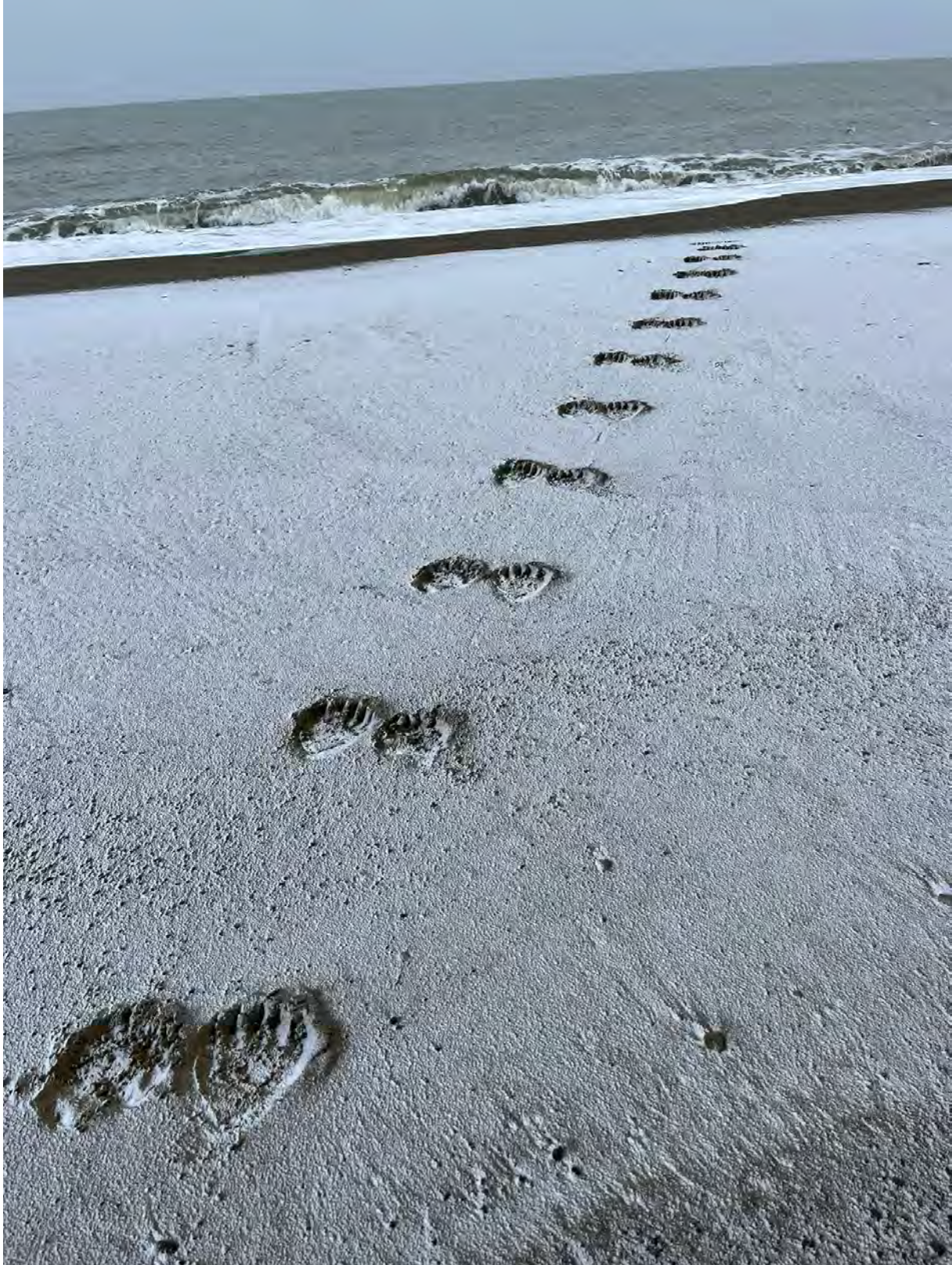
There were plenty of signs that there were even more Polar Bears around that we couldn't see. Here are some prints leading off into the ocean and the bears couldn't have been that far away.