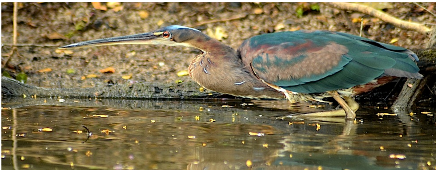
Is there a better place than Crooked Tree to see the scarce and elusive Agami Heron? This is one of 4 of these dagger-billed beauties that we saw there.

For our tour description, itinerary, past triplists, dates, fees, and more, please VISIT OUR TOUR PAGE .