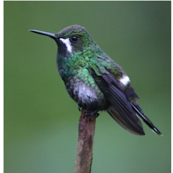
After tanking up at the Milpe feeders, a female Green Thorntail cooperatively poses for the cameras.

TAWNY-BELLIED HERMIT ( Phaethornis syrmatophorus )