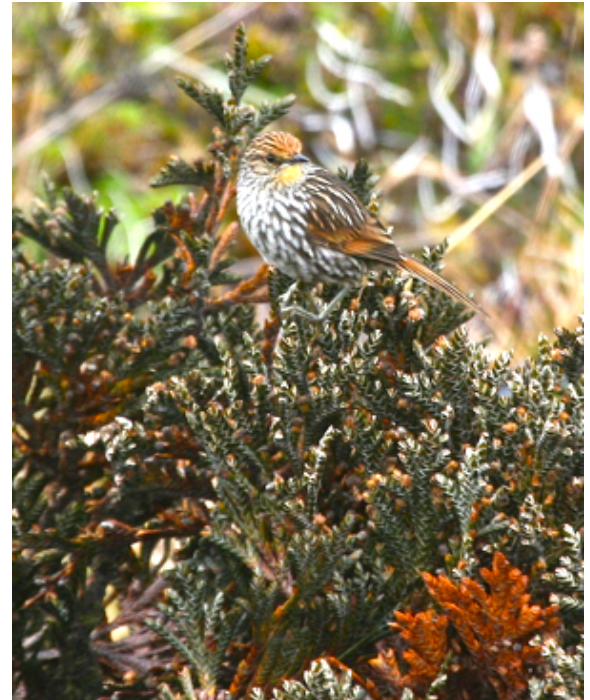
The bold stripes and muted colors of a Many-striped Canastero are not only beautiful, but they perfectly match the colors and patterns of its scrubby, paramo habitat.