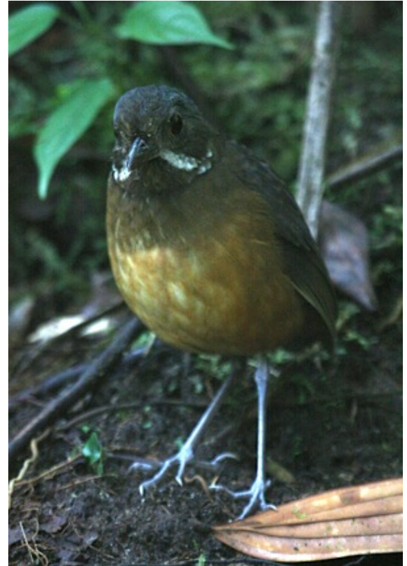
Places such as "Paz de las Aves" have really revolutionized birdwatching; formerly elusive, almost mythical species like this Moustached Antpitta are now birder-friendly and regularly seen.

PECTORAL SANDPIPER ( Calidris melanotos )