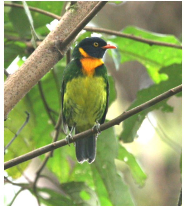
A highlight of the west slope was our stellar view of this brilliant male Orange-breasted Fruiteater!

WHITE-THROATED QUAIL-DOVE ( Geotrygon frenata bourcierii ) – The briefest of looks for some above Tandayapa.