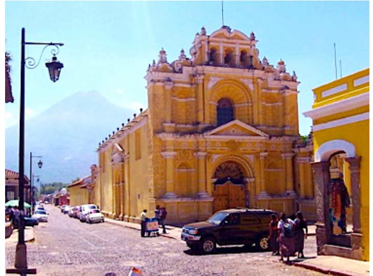
We always make time to take in some of the beautiful architecture of the lovely old city of Antigua.

TURQUOISE-BROWED MOTMOT ( Eumomota superciliosa ) – The "Mot" is my namesake. Indeed, this is a sharp,