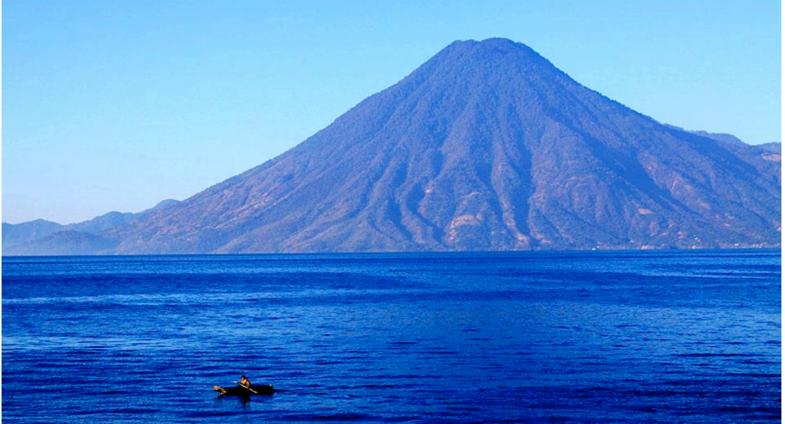
The impressive cone of Volcan San Pedro dominates the skyline above Lake Atitlan.