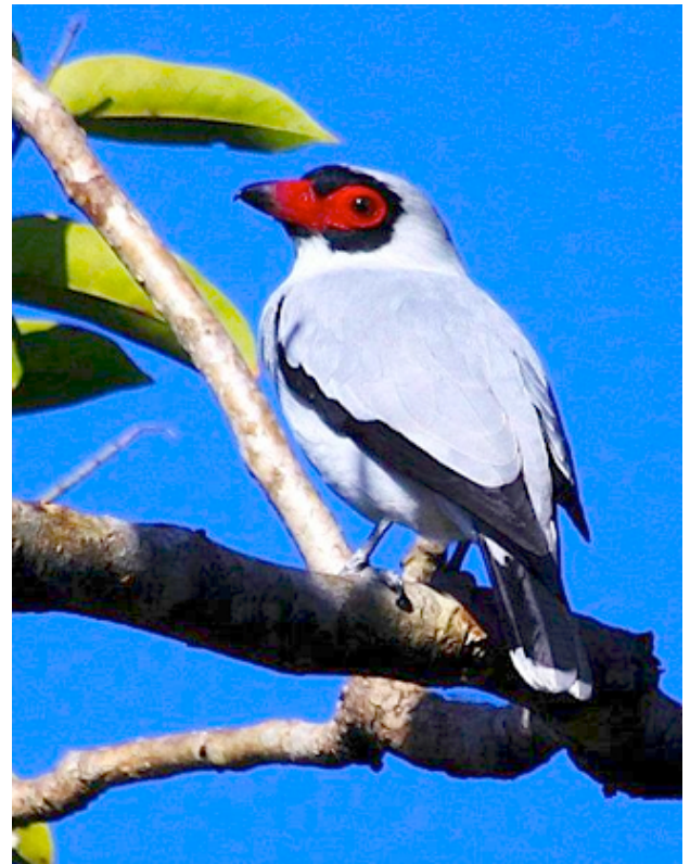
Masked Tityras are widespread through the American tropics, and a common sight, given their brilliant white plumage and tendency to sit on high exposed perches.

NORTHERN BENTBILL ( Oncostoma cinereigulare )