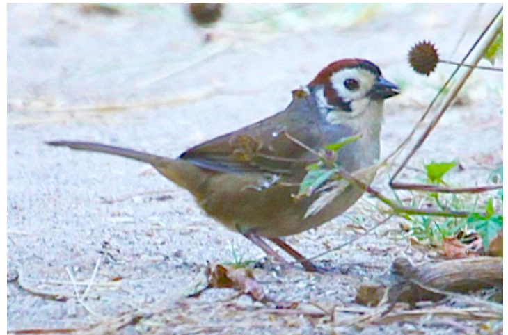
The northern population of Prevost's Ground-Sparrow may be specifically distinct from the isolated population in Costa Rica. Besides plumage and vocal differences, the birds here also seem easier to see!

BROWN-CAPPED VIREO ( Vireo leucophrys ) – Nice looks directly above our heads while in the pine-oak forest at Pilar.