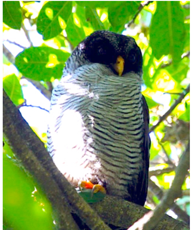
This splendid Black-and-white Owl was a super find on a day roost at Los Tarrales.

ZONE-TAILED HAWK ( Buteo albonotatus ) – One at Finca Las Nubes flew over close while we birded near the cabins. They sure do look like Turkey Vultures.