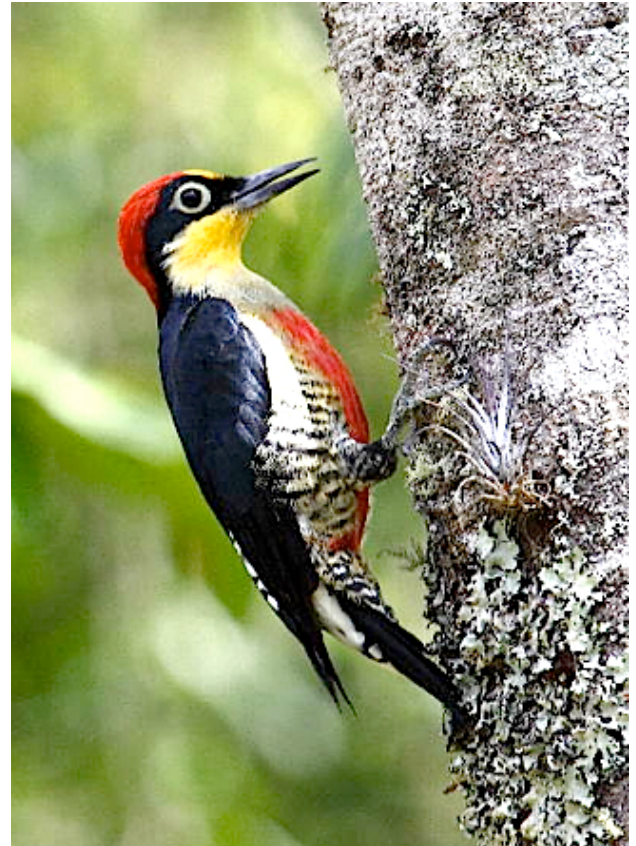
The handsome Yellow-fronted Woodpecker was a regular visitor to feeders around the lodge at Intervalles, and was just one of 15 species of woodpeckers seen (and another heard) on this tour!