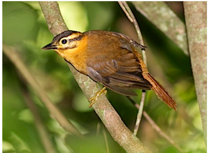
Foliage-gleaners are, for the most part, a fairly homogeneous (and rather drab) group of birds. However, there are several notable exceptions, including the gorgeous Black-capped Foliage-gleaner seen here.

RUSTY-BREASTED NUNLET ( Nonnula rubecula )