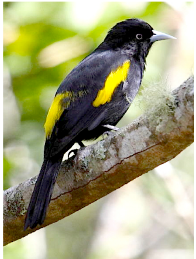
Golden-winged Cacique is a widespread species throughout southeastern South America.