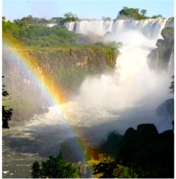
The thundering falls at Iguazu are always a highlight of the trip; the birding here isn't bad either!