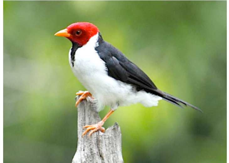
Ironically, the beautiful Yellow-billed Cardinal, along with the 5 other species in the genus Paroaria, are not true cardinals at all, and have recently been moved from the Cardinalidae to the Emberizidae.

BLUE-BLACK GRASSQUIT ( Volatinia jacarina )