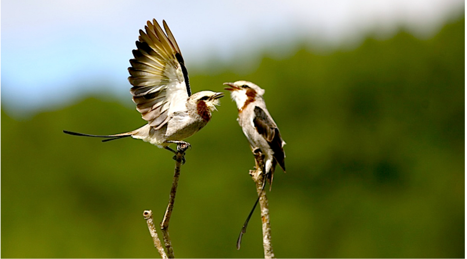
En route to Intervales on our first morning afield, we were treated to point-blank views of this marvelous pair of Streamer-tailed Tyrants displaying near the road!

Mar 17, 2012 to Mar 31, 2012 Marcelo Padua & John Coons