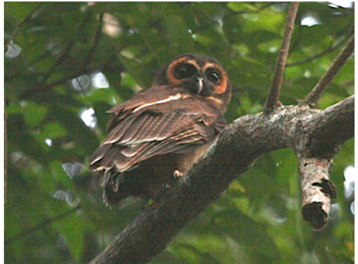
A paranoid glance over his shoulder confirms this Brown Wood-Owl's suspicions... there is someone watching him!