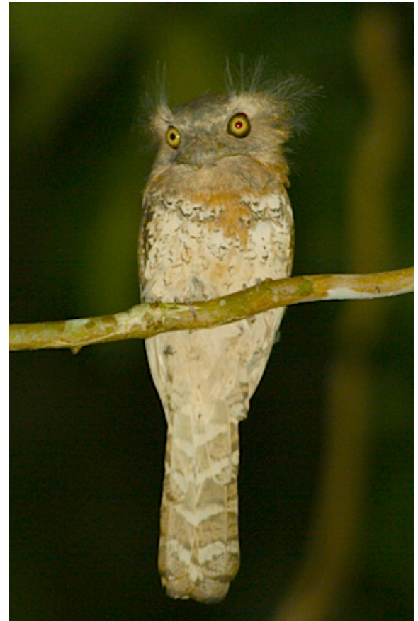
This Javan Frogmouth looks like it's had a pretty rough night, though it is likely thinking the same about us!